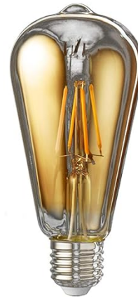
LED Vintage Filament

Note: Dimmable if used with a compatible dimmer switch. An LED Bulb must be listed as dimmable.