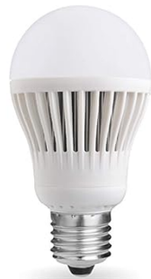
LED and Color Changing