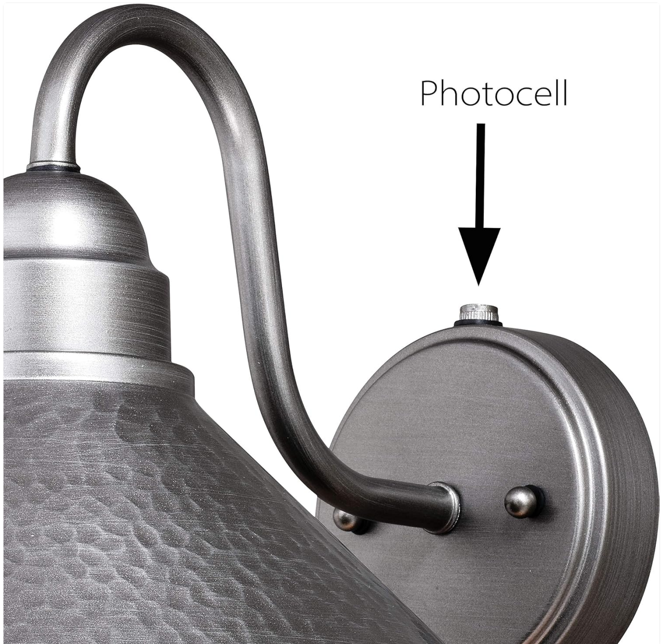
Figure 5.2: Close-up view of the photocell sensor located on the fixture's base.