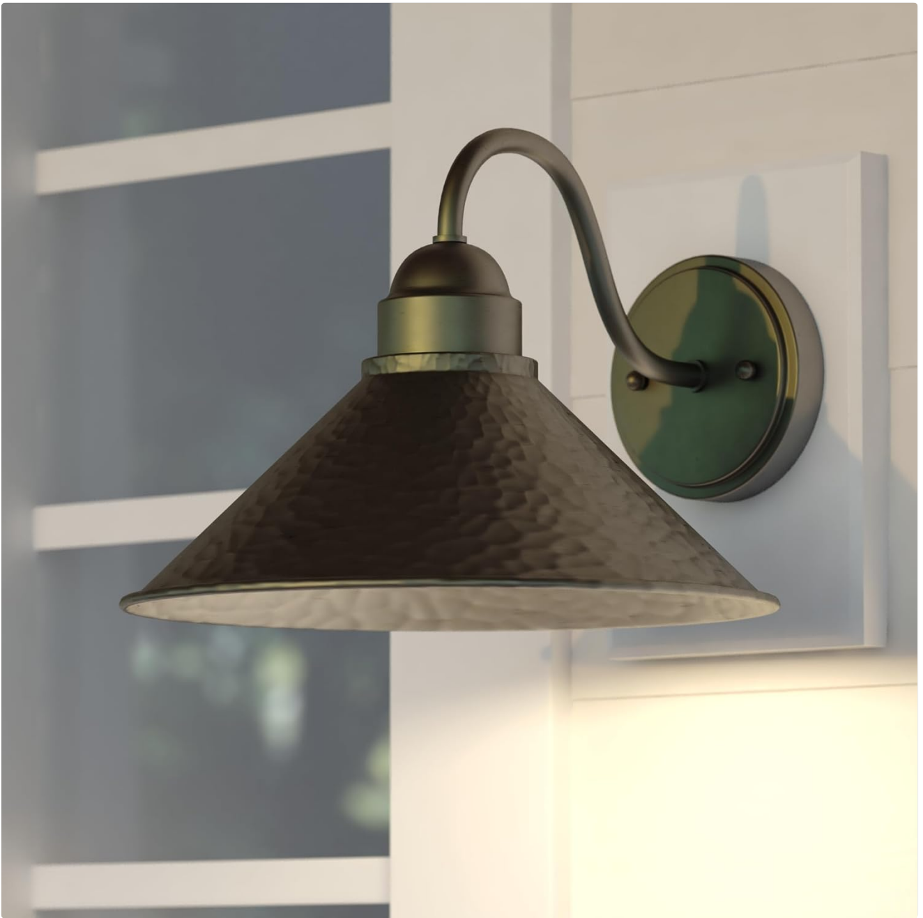
Figure 4.1: Example of the VAXCEL T0494 fixture installed on an exterior wall.