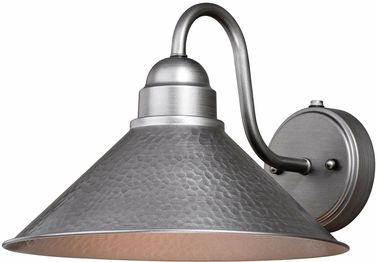
Figure 1.1: VAXCEL T0494 Outland Outdoor Wall Mount Light, Brushed Pewter Finish.