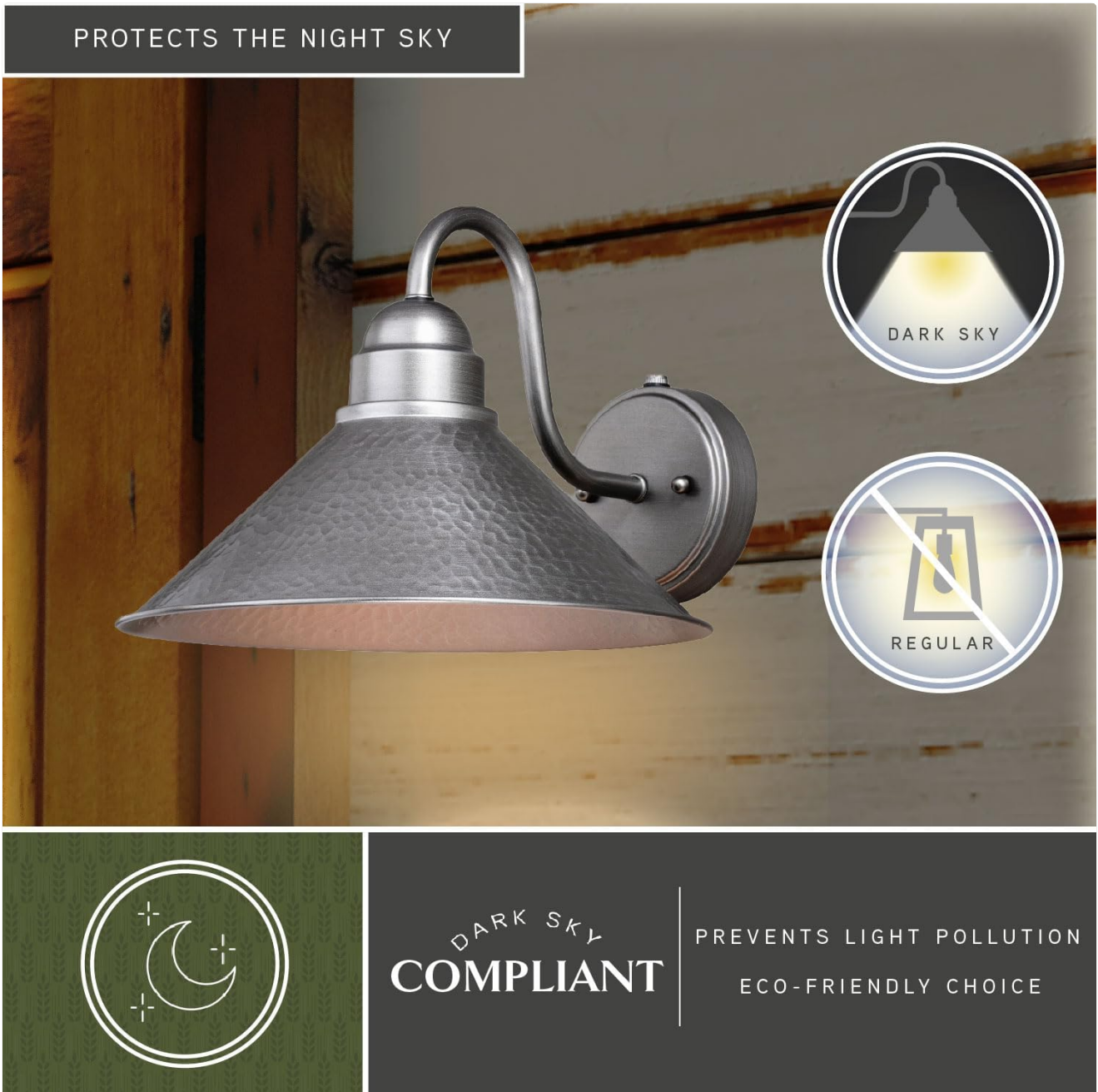
Figure 8.2: Explanation of the dark-sky compliant design, which prevents light pollution.