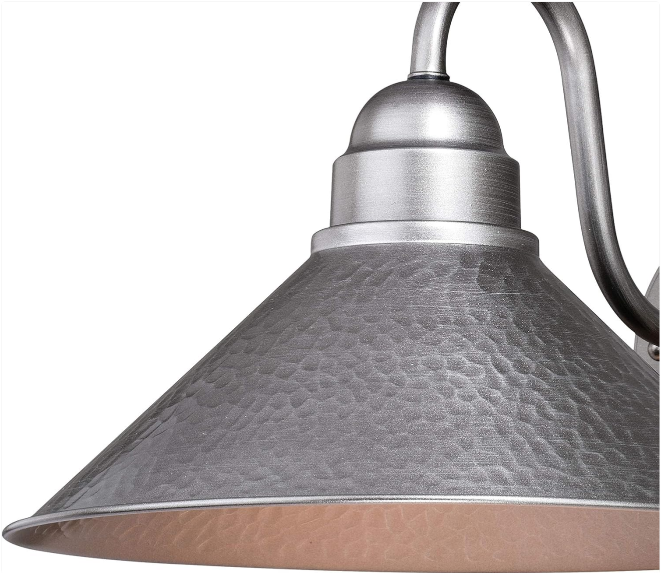
Figure 6.1: Close-up of the brushed pewter finish and hammered shade texture, highlighting areas to clean gently.