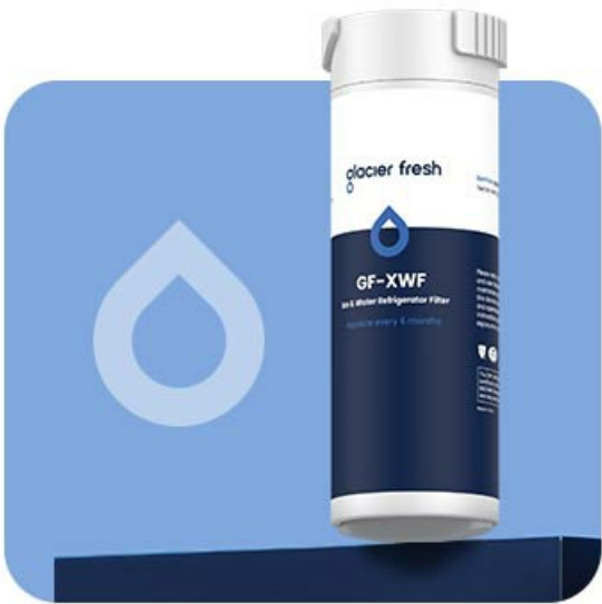
Image: Detailed visual steps for installing the GLACIER FRESH XWF water filter.

Your browser does not support the video tag.