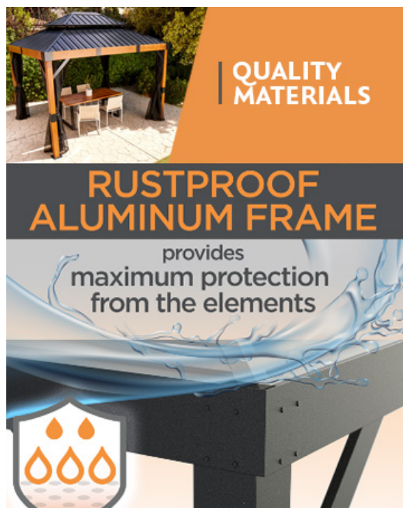
Image: Visual representation of the rustproof aluminum frame, highlighting its resistance to elements like water.