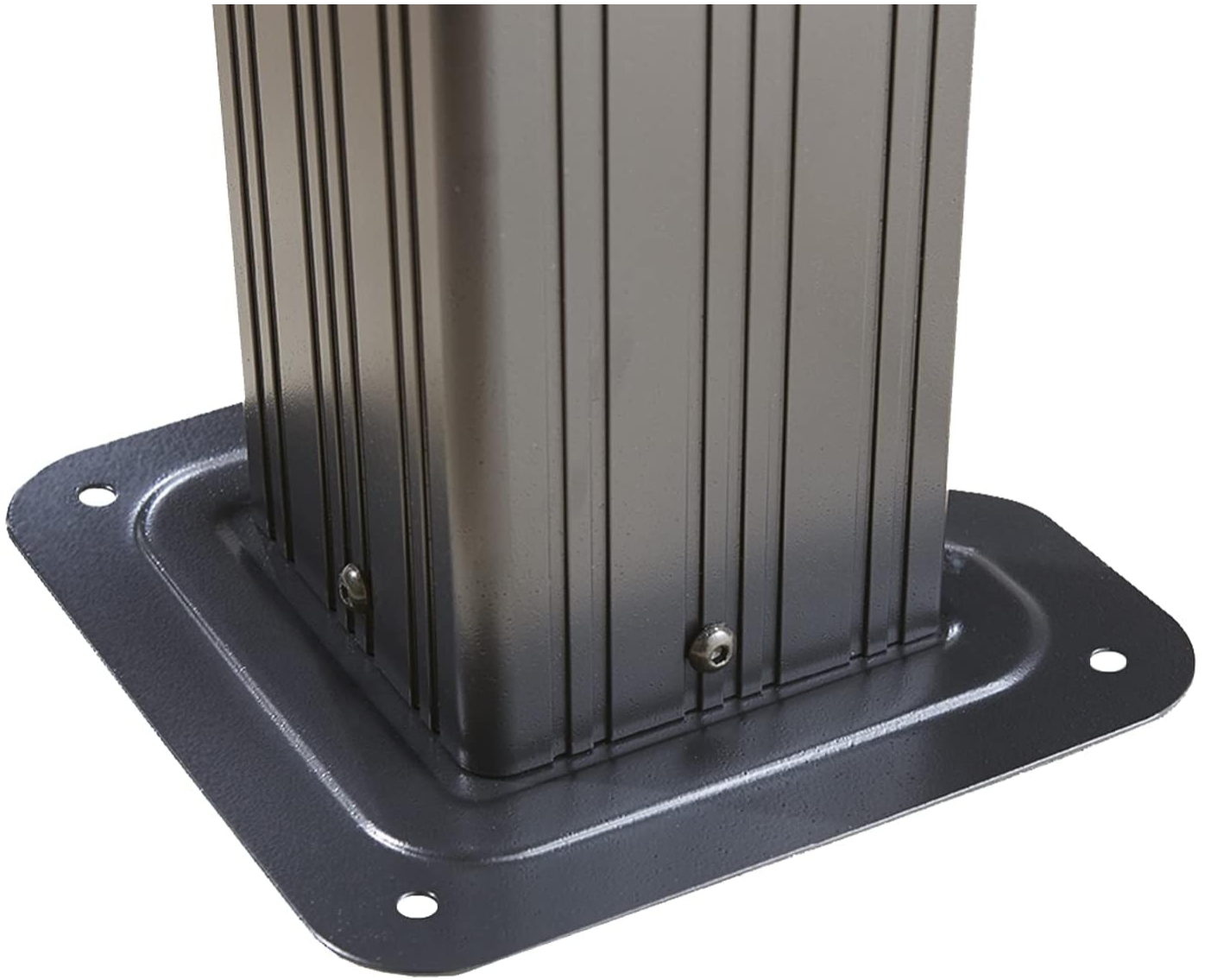
Image: A detailed shot of the gazebo's base plate and column, showing the anchoring points and robust construction.