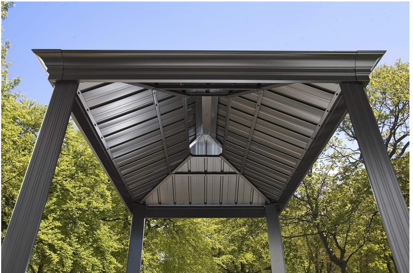
Image: An upward view showing the underside of the galvanized steel roof panels and the internal frame structure.