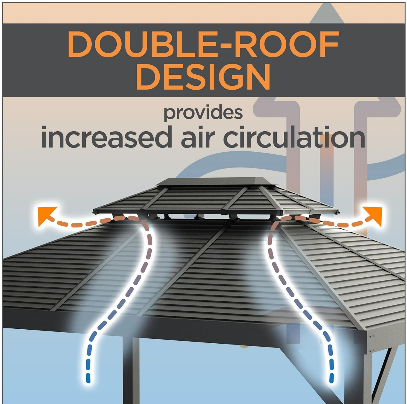
Image: Illustration of the double-roof design, showing how it provides increased air circulation for comfort and safety.