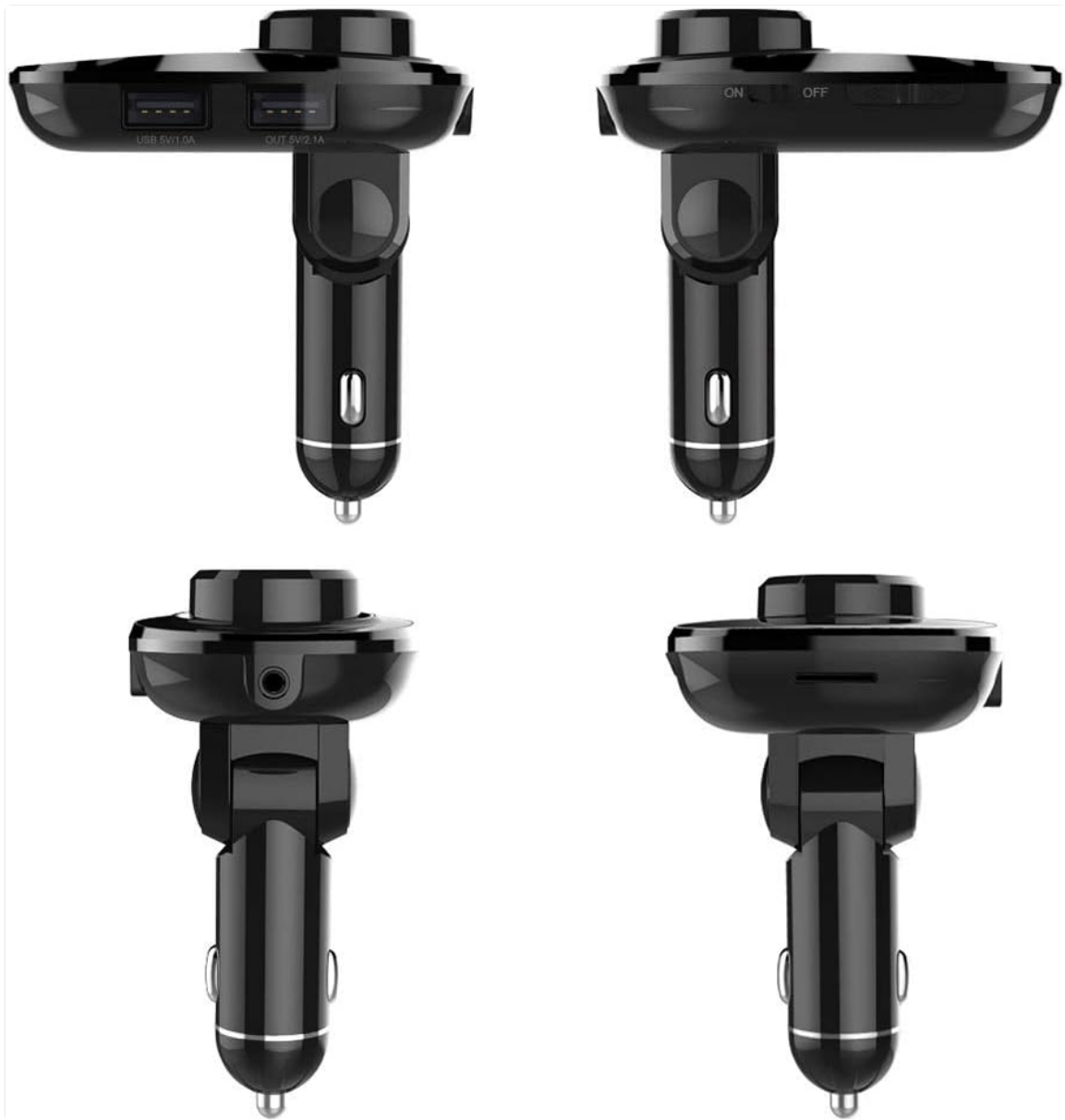
Image 3: Side view of the FMT-B3, illustrating the dual USB charging ports and the MicroSD card slot for media playback.