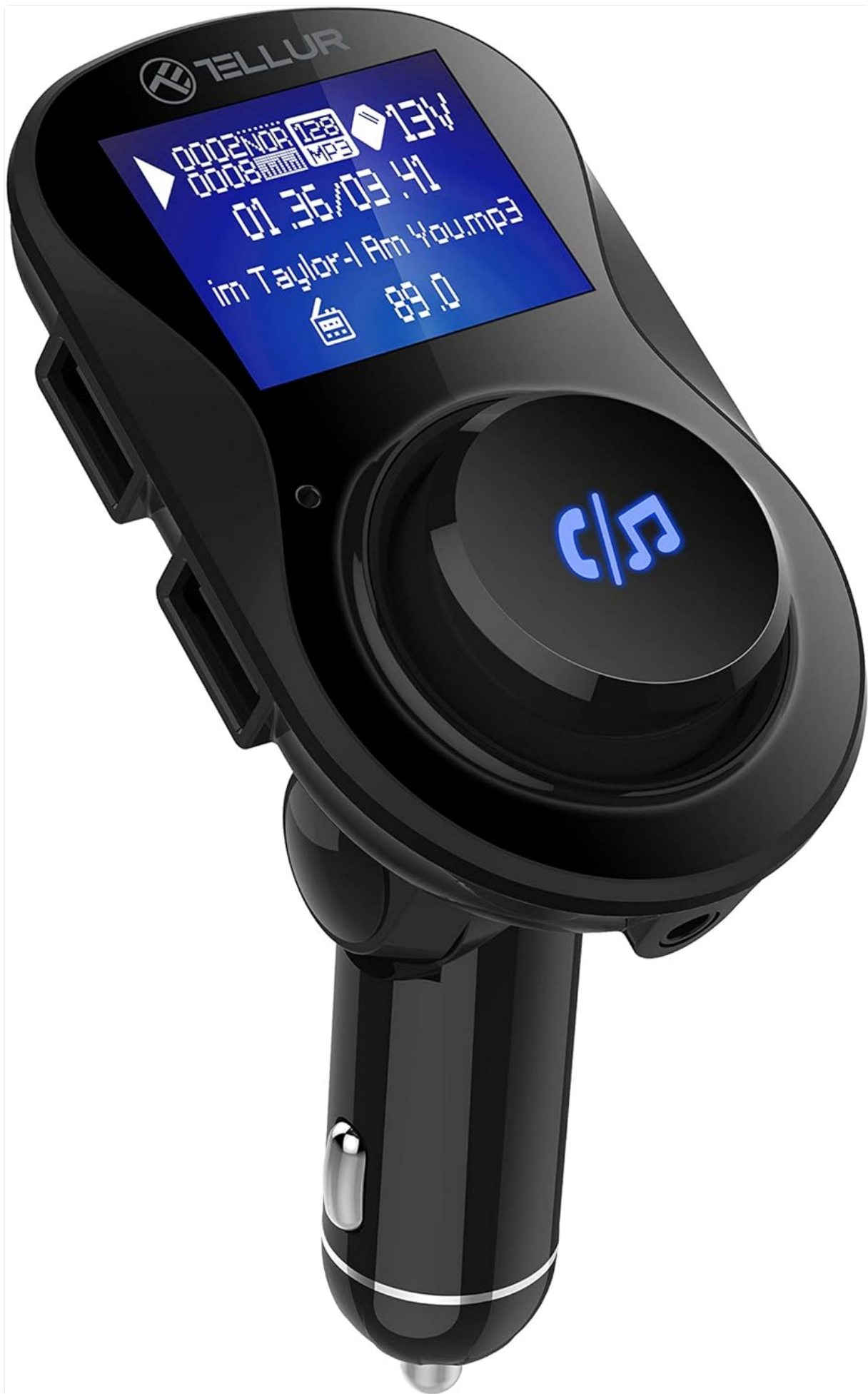
Image 1: Top view of the Tellur FMT-B3 FM Transmitter, highlighting the 1.4-inch display and control knob.