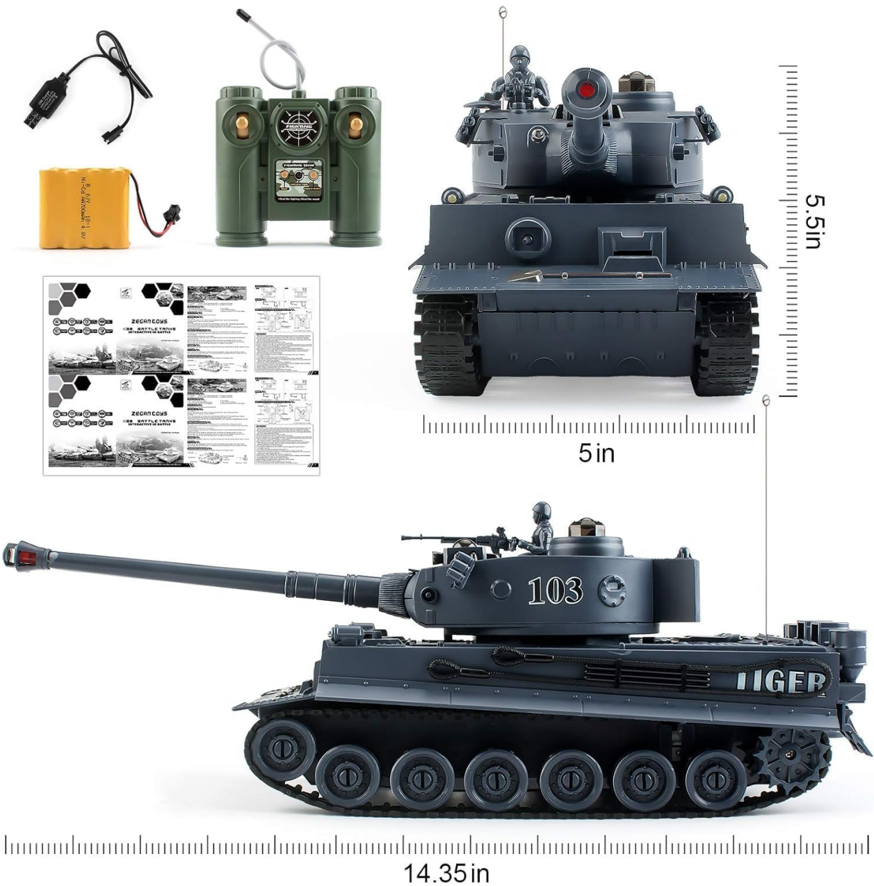
Figure 8.1: Product Dimensions