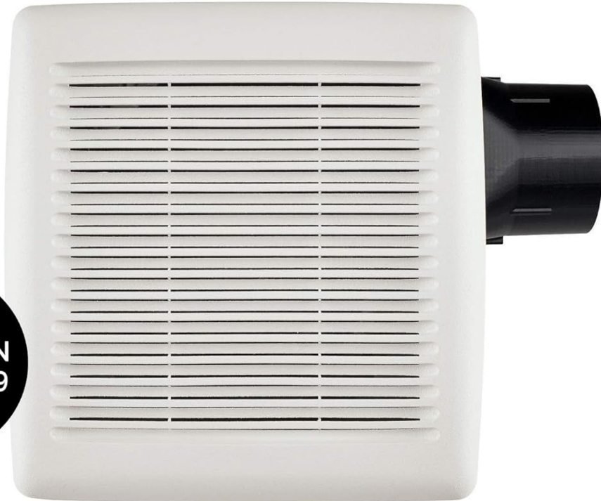
Image: Broan-NuTone Flex DC Series Ventilation Fan, highlighting selectable CFM and quiet operation.