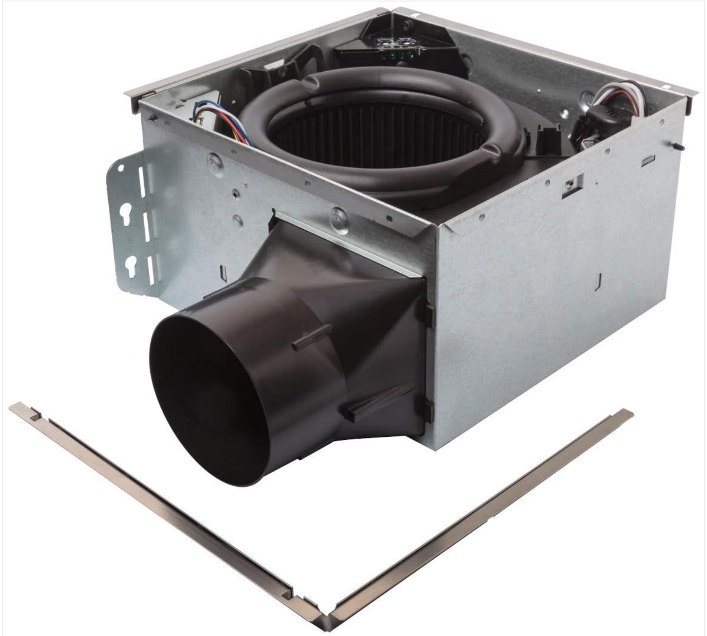
Image: Fan housing with duct connector, ready for installation.