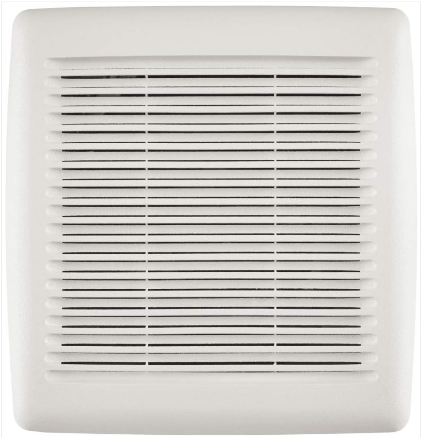
Image: Close-up of the fan grille, which should be regularly cleaned.