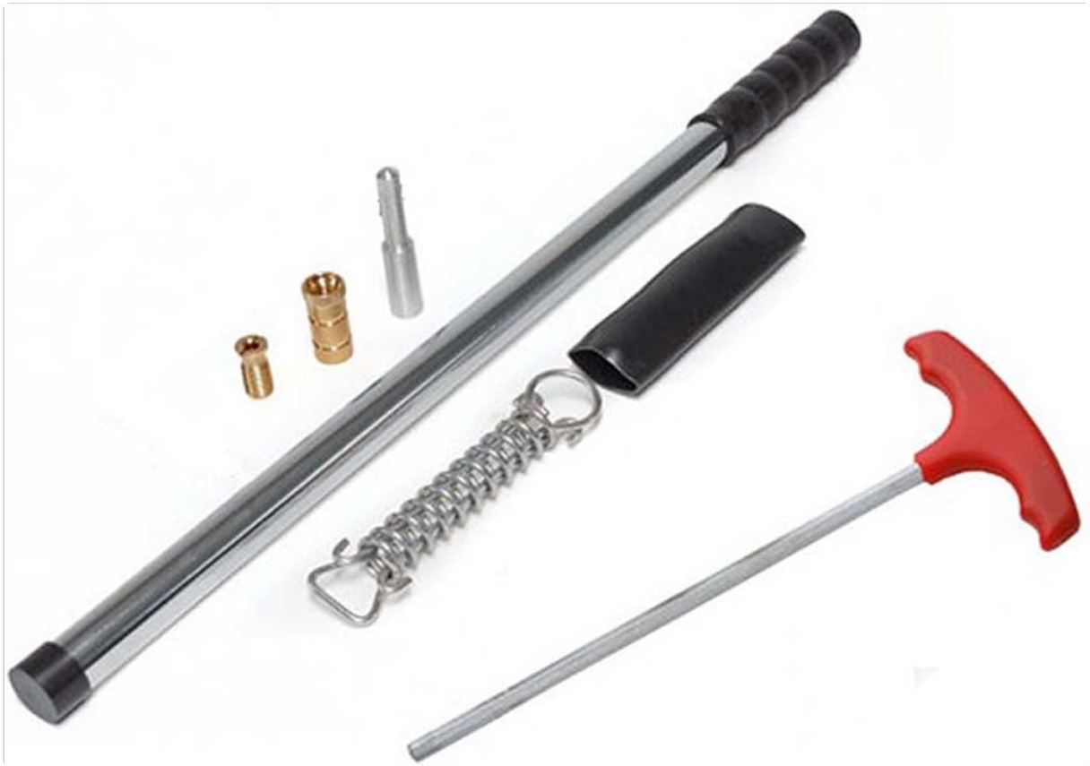
Image: The complete set of installation tools provided with the WaterWarden pool safety cover, including the tamping tool, installation rod, hex key, brass anchors, and springs.