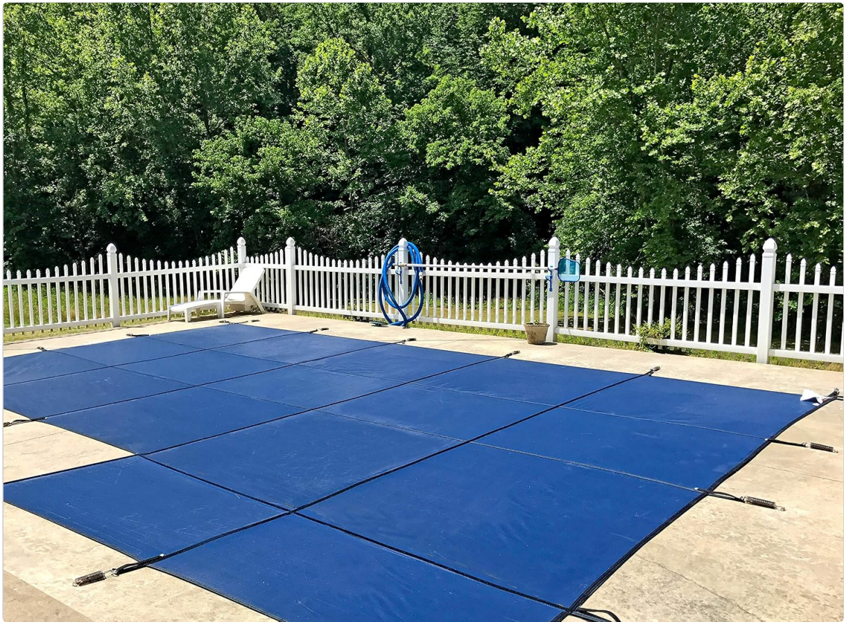
Image: A fully installed WaterWarden Premium Mesh Pool Safety Cover, securely covering an in-ground pool.