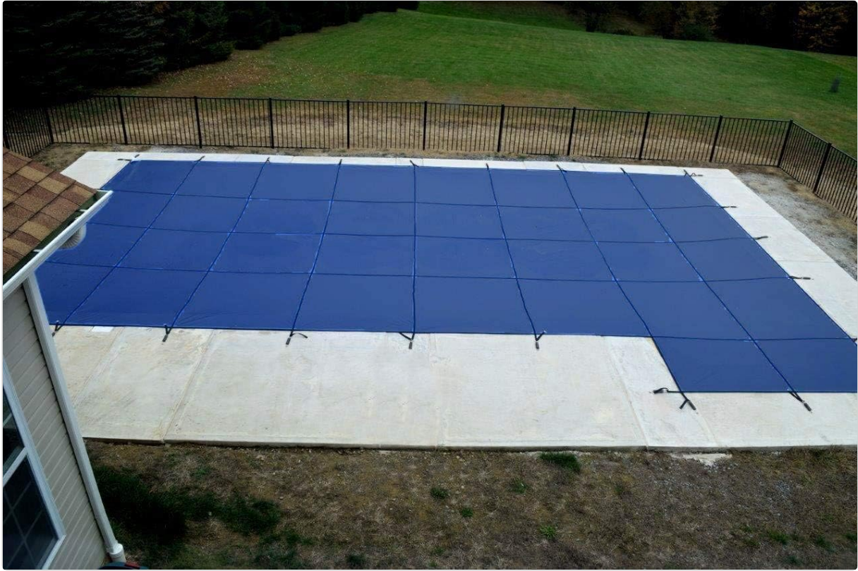
Image: A WaterWarden pool safety cover partially installed on an in-ground pool, demonstrating the attachment of springs to deck anchors.