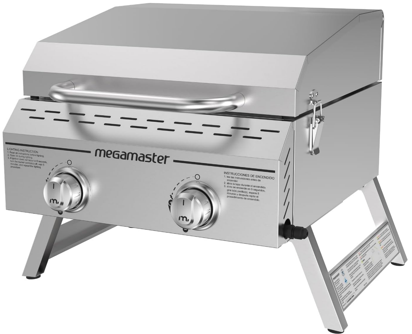
Overall View: The Megamaster 2-Burner Portable Gas Grill with its stainless steel construction and foldable legs, ready for use or transport.