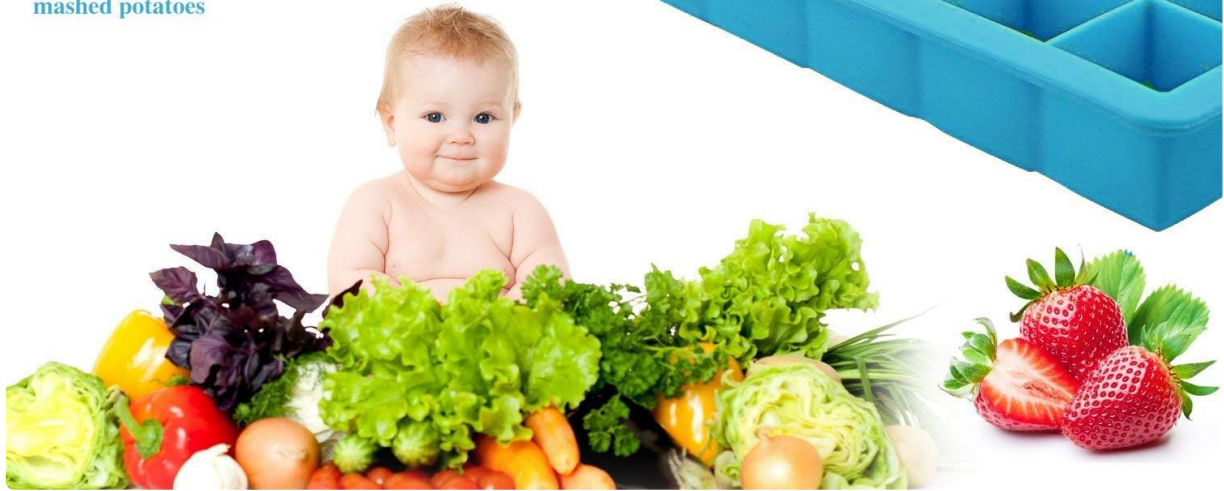
Image: Morfone ice cube tray used for freezing baby food portions.

The perfect storage for strawberry milk, mashed potatoes