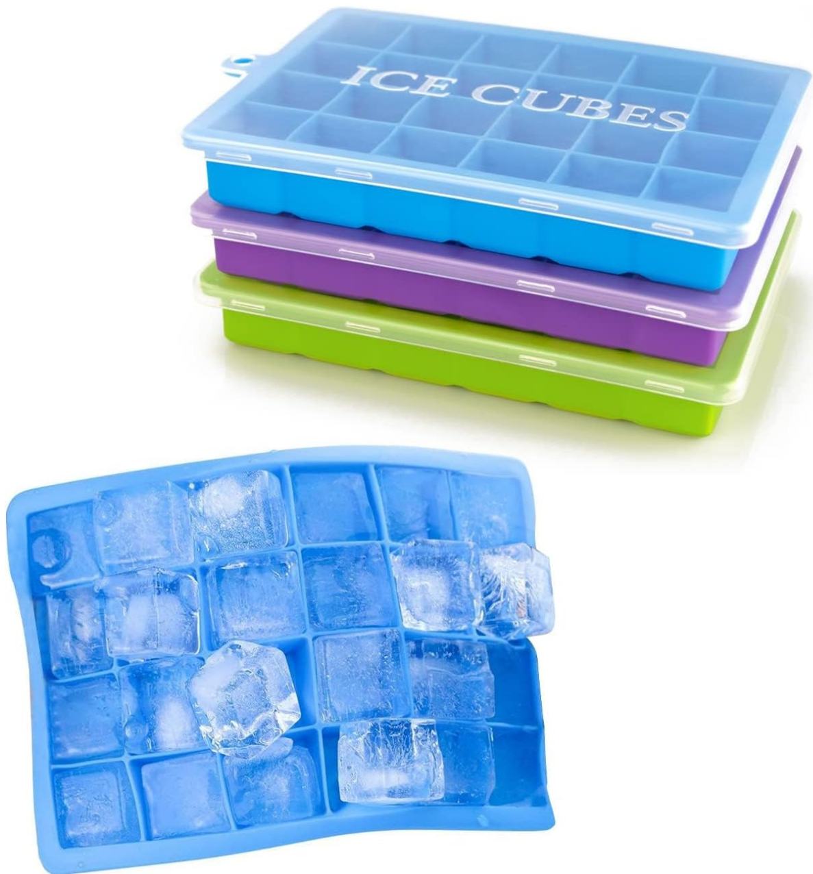
Image: Three Morfone silicone ice cube trays, stacked, with one blue tray containing ice cubes.