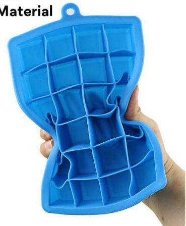
Image: Visual representation of the trays' stackable, flexible, non-stick, and dishwasher-safe features.

Flexible and Soft Food Grade Silicone Safe and Secure Material