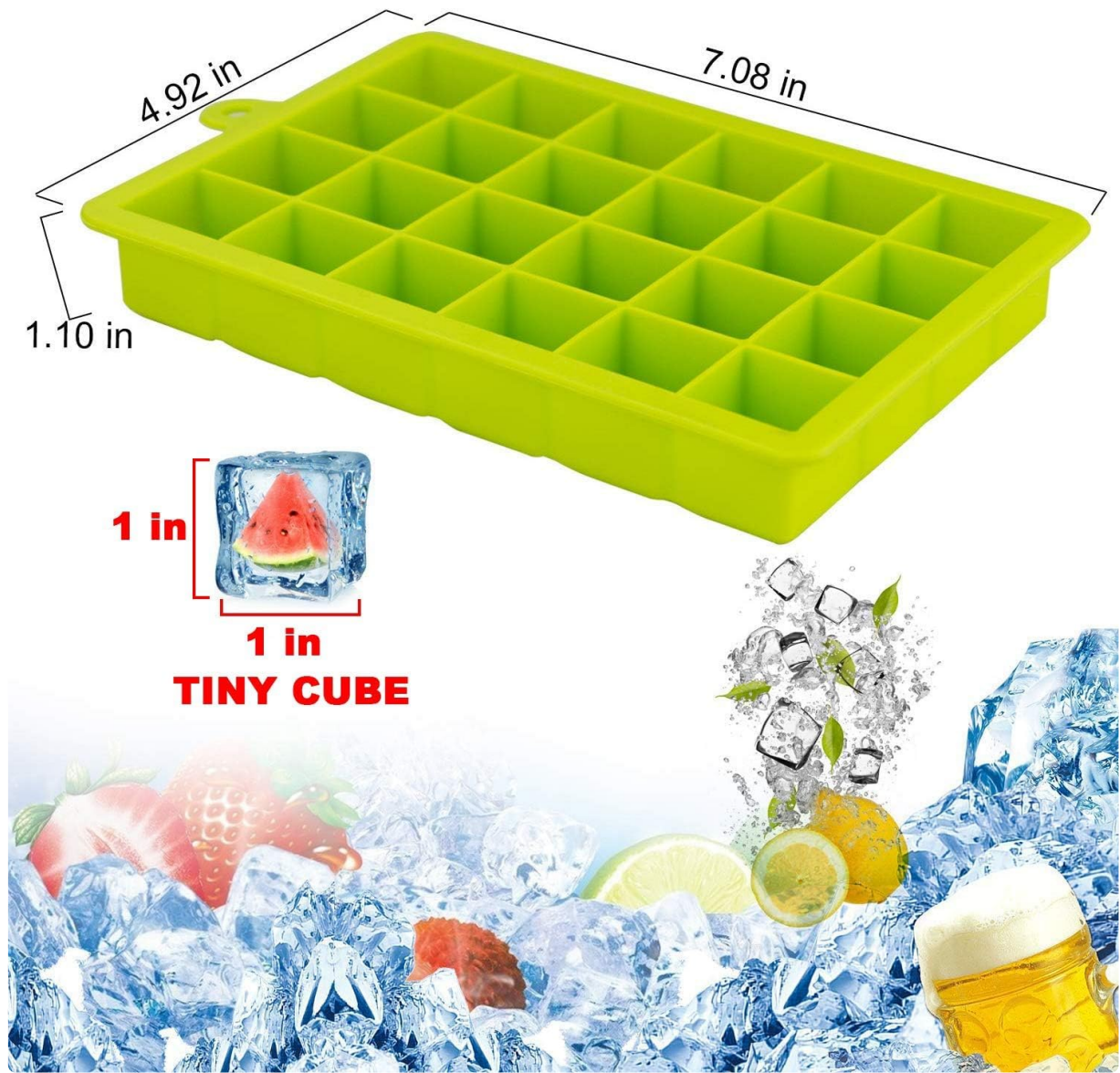
Image: Dimensions of the Morfone silicone ice cube tray and individual cubes.