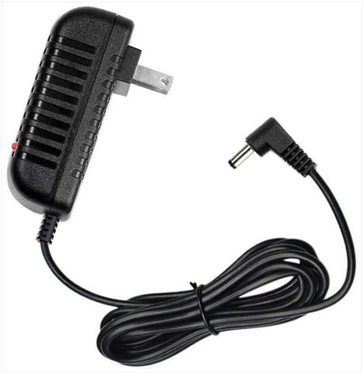
Image 1: The POWE-tech AC/DC Adapter. This image shows the black power adapter with a standard two-prong US plug, a 5-foot long black cable, and a right-angle barrel connector at the end. A small red LED indicator is visible on the adapter body.