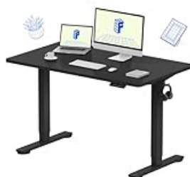
Image 2: A visual guide demonstrating how the desktop can be combined with different types of desk frames or legs to