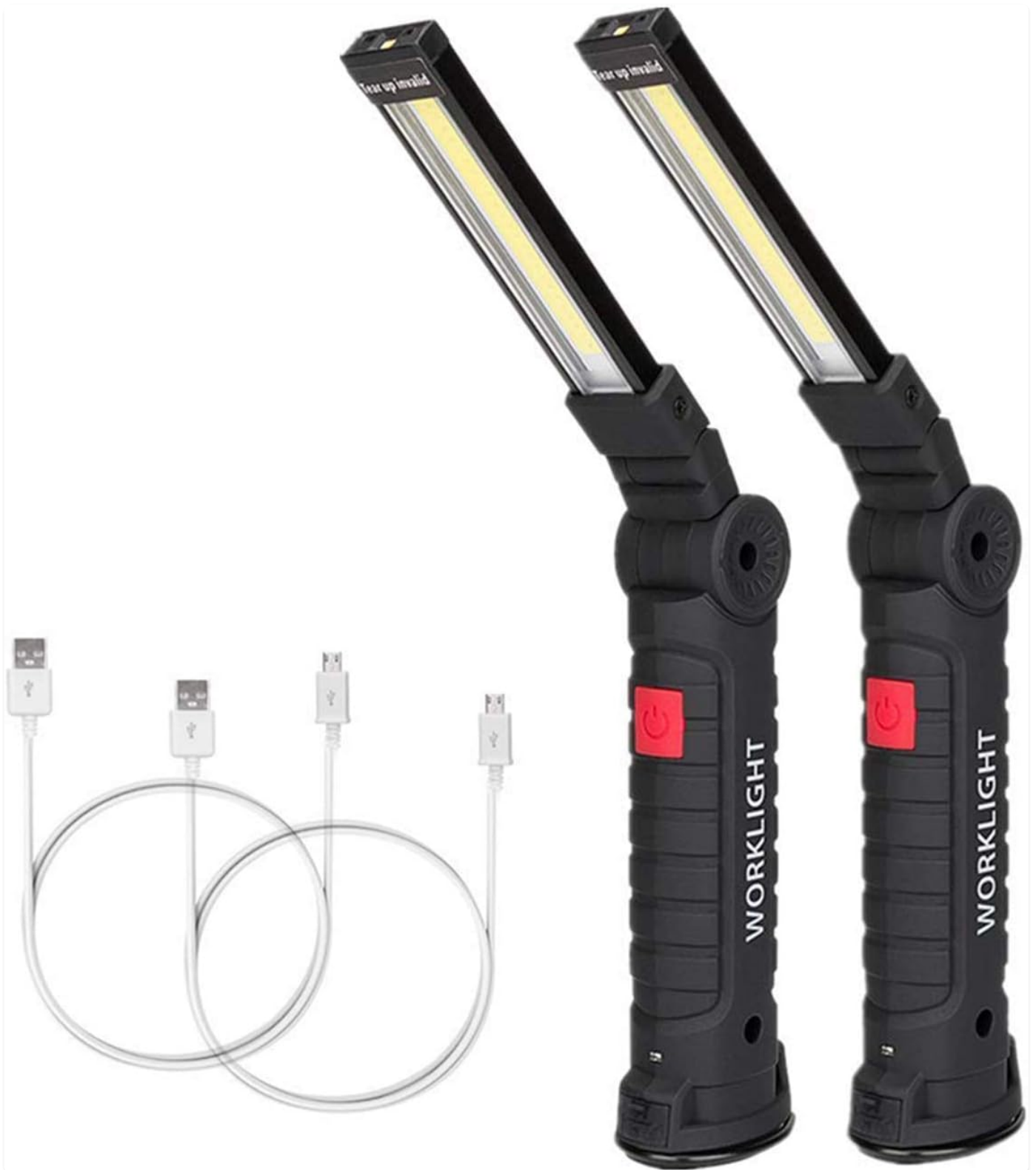
Image: Two OTYTY LED Work Lights, each with a foldable head and magnetic base, shown alongside two USB charging cables.