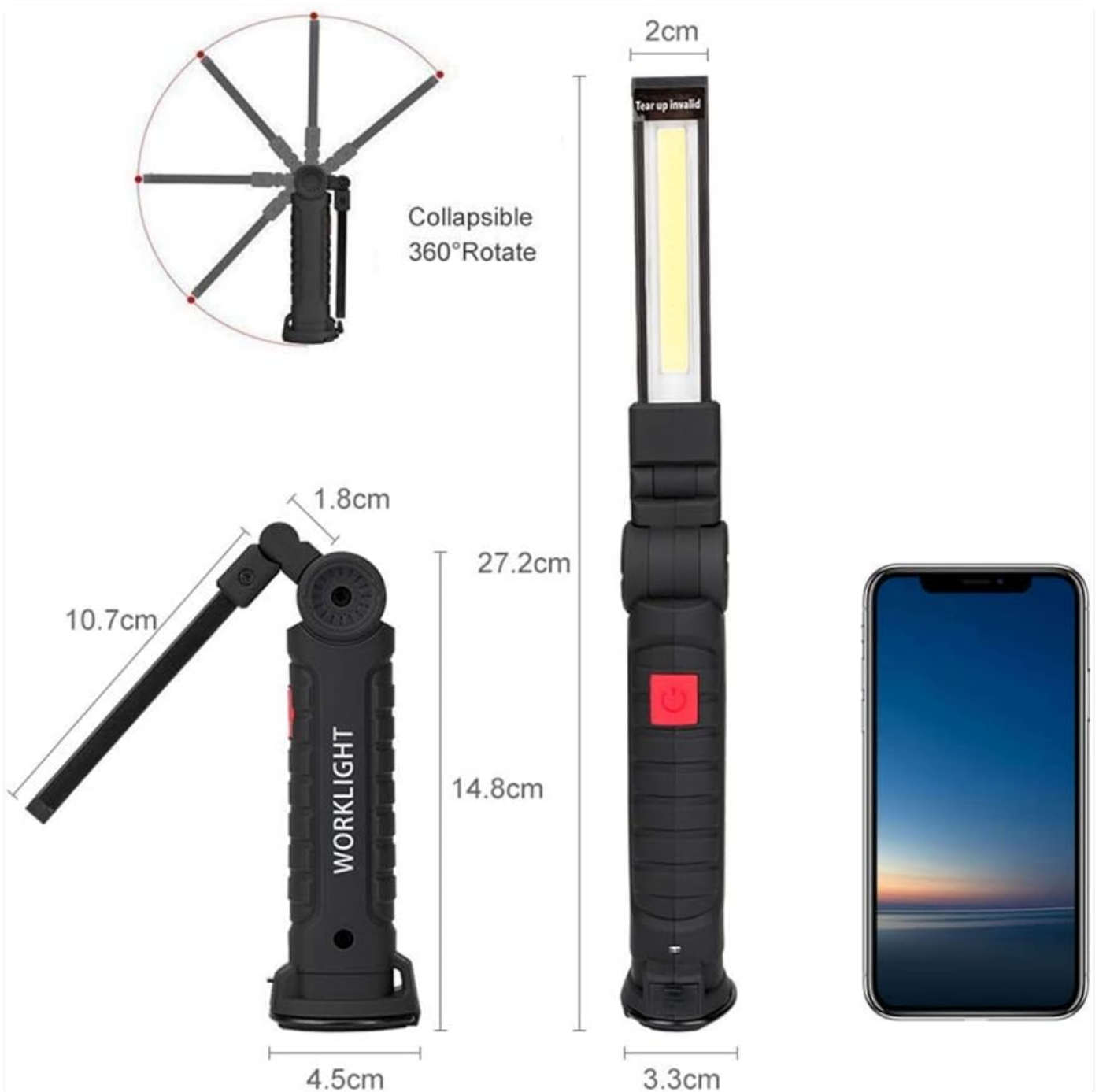
Image: Diagram illustrating the collapsible and 360-degree rotatable design of the work light, highlighting its flexibility and compact dimensions.