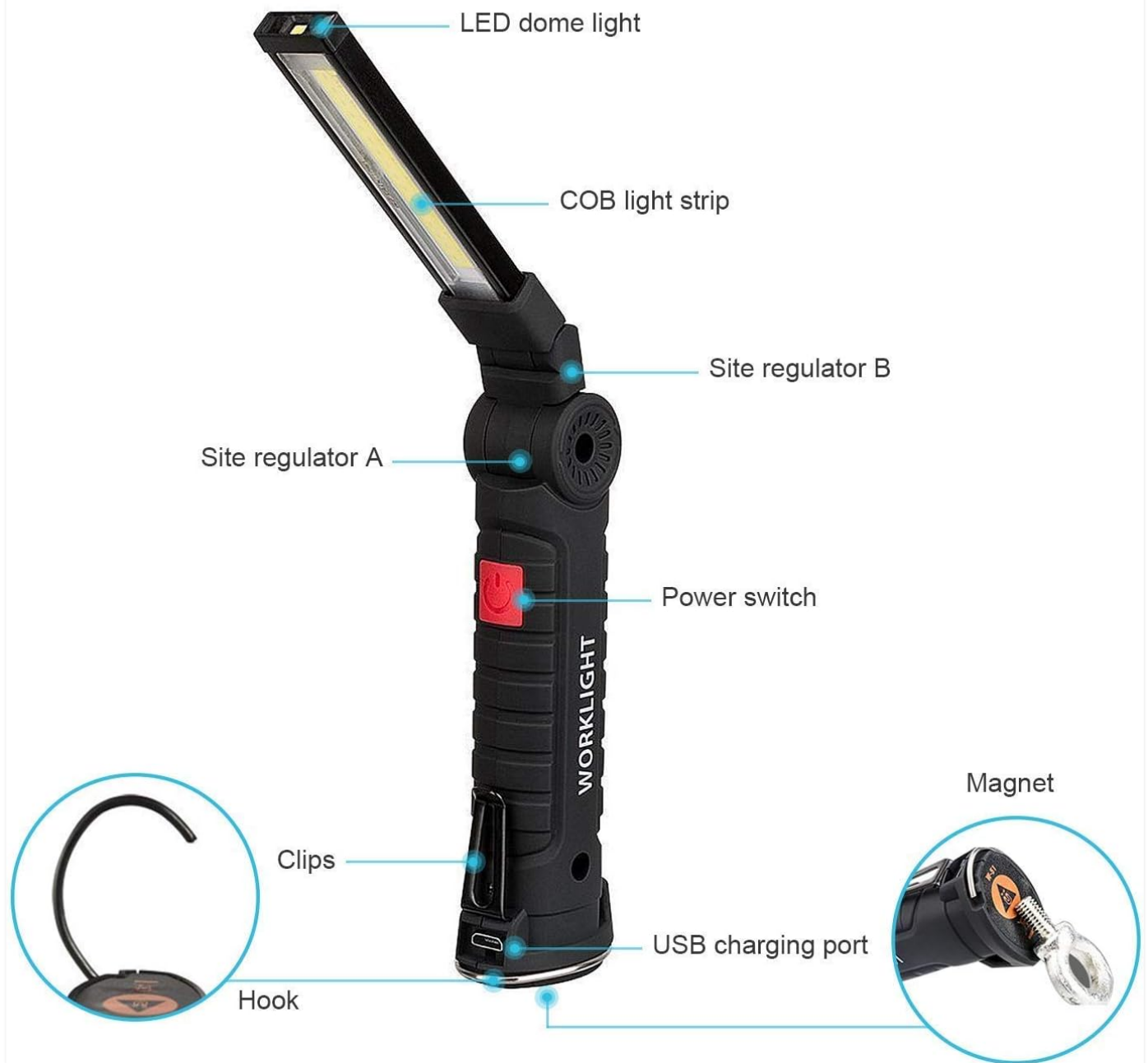
Image: Detailed diagram illustrating the various components of the work light, including the LED dome light, COB light strip, power switch, USB charging port, magnetic base, and hanging hook.

Use High-quality ABS plastic, comfortable hand grip, waterproof and non-slip