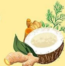
Ginger, Coconut & Turmeric Paste