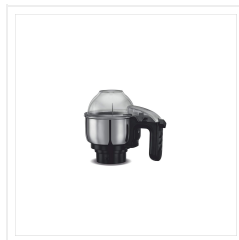
Image: The 0.5 Liter stainless steel jar with its transparent lid and handle.