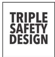
Image: The Preethi Mystic 750W Mixer-Grinder, showcasing the main unit and three stainless steel jars. Key features such as the 5-year motor warranty, powerful 750W motor, secure lid-lock, diamond facet design, and triple safety design are highlighted.