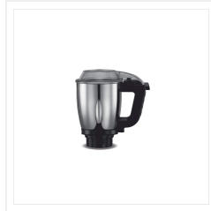
Image: The 1.5 Liter stainless steel jar with its transparent lid and handle.