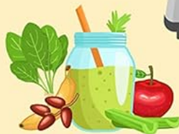
Smoothies & Milkshakes