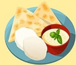
Rice & Lentils Dosa/Idli Batter