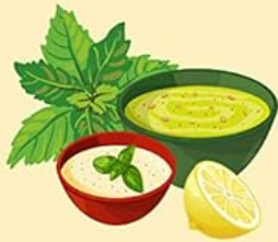
Dips & Chutneys