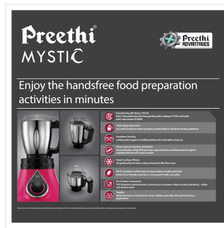
Image: The main motor unit of the Preethi Mystic Mixer-Grinder, featuring the speed control knob and power indicator.