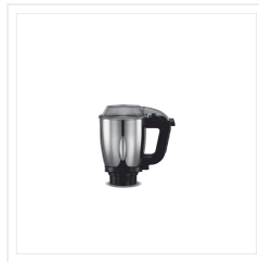
Image: The 1 Liter stainless steel jar with its transparent lid and handle.