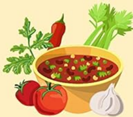
Purées & Soups