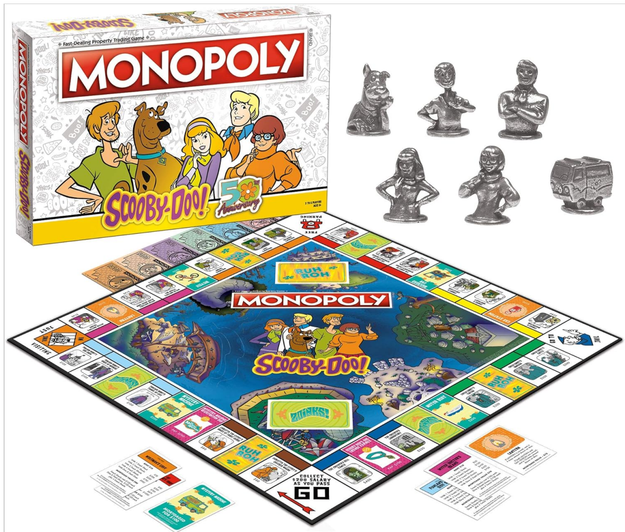
An overview of the game box and all included components, showcasing the board, character tokens, property cards, and game money.