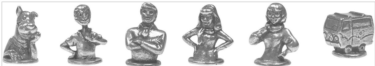
The six collectible metal tokens included in the game: Scooby-Doo, Velma, Shaggy, Daphne, Fred, and the iconic Mystery Machine.