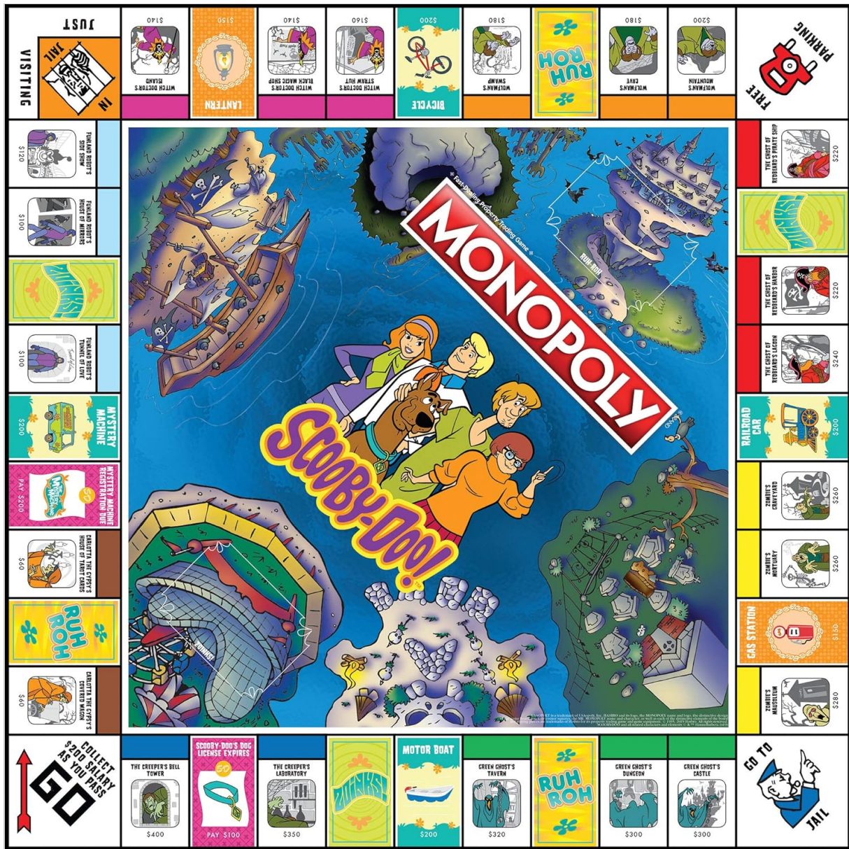
A detailed view of the game board, highlighting the unique Scooby-Doo! themed properties, 'Zoinks!' and 'Ruh-Roh' spaces, and custom artwork.