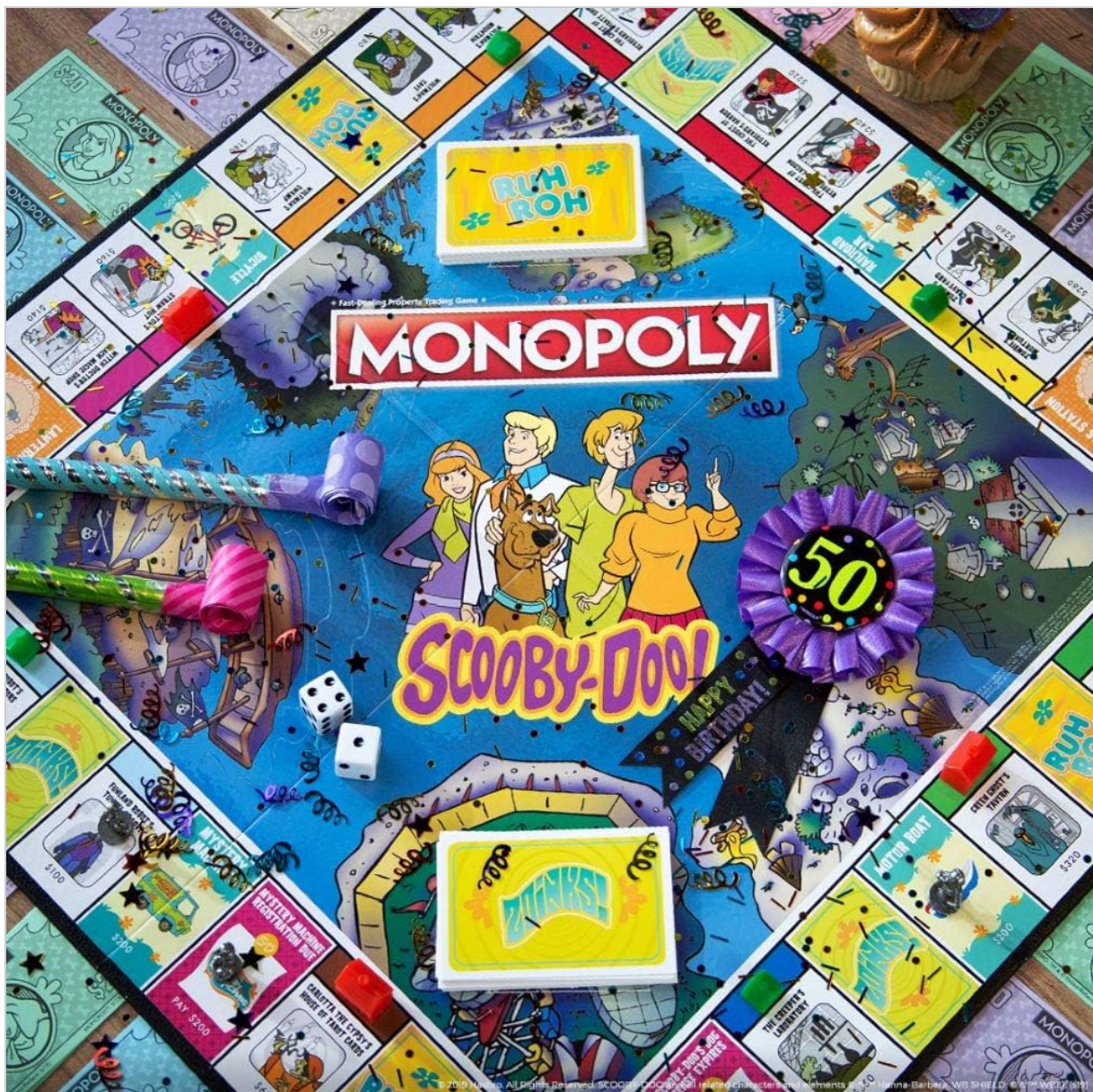
A scene depicting the Monopoly Scooby-Doo! game in play, with dice rolled, tokens on properties, and houses/hotels placed.

Your browser does not support the video tag.