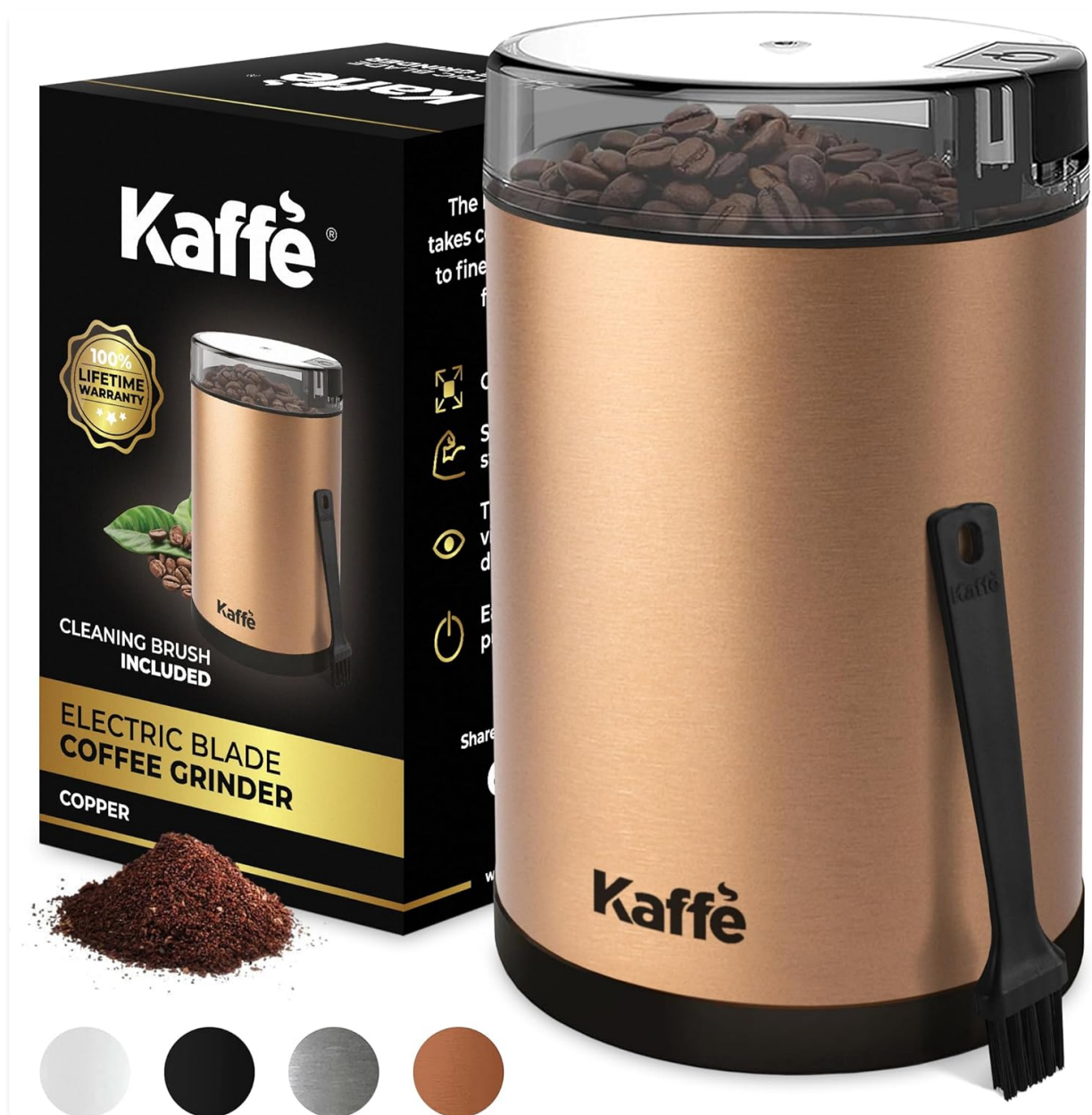
Image 1.1: Kaffè KF2030 Electric Coffee Grinder, Copper model, shown with its packaging and a pile of freshly ground coffee. The image also displays color options (white, black, stainless steel, copper, matte black) at the bottom.