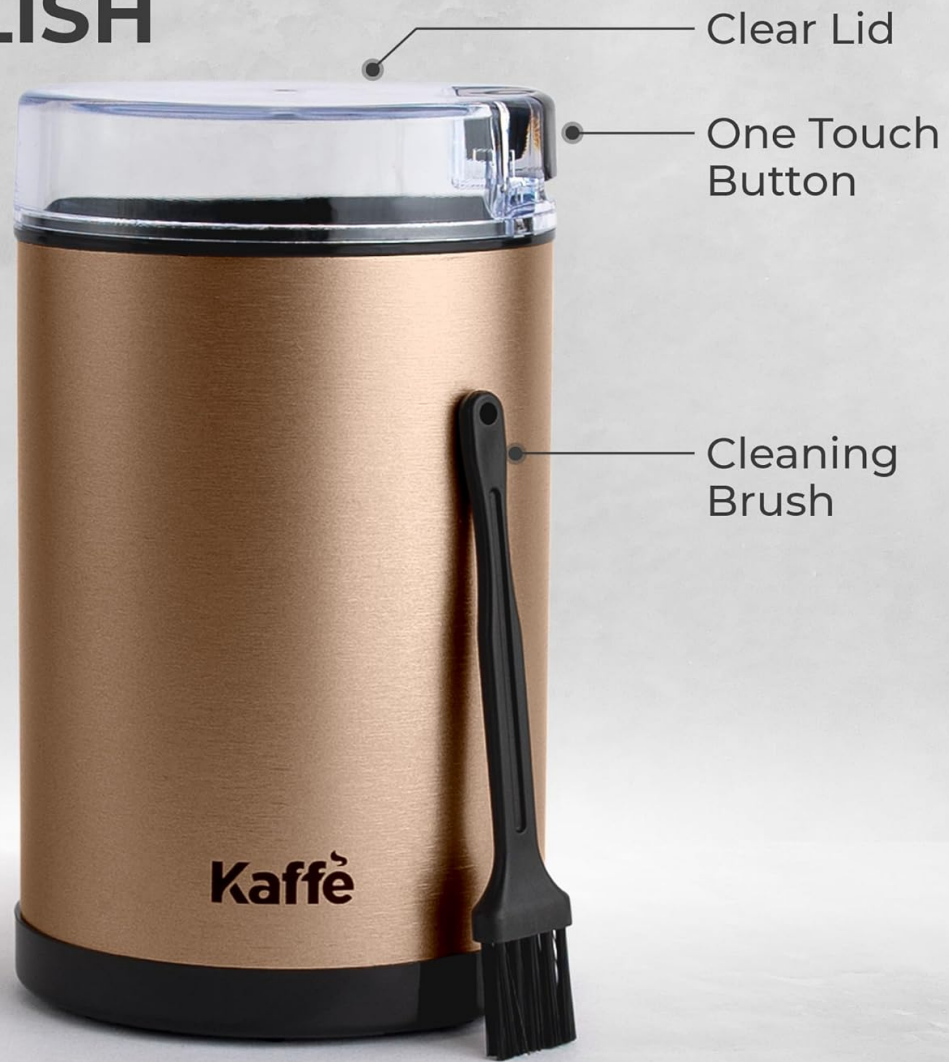
Image 3.2: Side view of the Kaffè Electric Coffee Grinder, showing its compact size (6.5 inches tall) and labeling the clear lid, one-touch button, and cleaning brush.