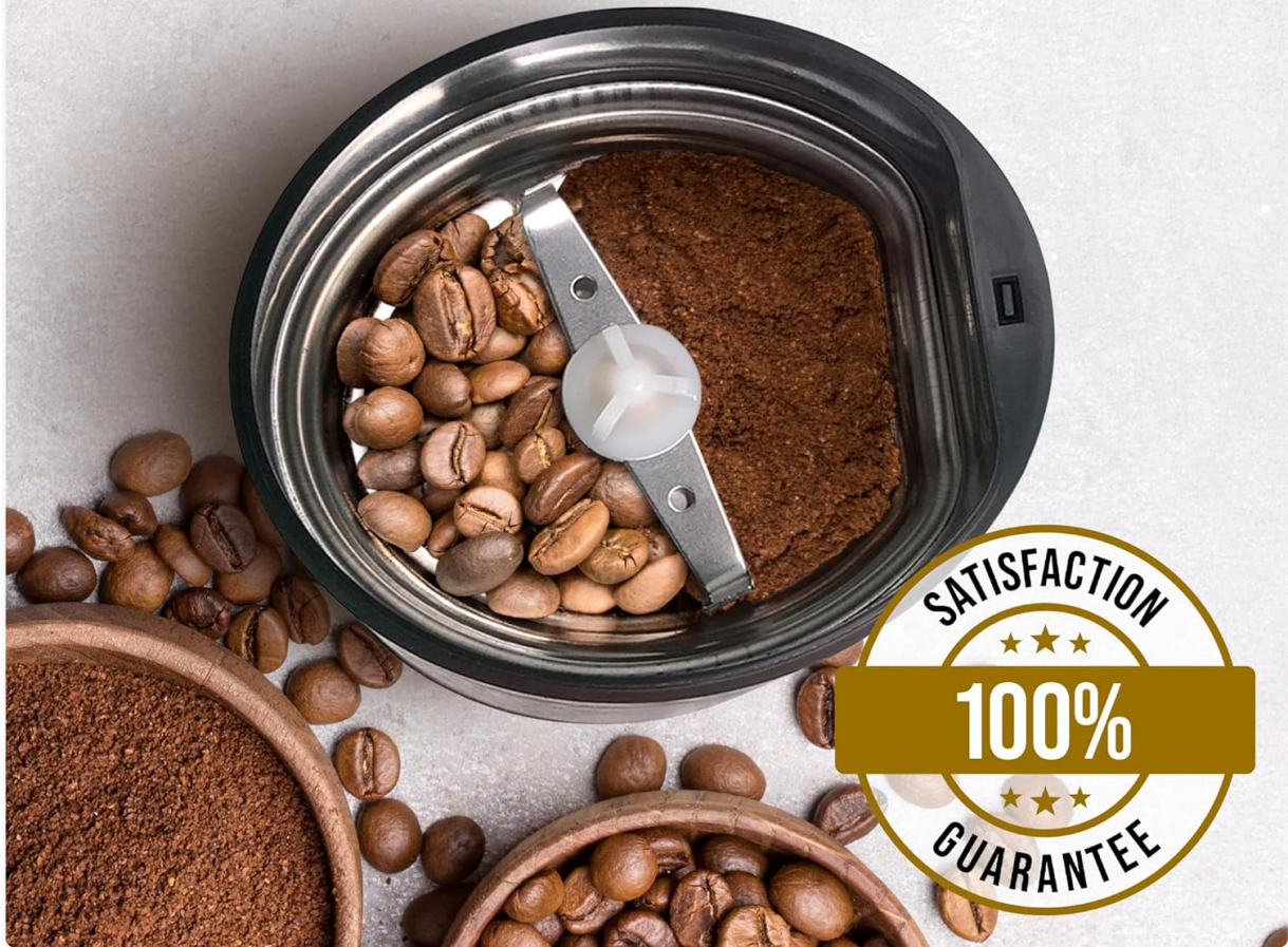
Image 3.3: Close-up view of the grinder's interior, highlighting the durable stainless steel cutting blades and demonstrating the grinding process with whole and ground coffee beans.