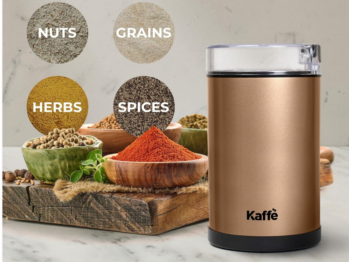
Image 5.2: The Kaffè grinder is suitable for grinding coffee beans, nuts, grains, herbs, and spices, demonstrating its versatility beyond just coffee.