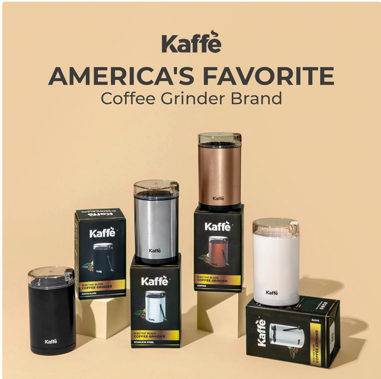
Image 7.1: The Kaffè Electric Coffee Grinder shown with its dedicated cleaning brush, designed to facilitate easy removal of coffee grounds from the grinding chamber and blades.