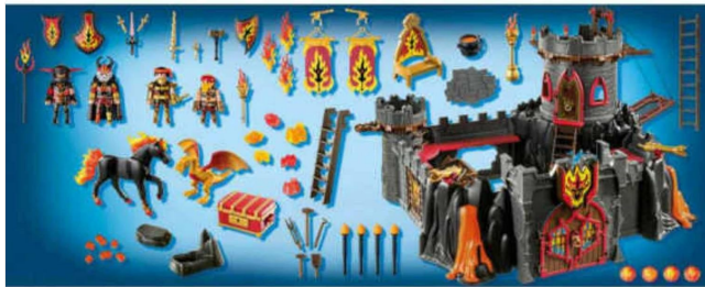
All components of the Playmobil Novelmore Burnham Raiders Fortress Playset laid out, showing figures, weapons, and accessories.