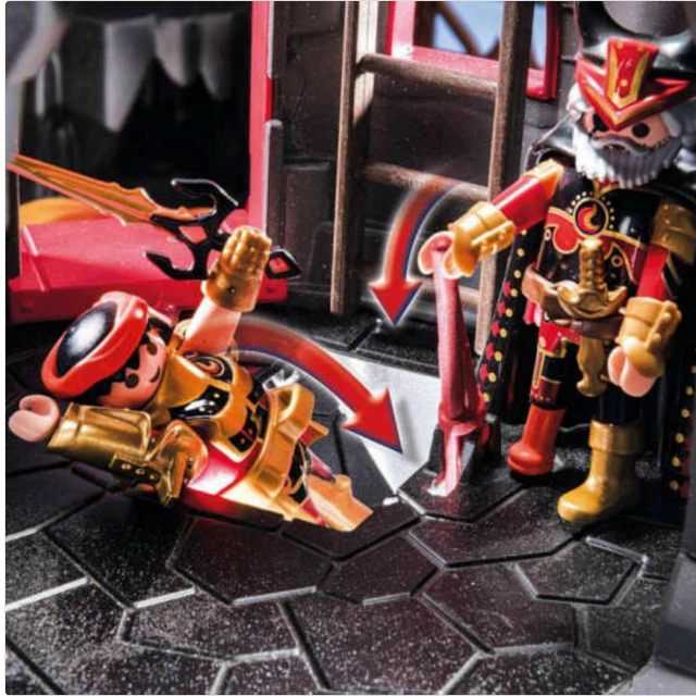
A Playmobil figure falling through a trapdoor mechanism within the fortress, illustrating an interactive play feature.