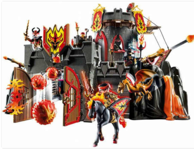
The complete Playmobil Novelmore Burnham Raiders Fortress Playset with figures, horse, and dragon, ready for action.