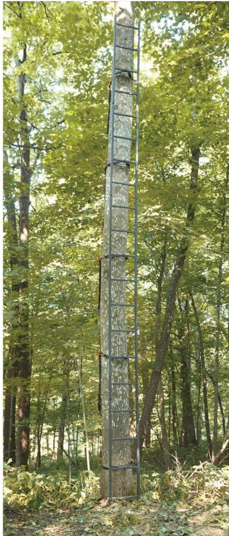
Image 3.1: The Guide Gear 20' Wide Maxi Tree Stand Ladder fully assembled and securely attached to a tree, ready for use.