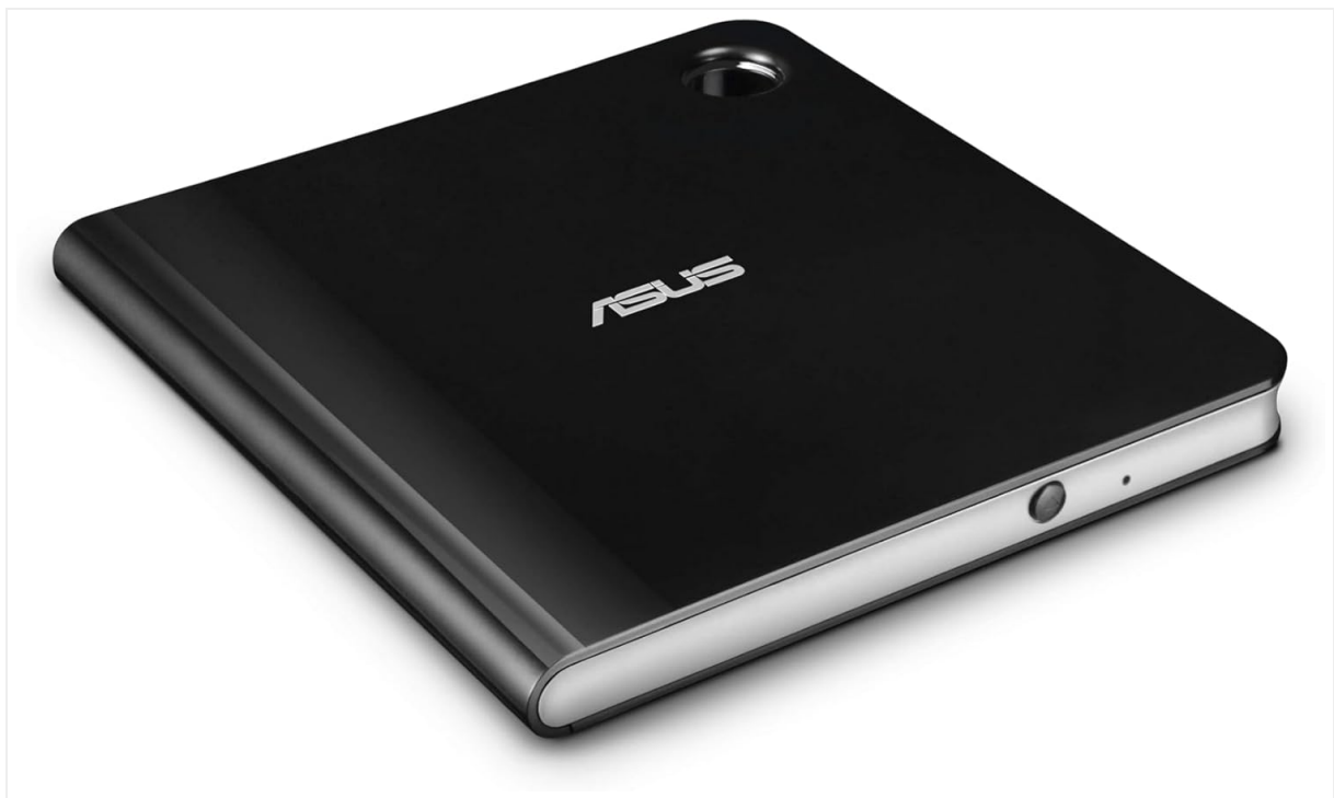
Figure 2: Side view of the ASUS SBW-06D5H-U, highlighting the USB connectivity options for easy setup.