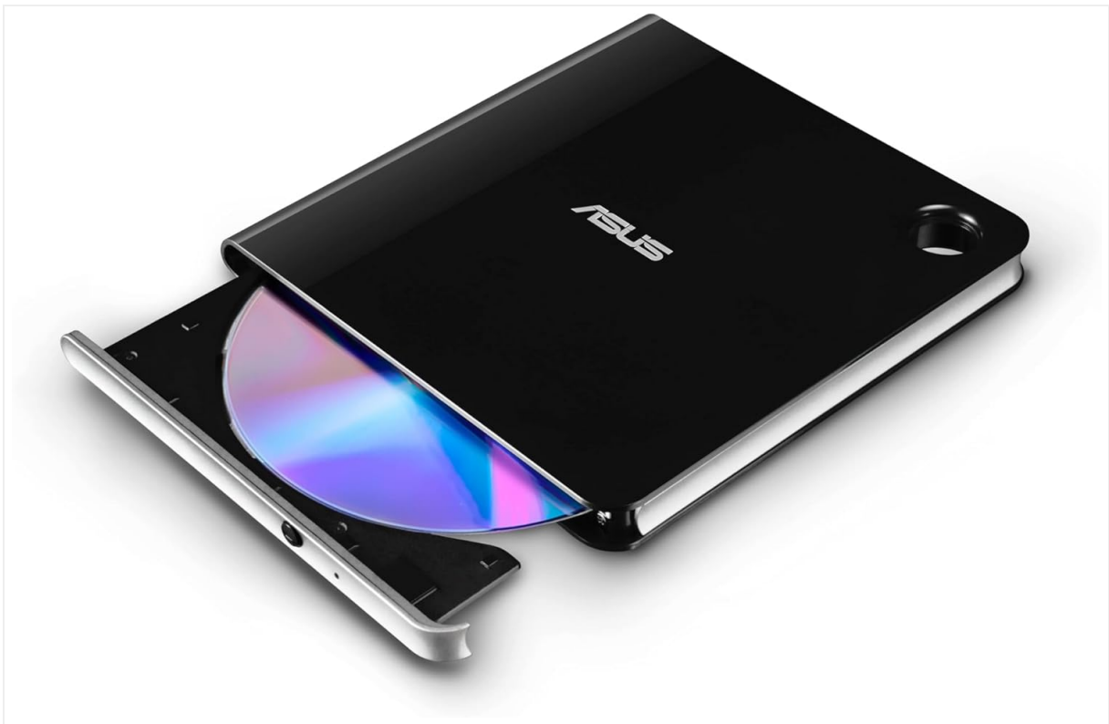
Figure 1: ASUS SBW-06D5H-U External Blu-ray Burner with disc tray open, showing the sleek black design.