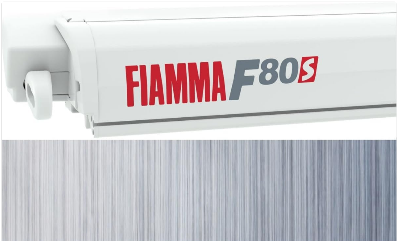
Figure 1: Fiamma F80S Roof Awning - Main Product View.

Please read this manual thoroughly before attempting any installation or operation to ensure safety and optimal performance of your awning.