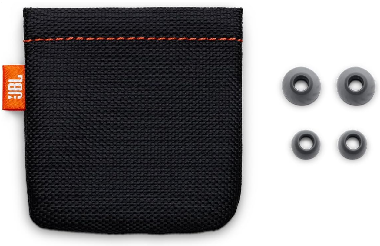
Image 2.1: The included carrying pouch and various sizes of ear tips for a customized fit.