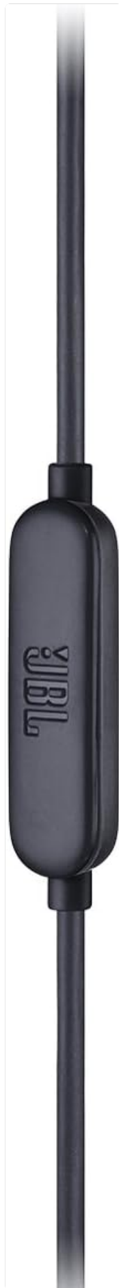
Image 4.1: Detail of the inline remote control, which includes a microphone for hands-free communication.

Video 4.1: An official product video demonstrating the features and usage of the JBL LIVE 100 In-Ear Headphones.