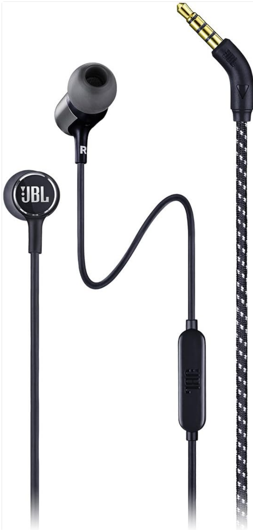
Image 1.1: Full view of the JBL LIVE 100 In-Ear Headphones, showcasing the earbuds, inline remote, and 3.5mm audio jack.