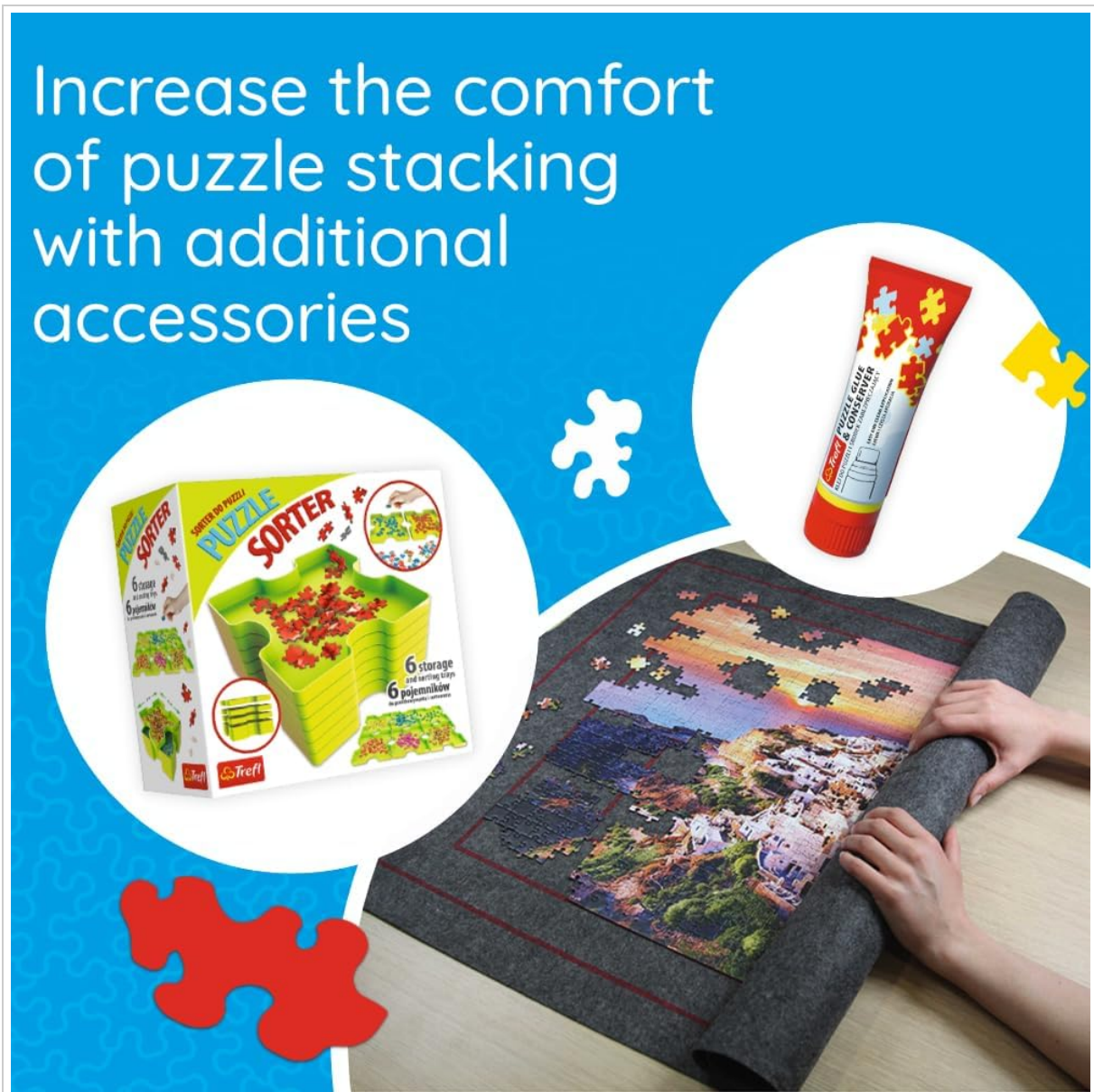
Image: Various puzzle accessories, including a roll-up mat, sorting trays, and puzzle glue, designed to enhance the puzzling experience and aid in storage.