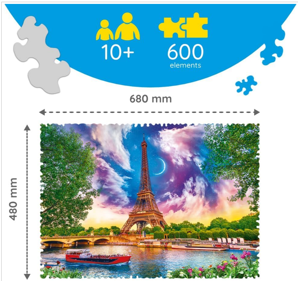
Image: A visual representation of the completed puzzle's dimensions, which are 680 mm by 480 mm.