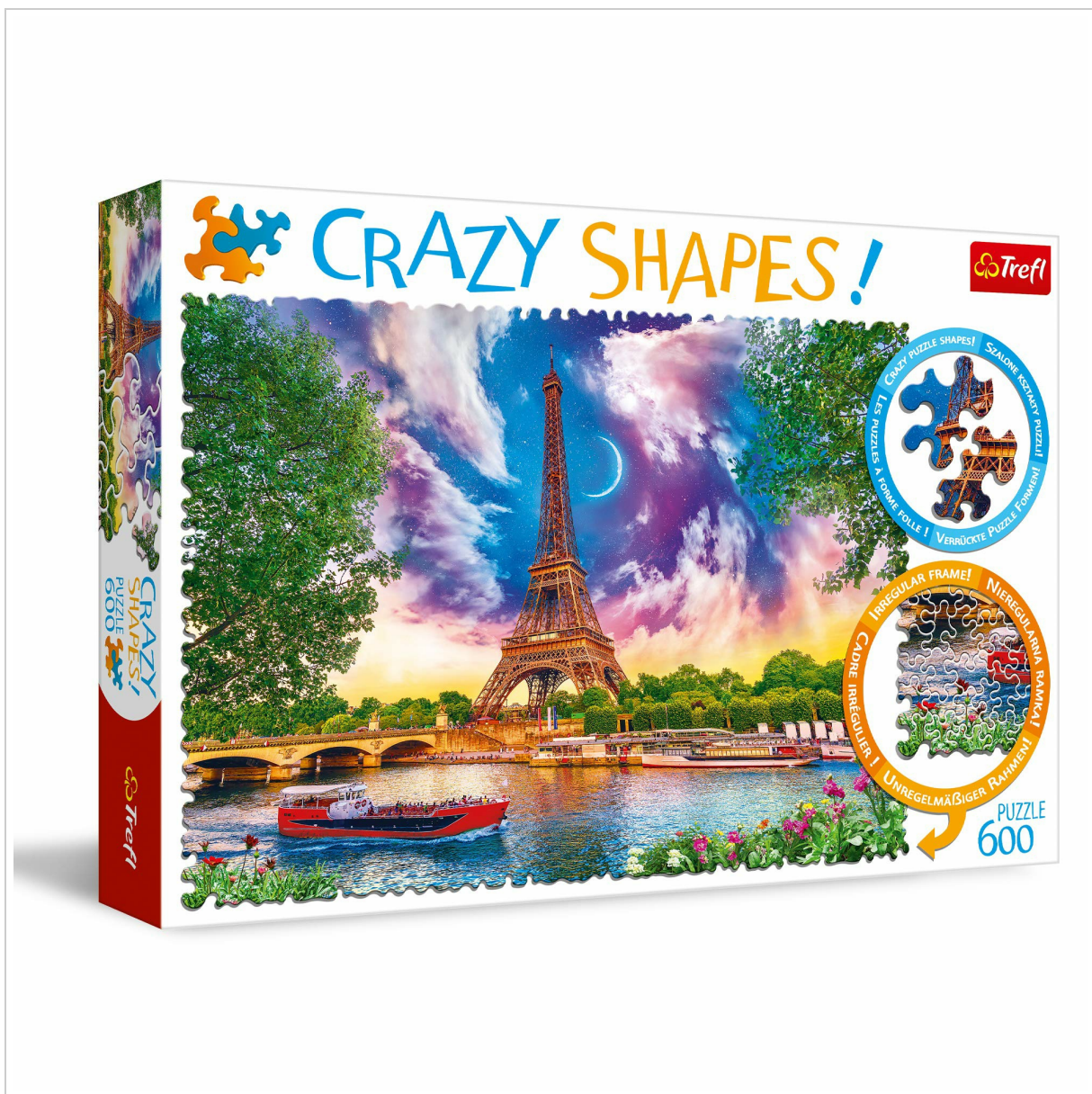
Image: The completed Trefl Sky Over Paris puzzle, showcasing the vibrant artwork and irregular edges.