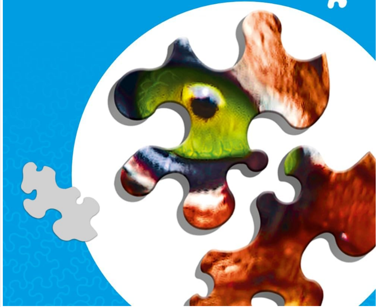
Image: A close-up view of several puzzle pieces, demonstrating their unusual and varied shapes.