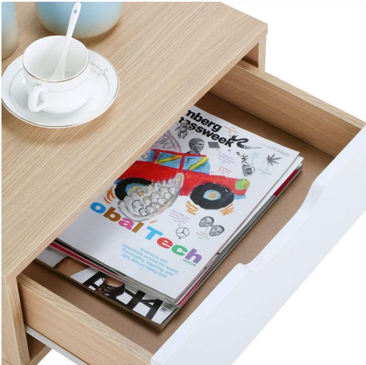
Image: The spacious drawer provides ample storage for various items like magazines.