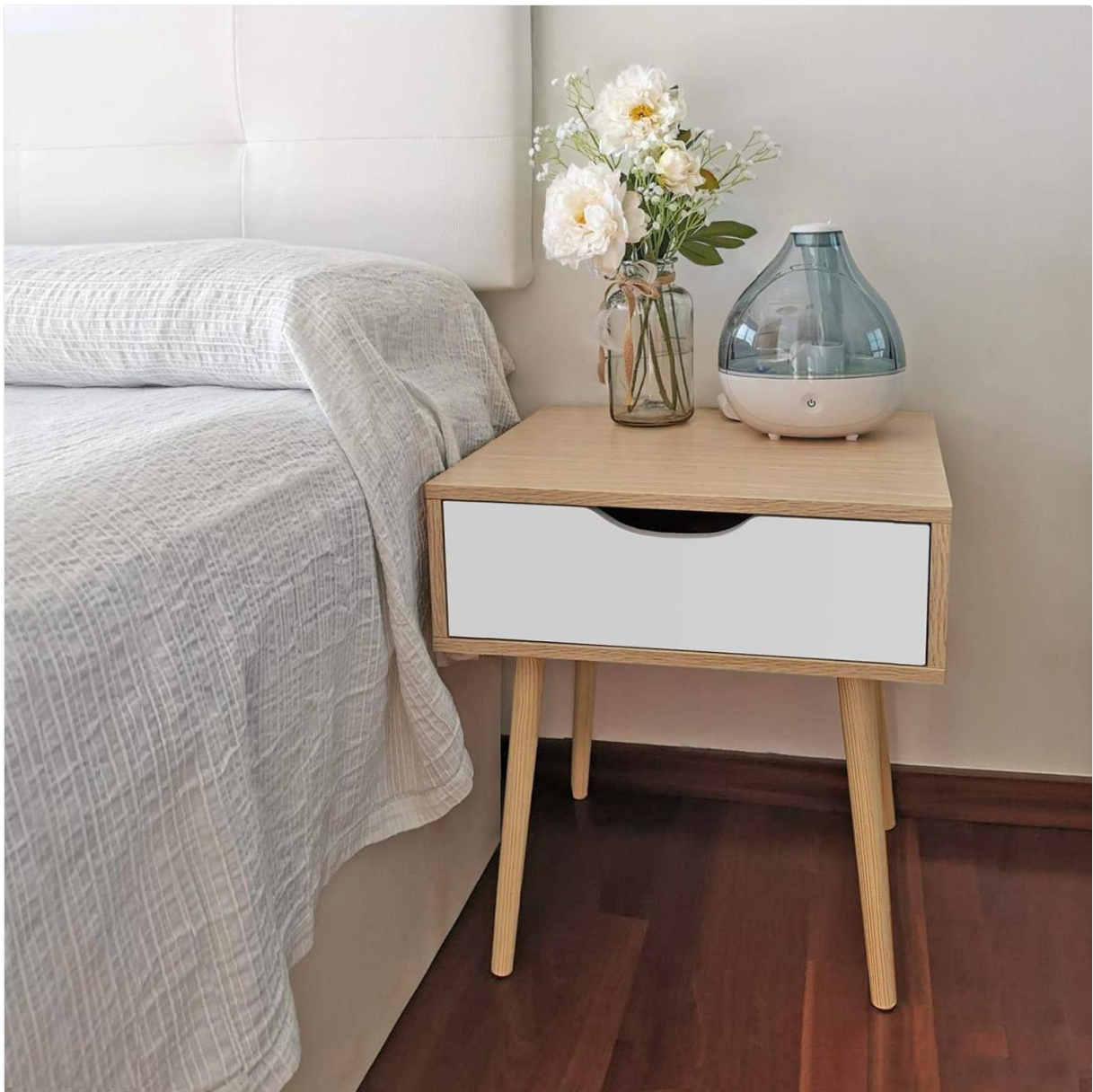
Image: The Yaheetech bedside table, featuring a light wood top and white drawer, positioned next to a bed.