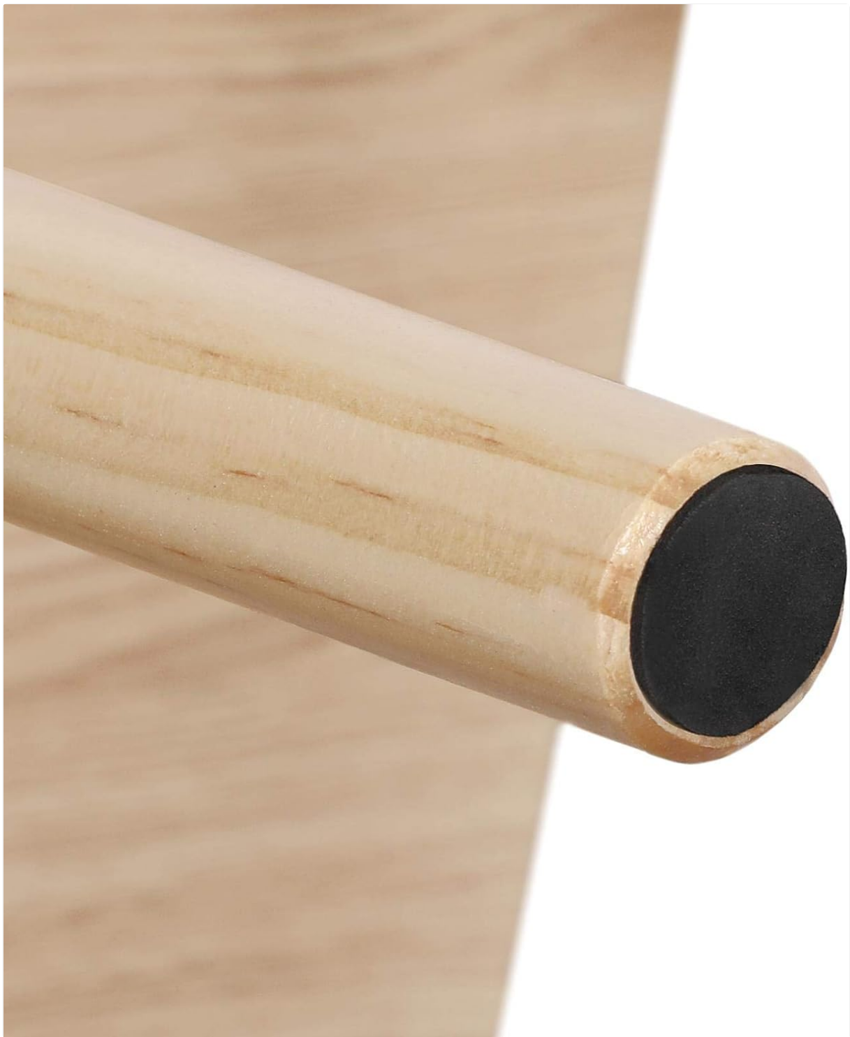
Image: The non-slip pad at the base of the leg provides stability and floor protection.