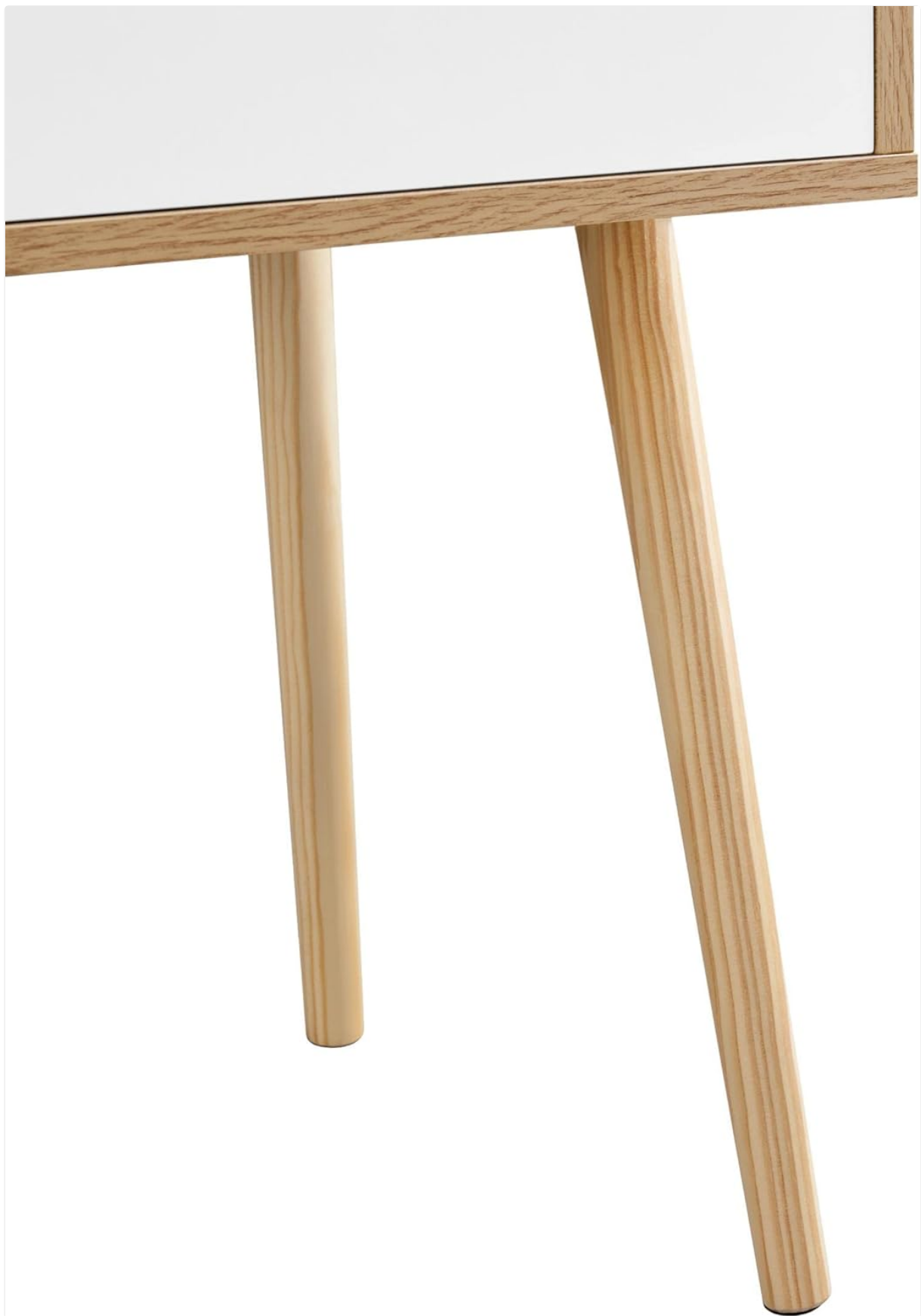
Image: Detail of the sturdy wooden leg construction.