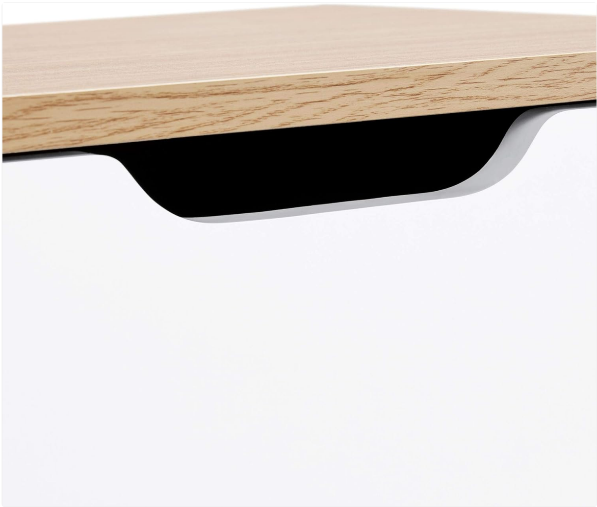
Image: The drawer features a sleek, integrated handle for easy access.