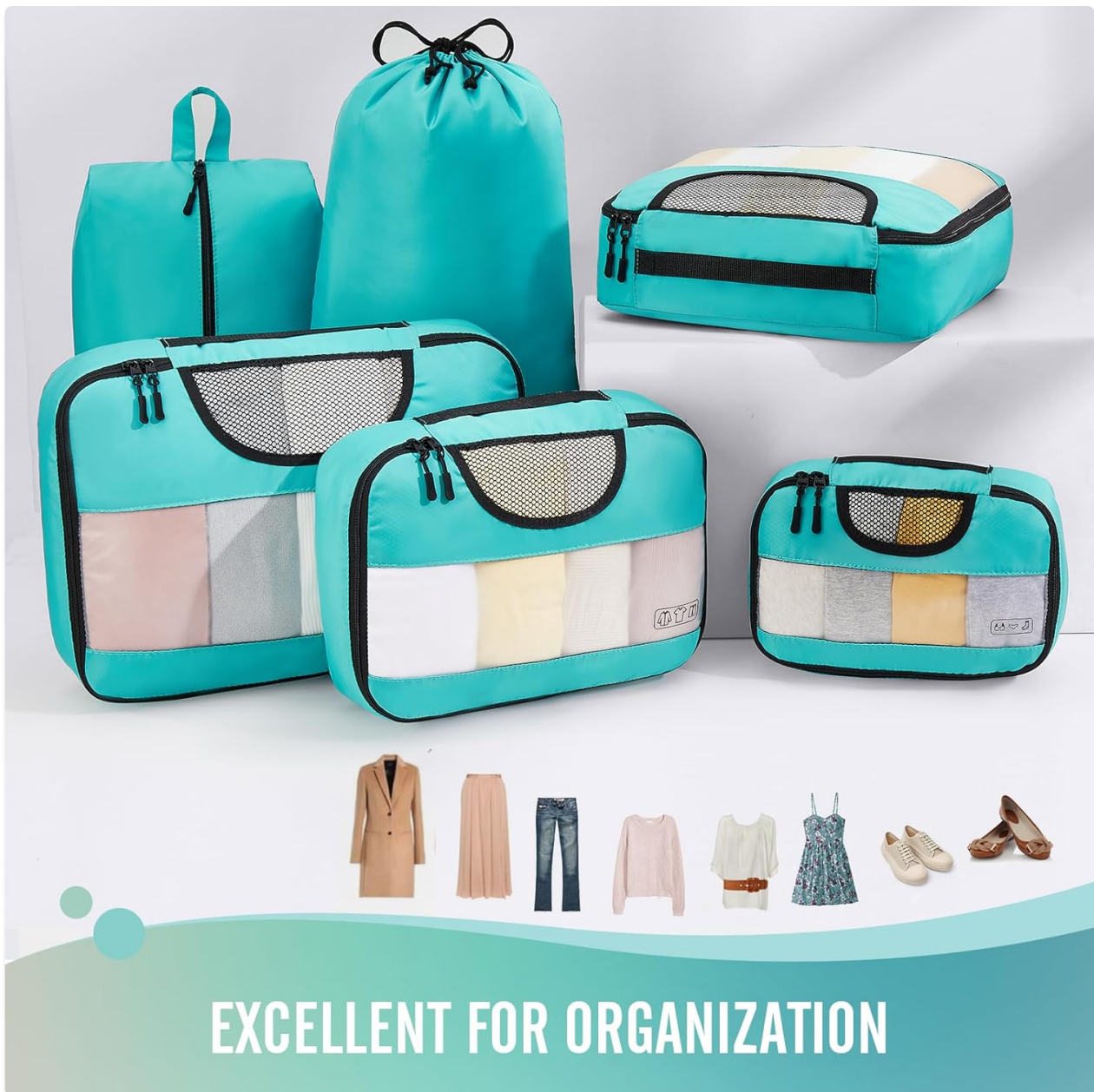
Image: The packing cubes displayed with different types of clothing, illustrating their effectiveness for organization.