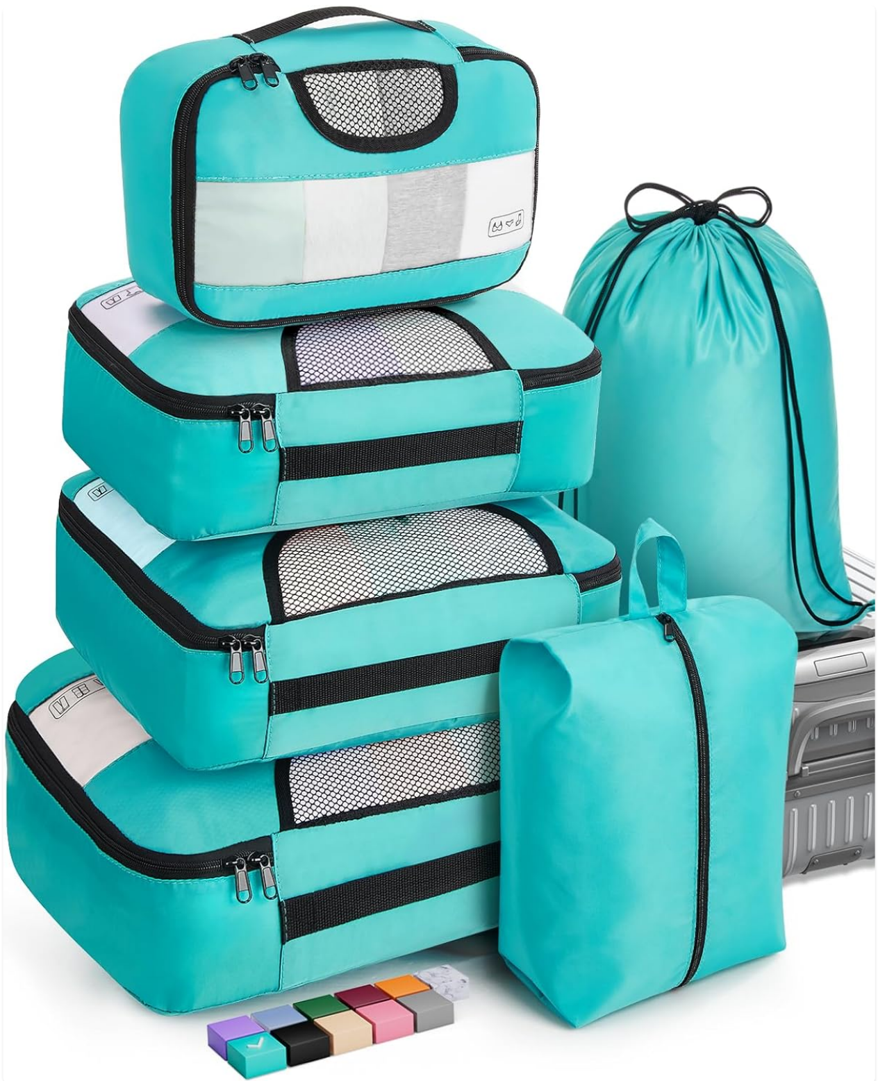
Image: The complete Veken 6-piece packing cube set in a vibrant cyan color, showcasing various sizes and the included shoe and laundry bags.