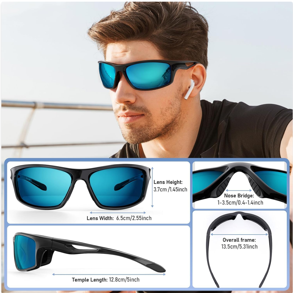
An image illustrating the key dimensions of the sunglasses, including lens height (3.7cm/1.45in), lens width (6.5cm/2.55in), temple length (12.8cm/5in), nose bridge (1-3.5cm/0.4-1.4in), and overall frame (13.5cm/5.31in), worn by a person.