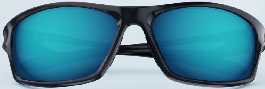
1 x Sunglasses