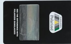
1 x Polarized Testing Card