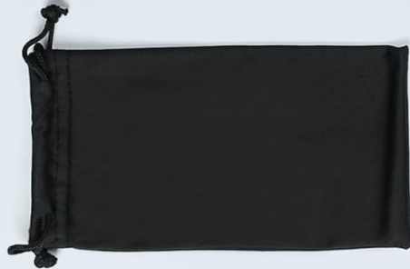
1 x Microfiber Cloth

An image displaying all items included in the package: one pair of sunglasses, one microfiber cloth, one polarized testing card, one hard protection case, and one microfiber cloth bag.