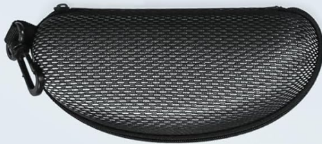
1 x Hard Protection Case