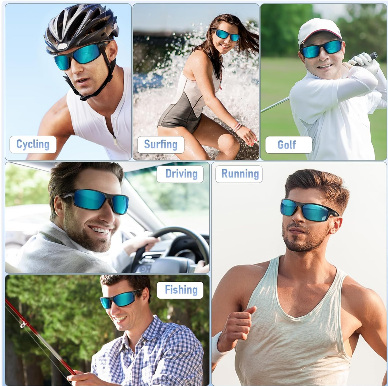
A grid of images showing individuals wearing the CHEREEKI sunglasses during different activities: cycling, surfing, golf, driving, running, and fishing, highlighting their versatility.