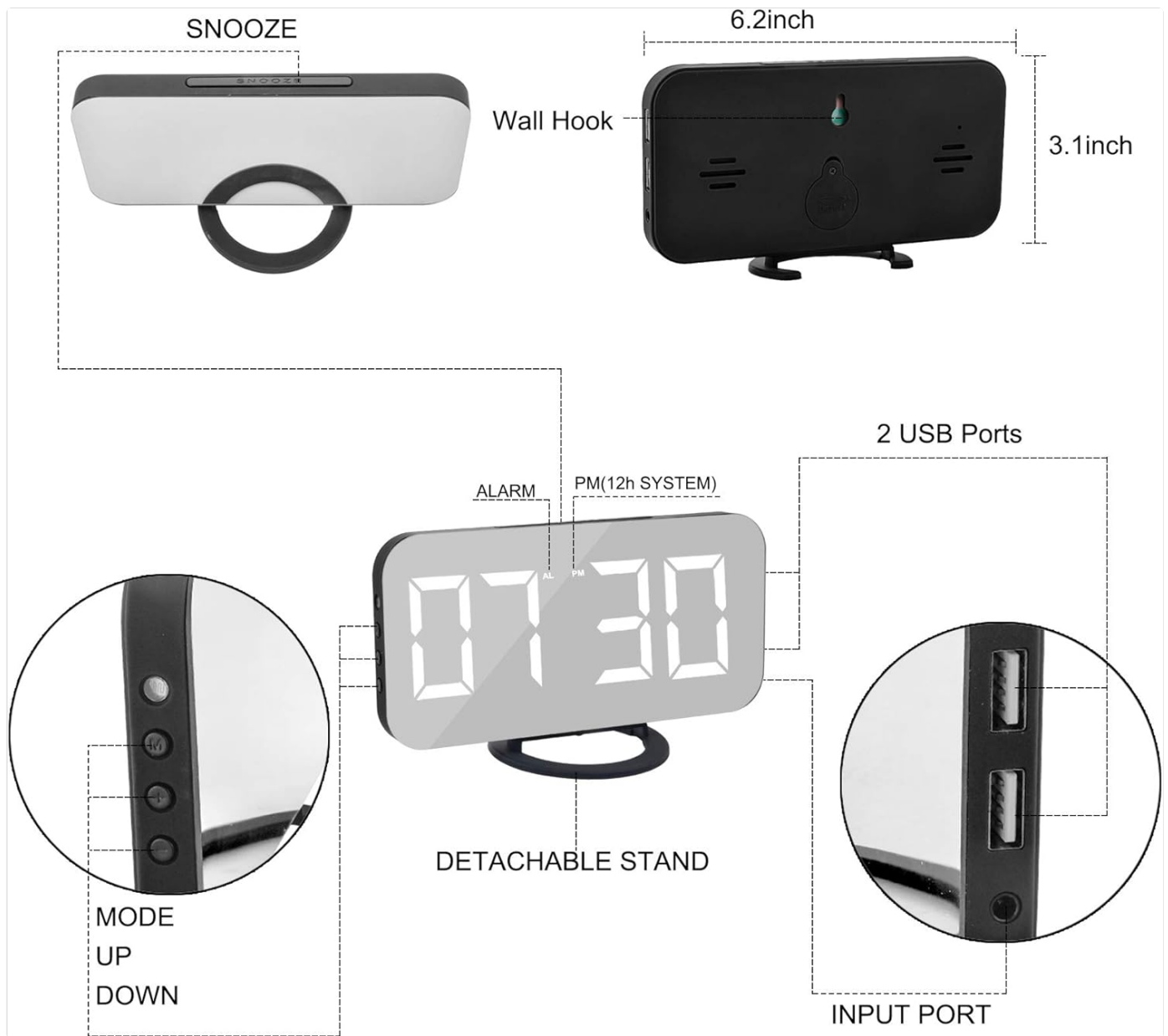
Figure 1: Product Diagram with Key Features and Dimensions (6.2 inches wide x 3.1 inches high)