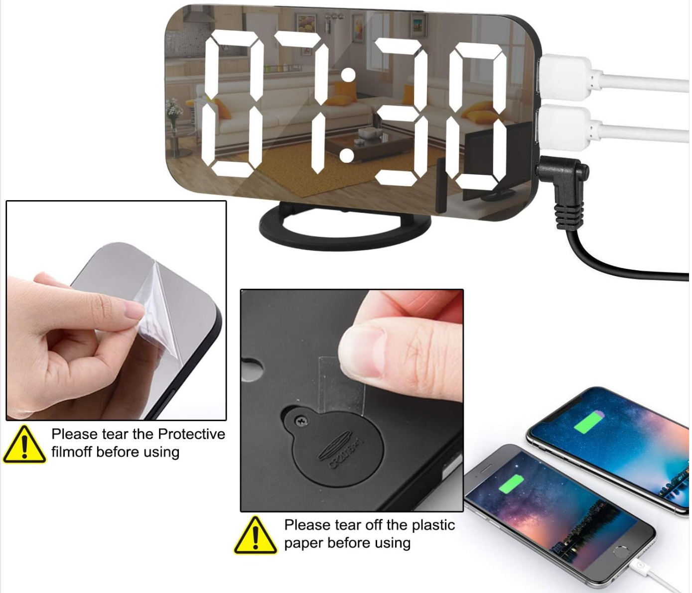
Figure 2: Removing Protective Film and Battery Installation