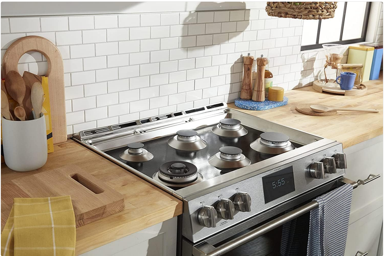
Figure 4: The StoveGuard protector in place during normal stove operation.