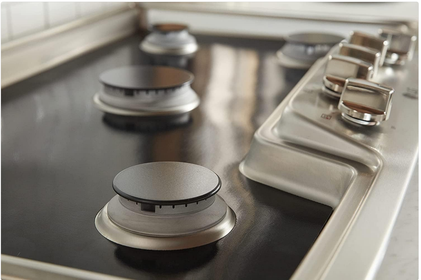
Figure 5: Detailed view of the protector's fit around a stove burner.