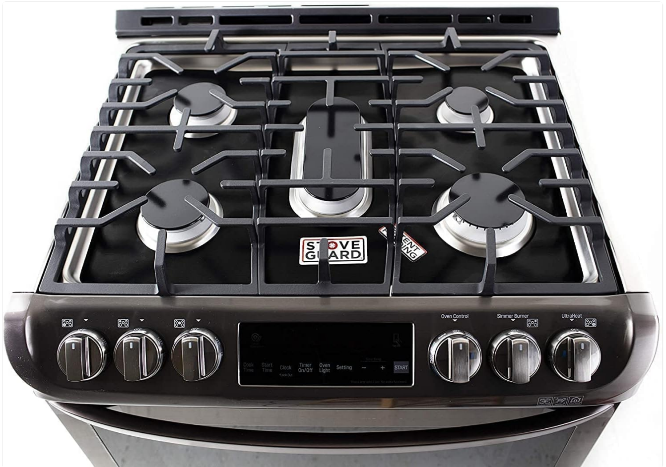
Figure 3: The StoveGuard protector seamlessly installed under the stove grates.