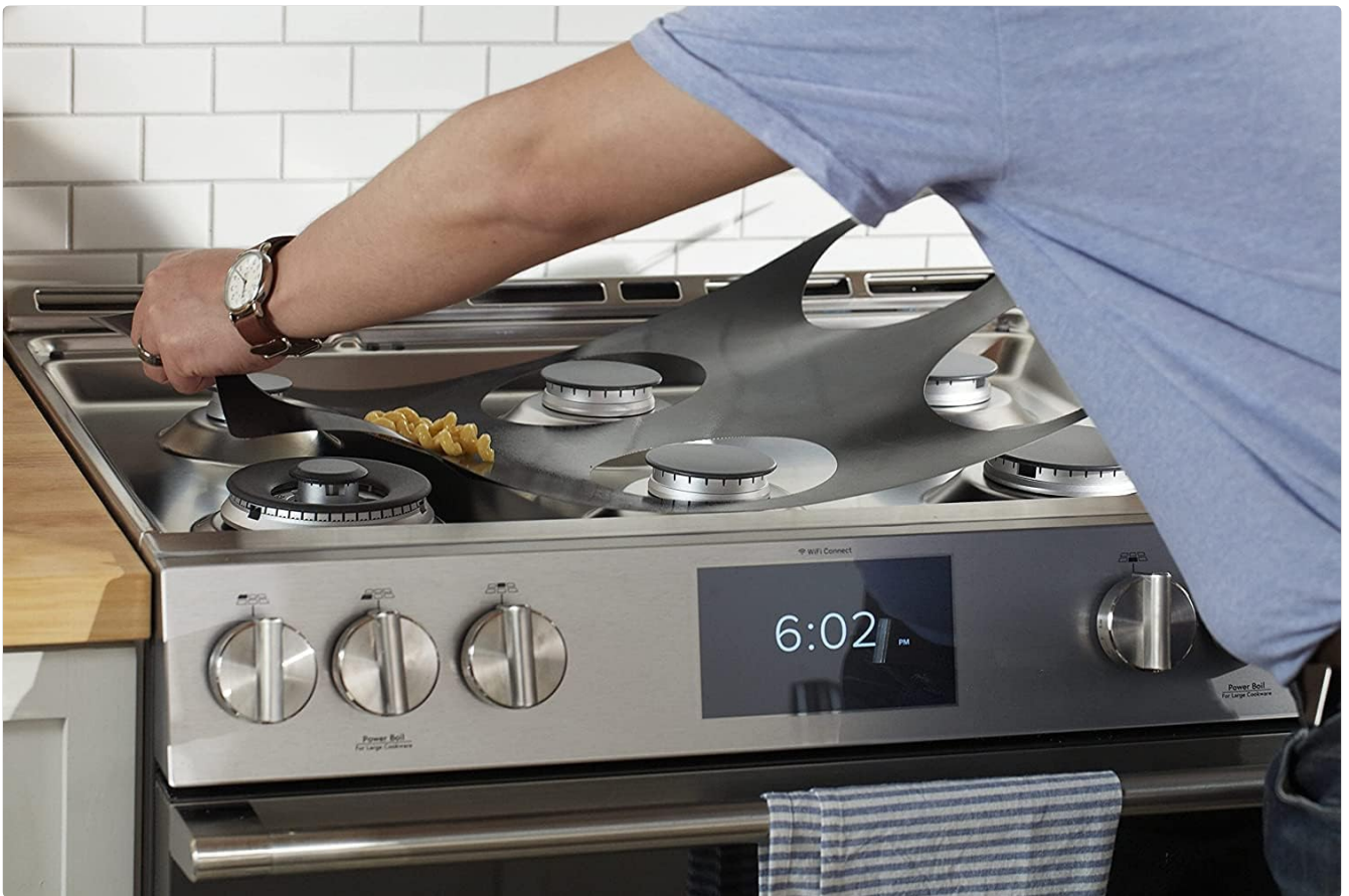
Figure 7: The protector effectively contains spills, making cleanup simple.