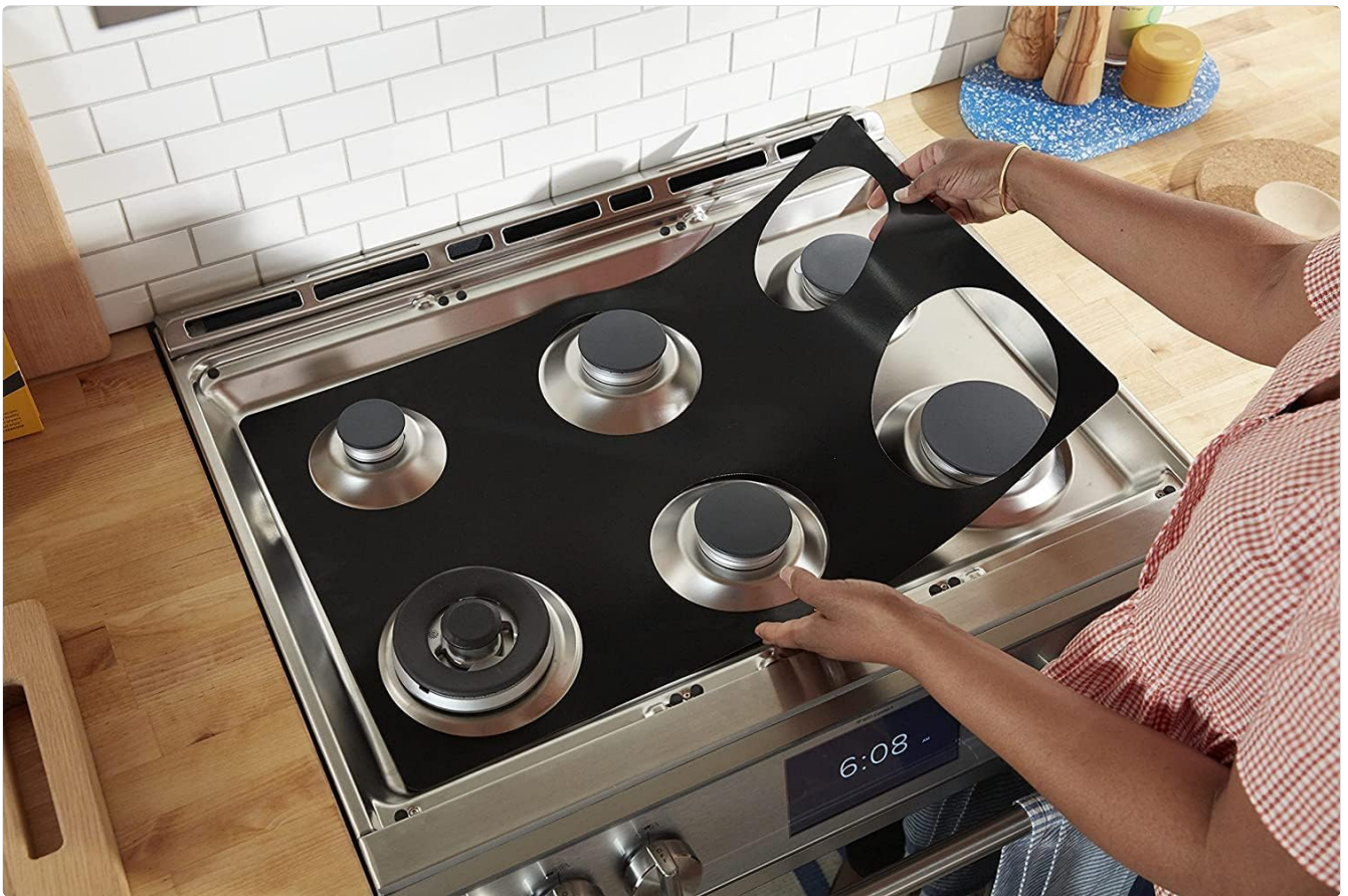
Figure 6: Removing the StoveGuard protector for cleaning.