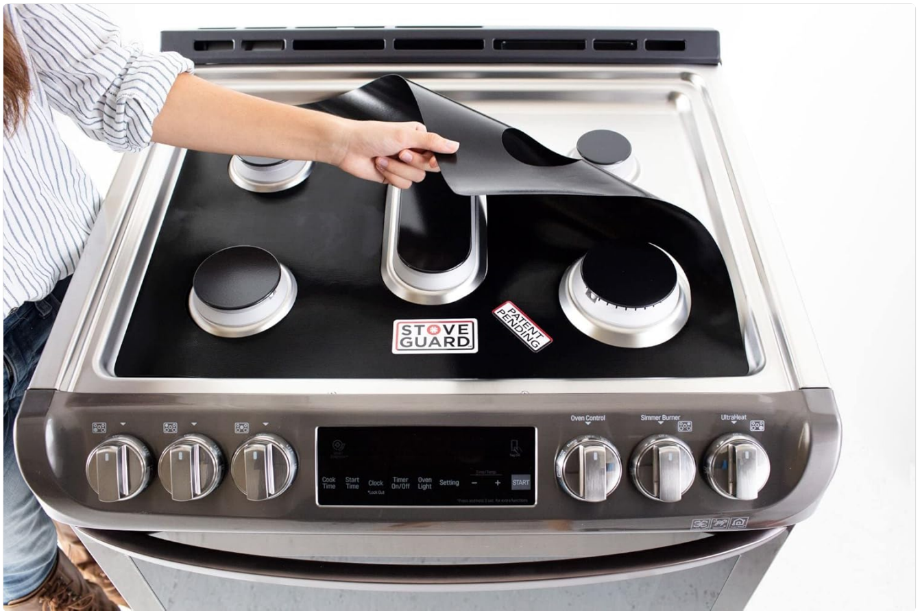
Figure 2: Proper placement of the StoveGuard protector on the stove top.