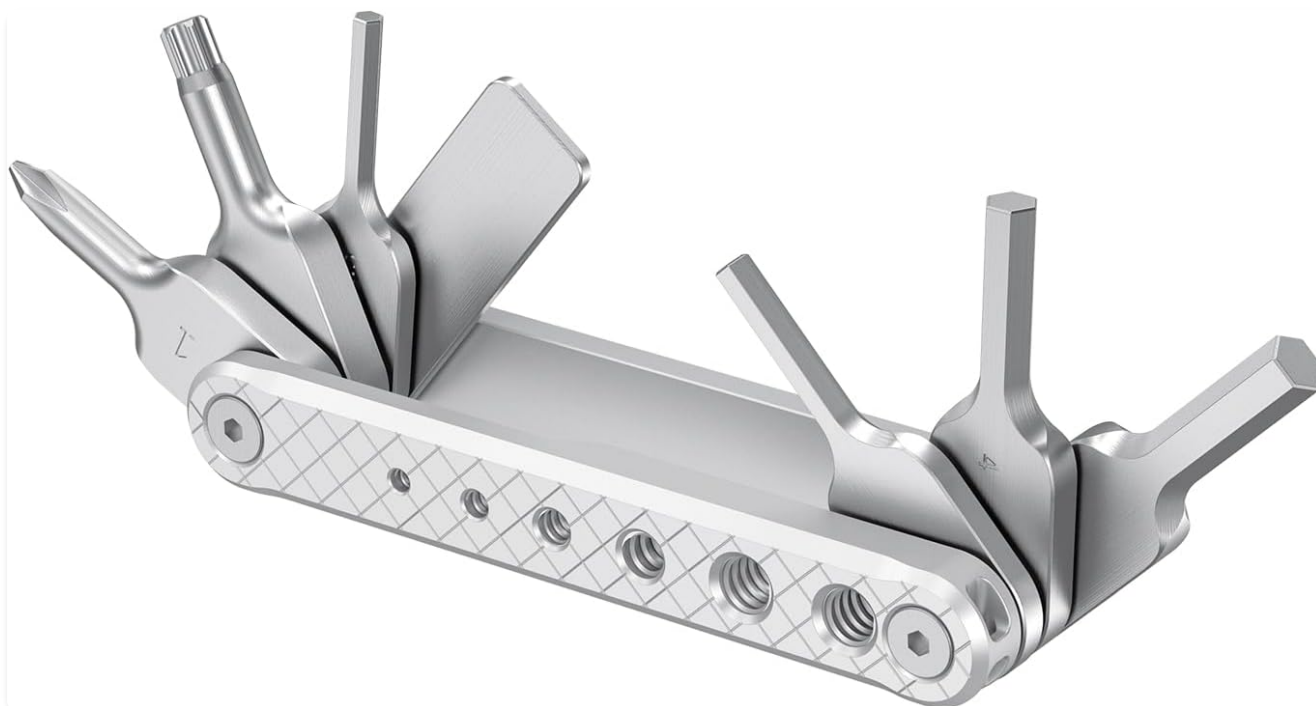
Image 1: The SMALLRIG Folding Tool Set in its compact, folded state.

Thank you for choosing the SMALLRIG Folding Tool Set. This compact and versatile multi-tool is designed to assist videographers and photographers with quick adjustments and maintenance of their camera rigs and accessories. Crafted from durable aluminum alloy and stainless steel, it provides essential tools in a portable form factor.