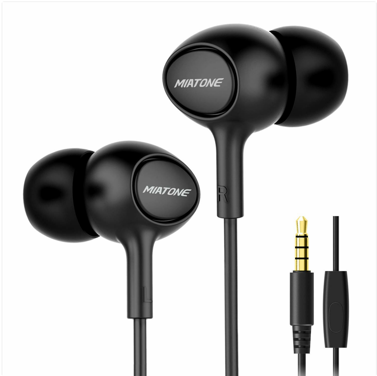
Image: MIATONE Wired In-Ear Earbuds, showing the overall design.