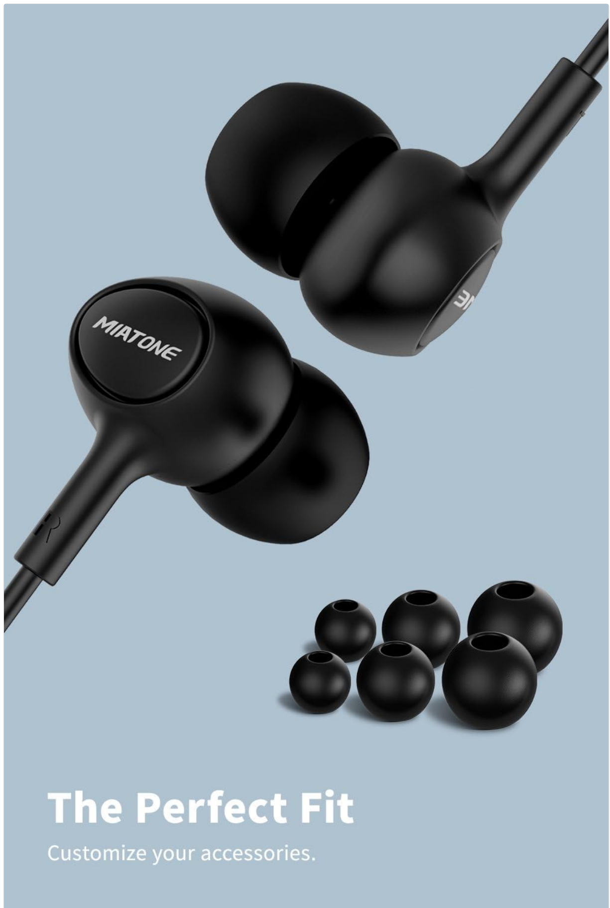
Image: MIATONE earbuds shown with various sizes of ear tips for a customized fit.