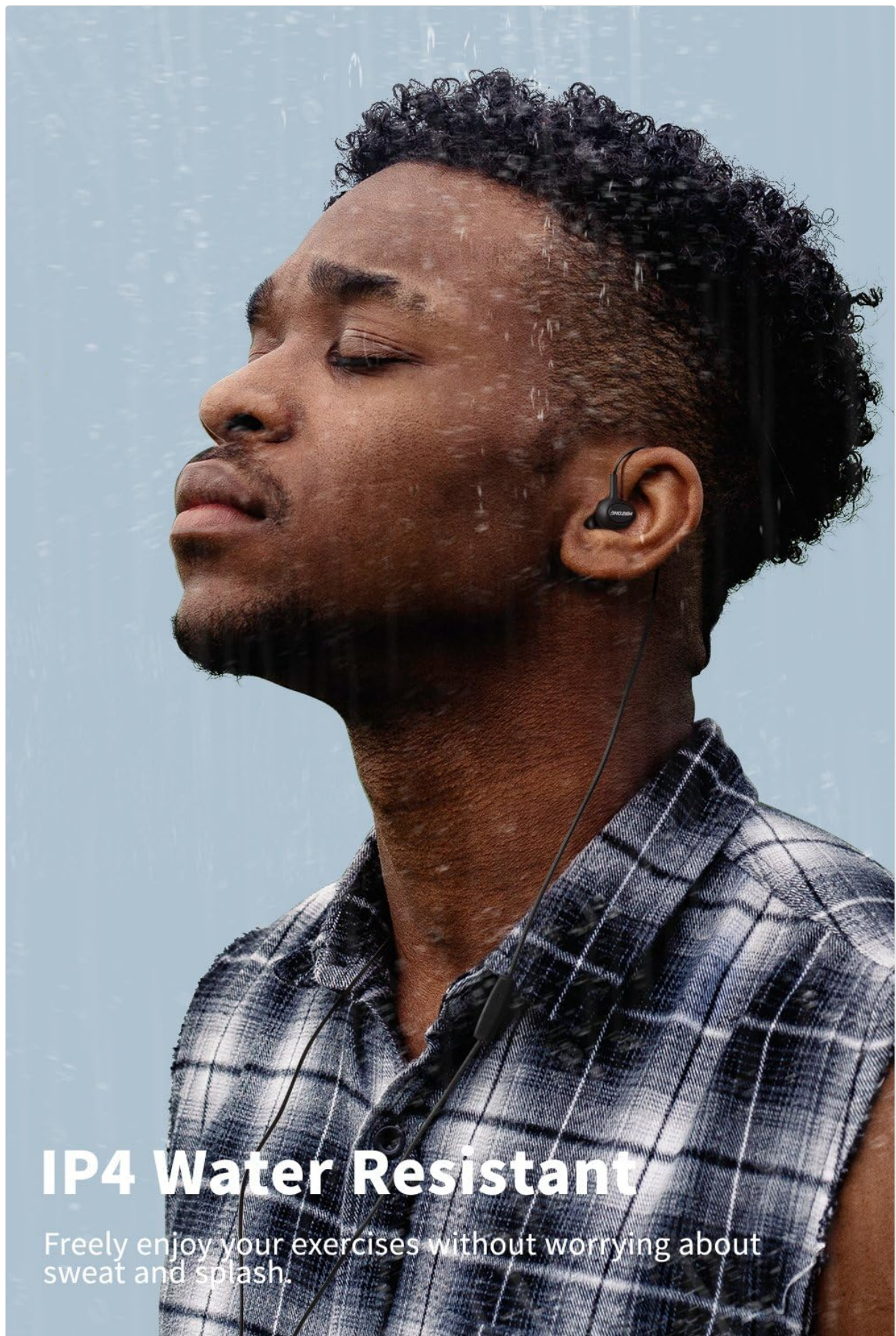
Image: A person using MIATONE earbuds in a light rain or misty environment, demonstrating IP4 water resistance.

rain or showering. Ensure the 3.5mm jack is dry before connecting to a device.