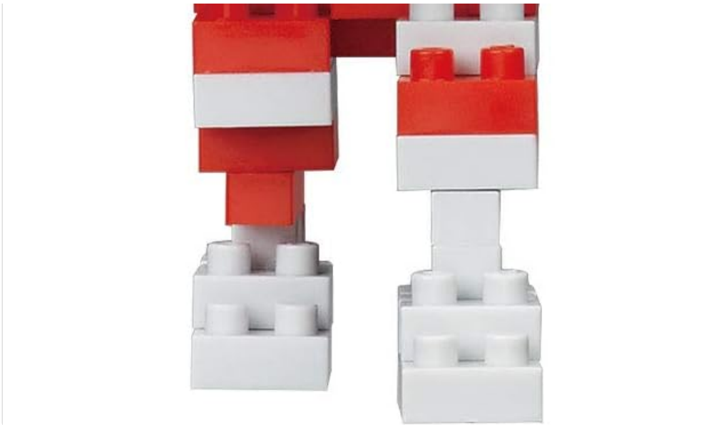
Figure 3: A detailed view of the fully assembled Nanoblock Caranano Ultraman CN-03 figure.