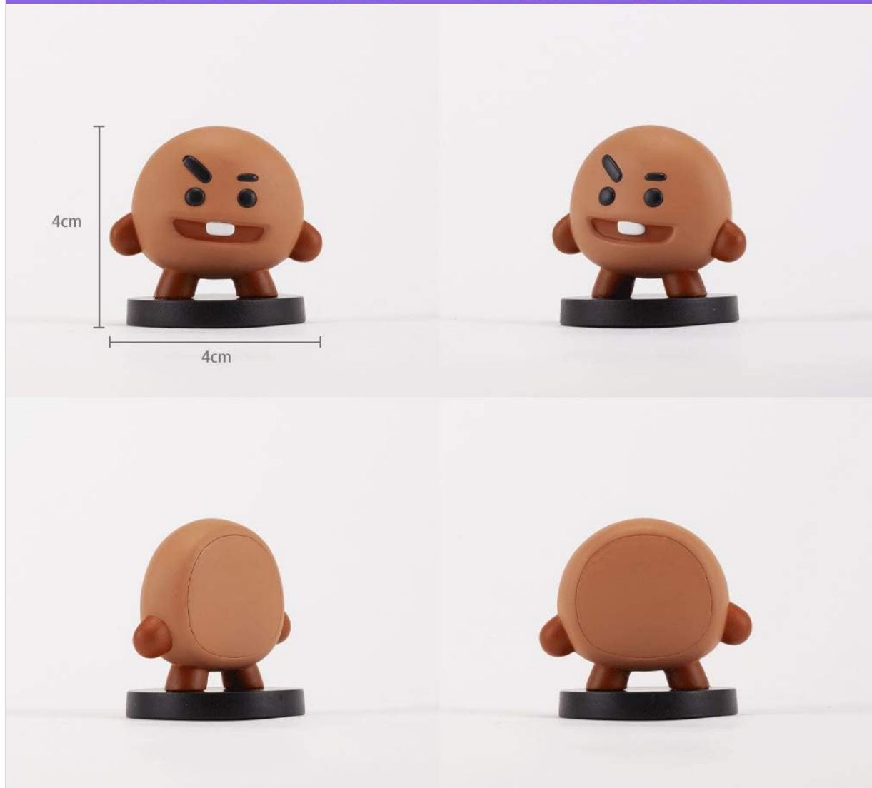
Image: Front, side, and rear views of the Shooky figure, showing dimensions (4cm height, 4cm width).