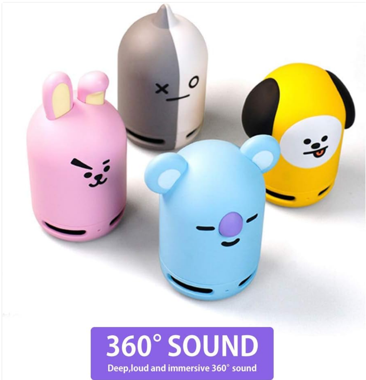
Image: Four BT21 speakers (Koya, Cooky, Chimmy, VAN) arranged to visually represent 360-degree sound output.