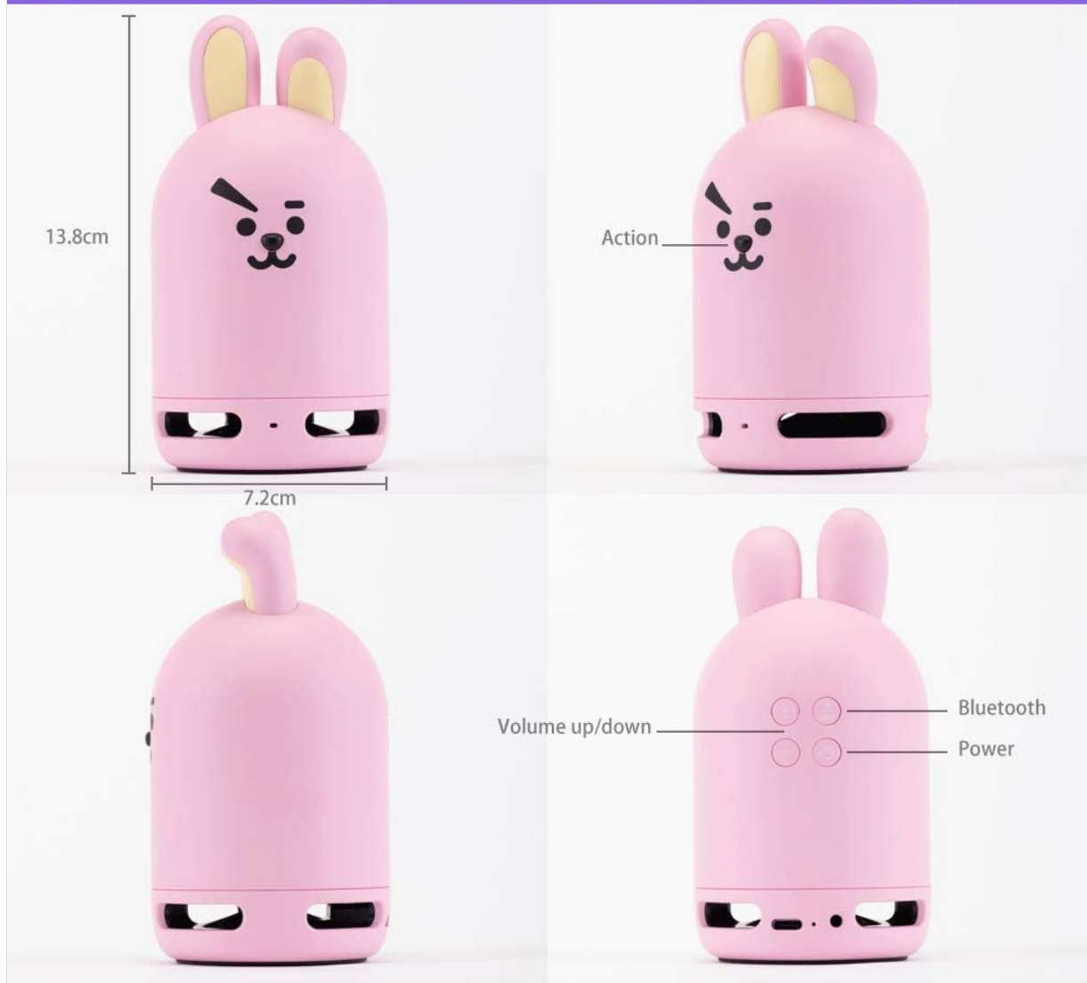
Image: Front, side, and rear views of the Cooky speaker, showing dimensions (13.8cm height, 7.2cm width) and button functions for volume, Bluetooth/Add, and power.

The set also includes a Shooky figure, designed to complement your speaker.