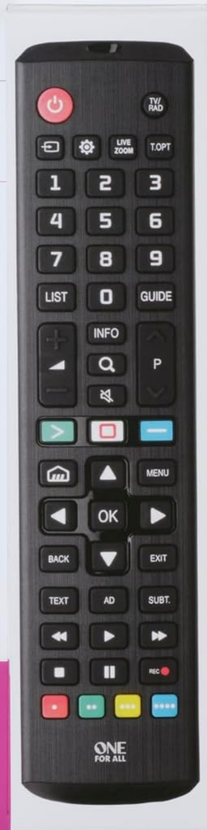
Figure 5: Front of the retail packaging for the One For All URC4811 remote control, displaying product features and