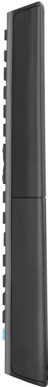
Figure 2: Side view of the One For All URC4811 remote control, highlighting its slim profile.