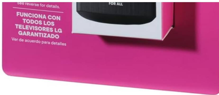
Figure 6: Back of the retail packaging for the One For All URC4811 remote control, providing additional product information and setup details.