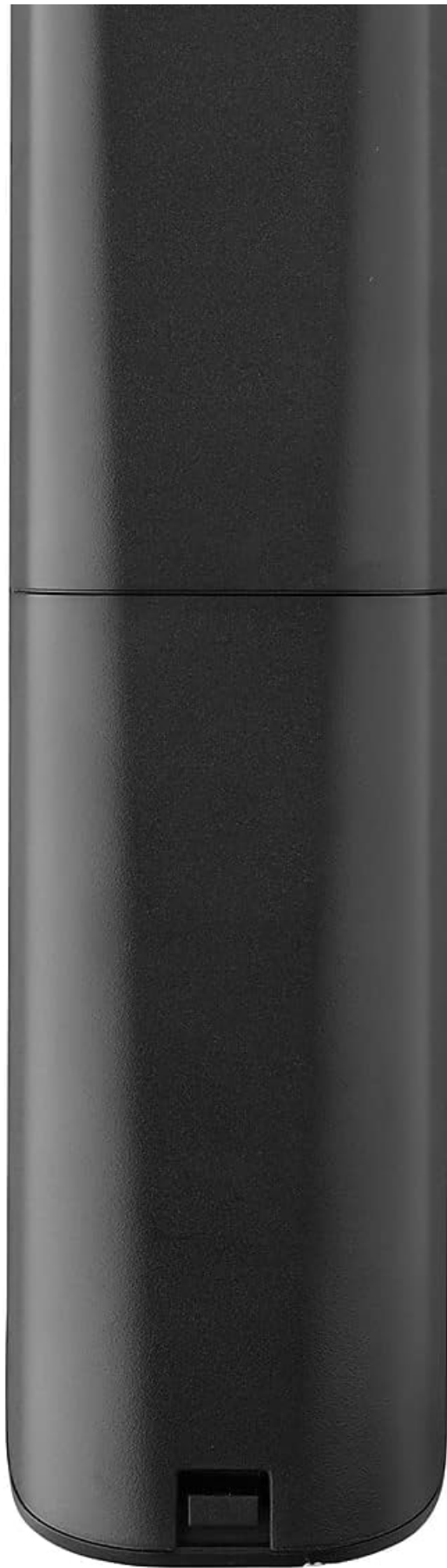
Figure 3: Back view of the One For All URC4811 remote control, showing the battery compartment cover.