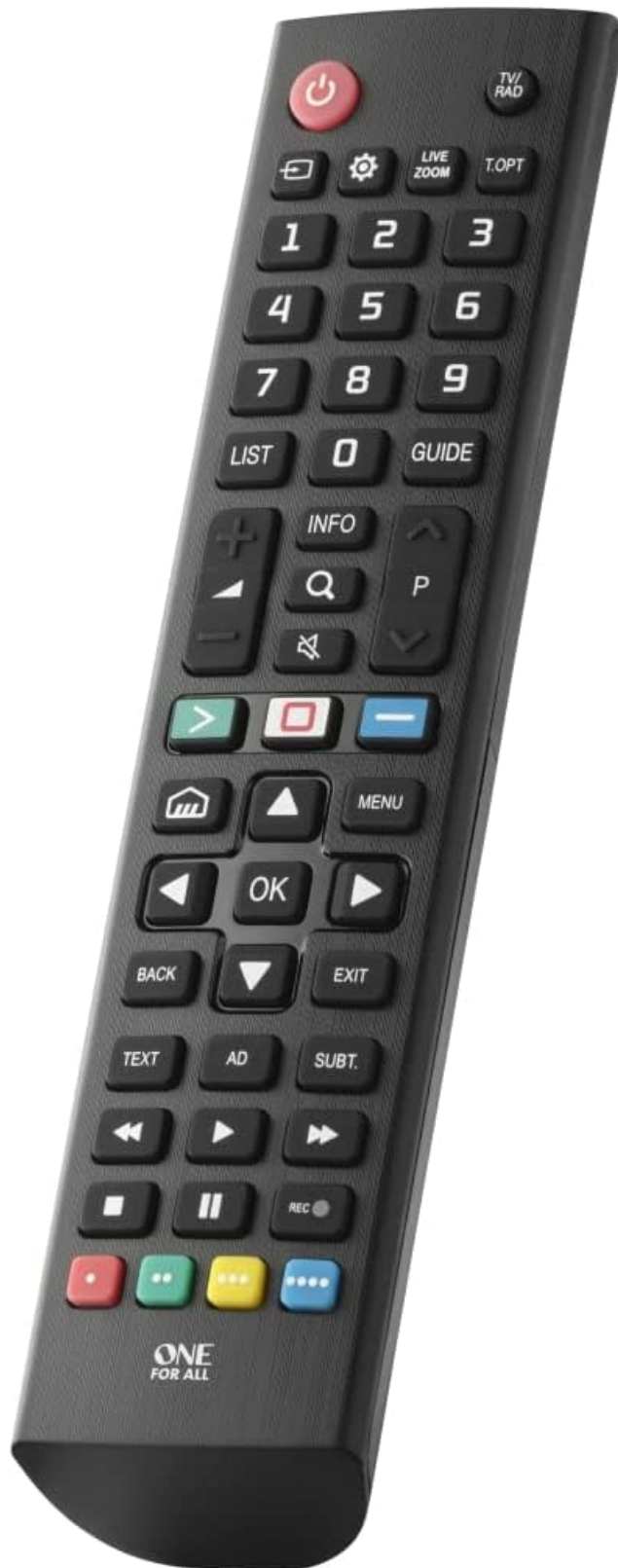
Figure 1: Front view of the One For All URC4811 remote control, showcasing its button layout and ergonomic design.