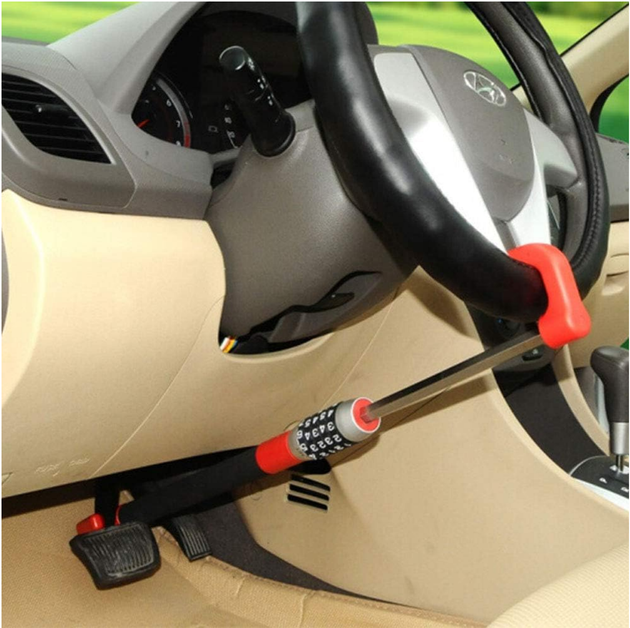
Figure 5.1: The anti-theft lock installed in a vehicle.