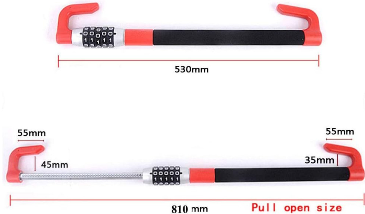
Figure 8.1: Product dimensions (closed and extended).