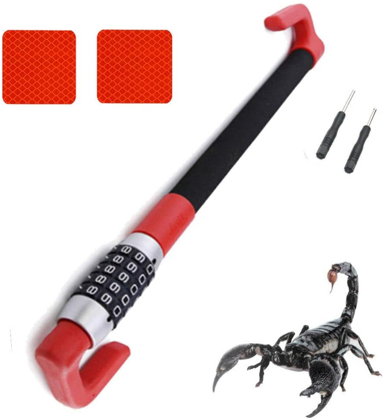
Figure 3.2: The anti-theft lock shown with the included scorpion and reflective stickers.