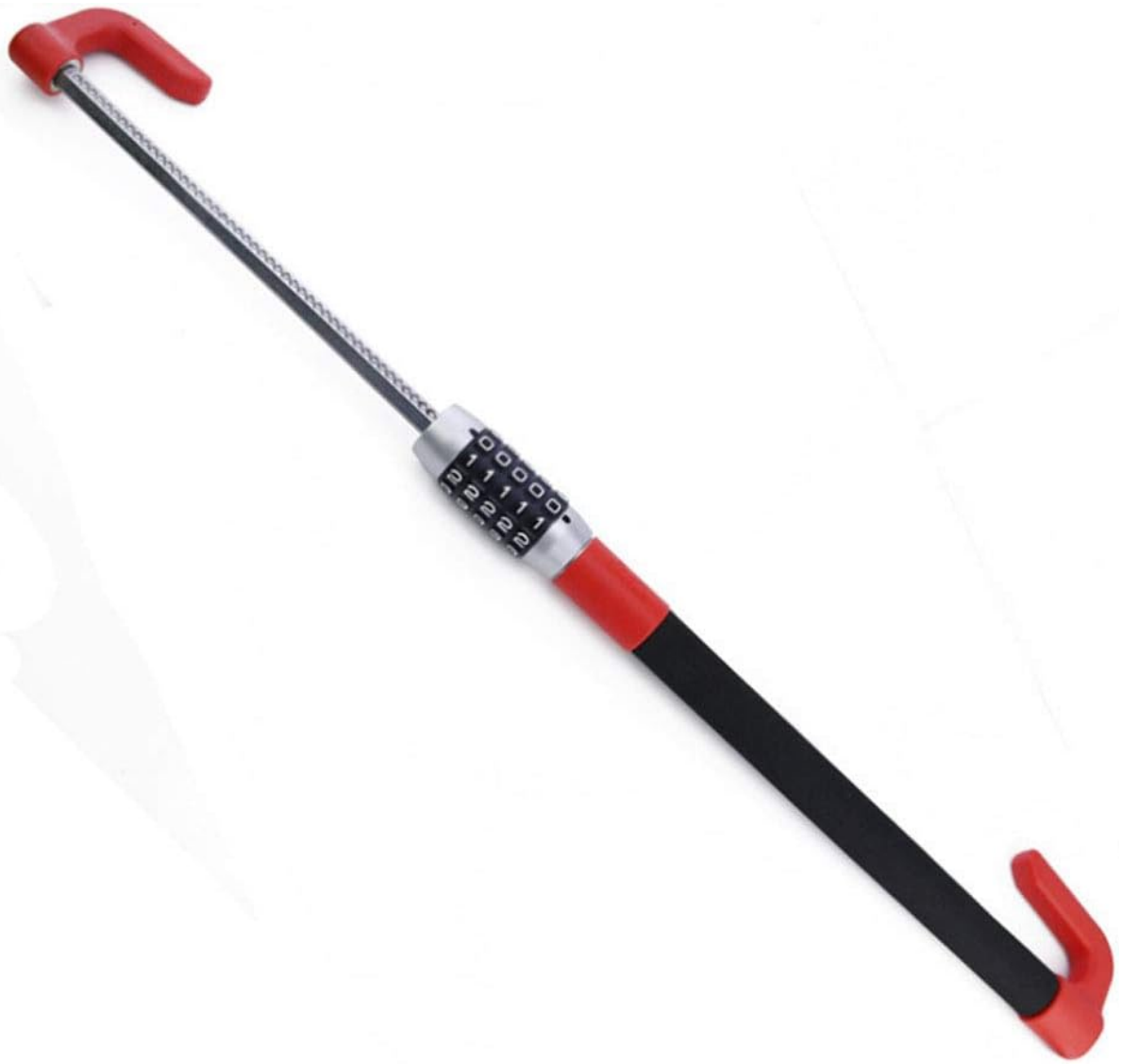
Figure 3.1: Full view of the WANLIAN Steering Wheel to Pedal Anti-Theft Lock.