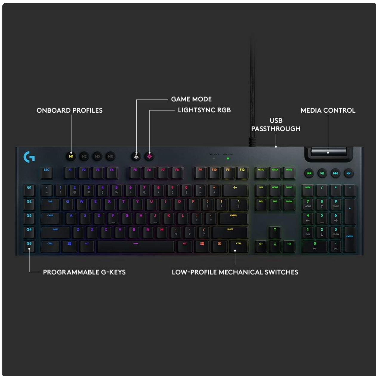
Figure 3: Key features and layout of the Logitech G815 keyboard.