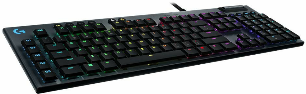
Figure 1: Logitech G815 LIGHTSYNC RGB Mechanical Gaming Keyboard.