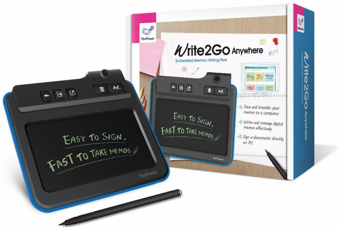
Image: The PenPower Write2Go Anywhere pad in use, showing a user writing a memo while connected to a laptop.