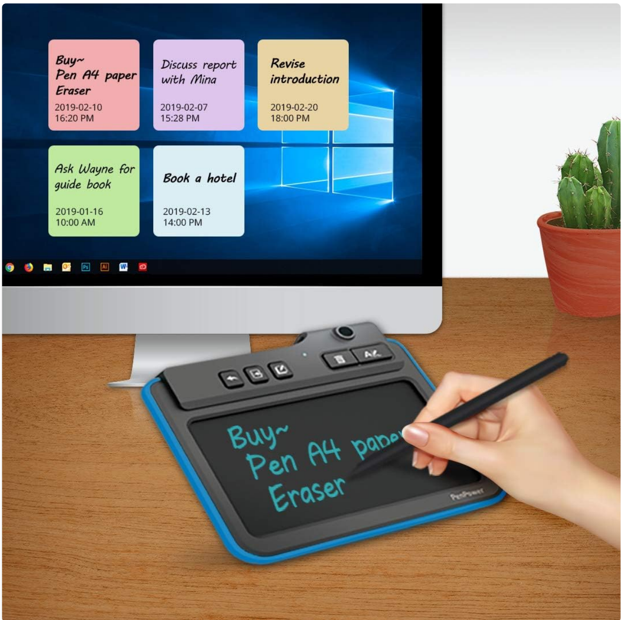
Image: Digital memos created with the Write2Go Anywhere pad are displayed as sticky notes on a computer desktop.