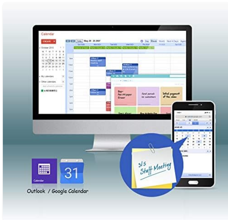
Image: The Write2Go Anywhere integrates with digital calendars, allowing memos to be scheduled and viewed on both computer and mobile devices.