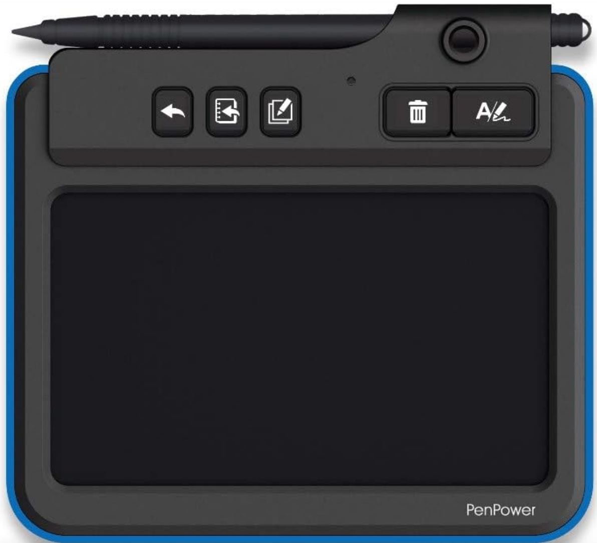
Image: A clear view of the PenPower Write2Go Anywhere pad and its accompanying digital pen.