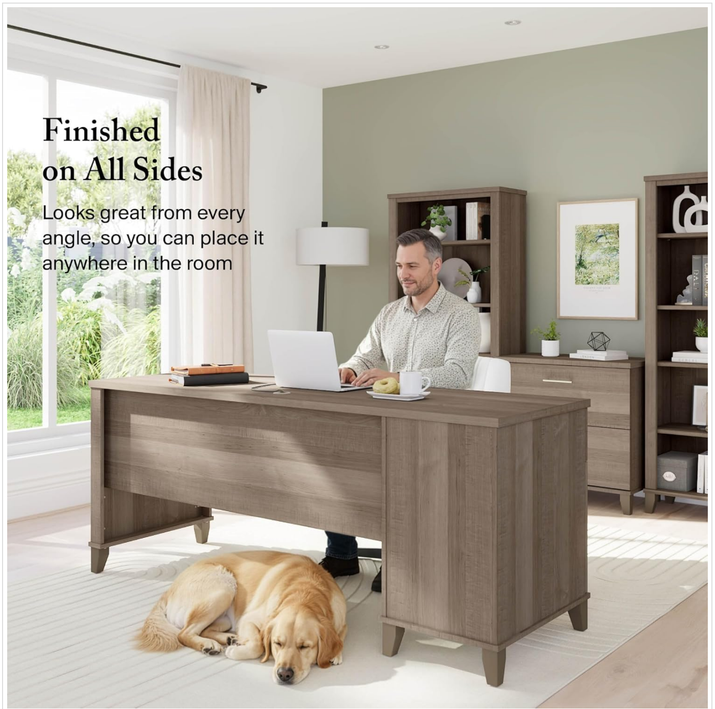
Image: A man working at the Bush Home Somerset Desk in a home office, with a golden retriever dog sleeping on the rug, showcasing the finished back of the desk.