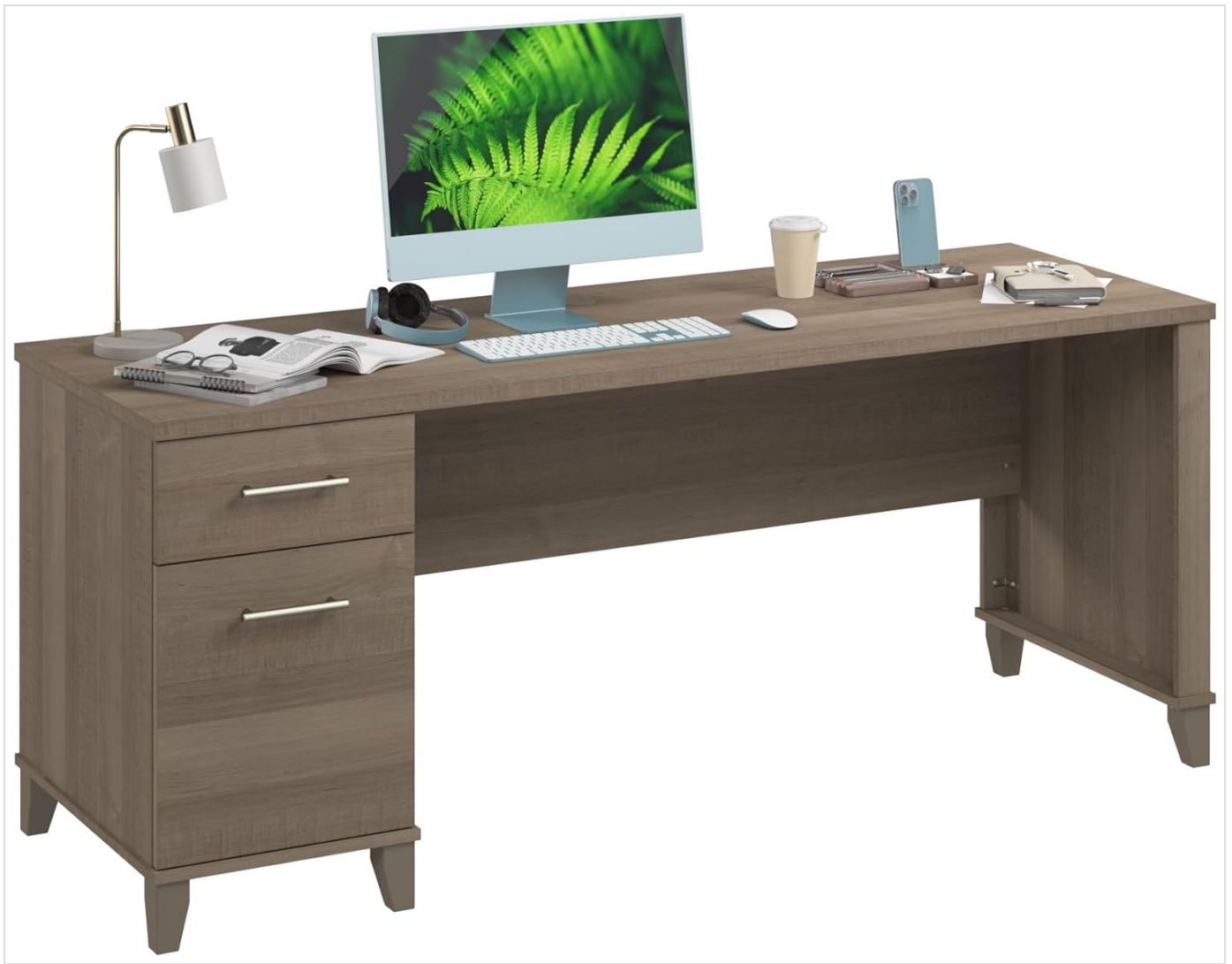
Image: Front view of the Bush Home Somerset 72-inch Home Office Desk in Ash Gray, featuring two drawers on the left and a wide desktop, with a computer monitor and accessories.