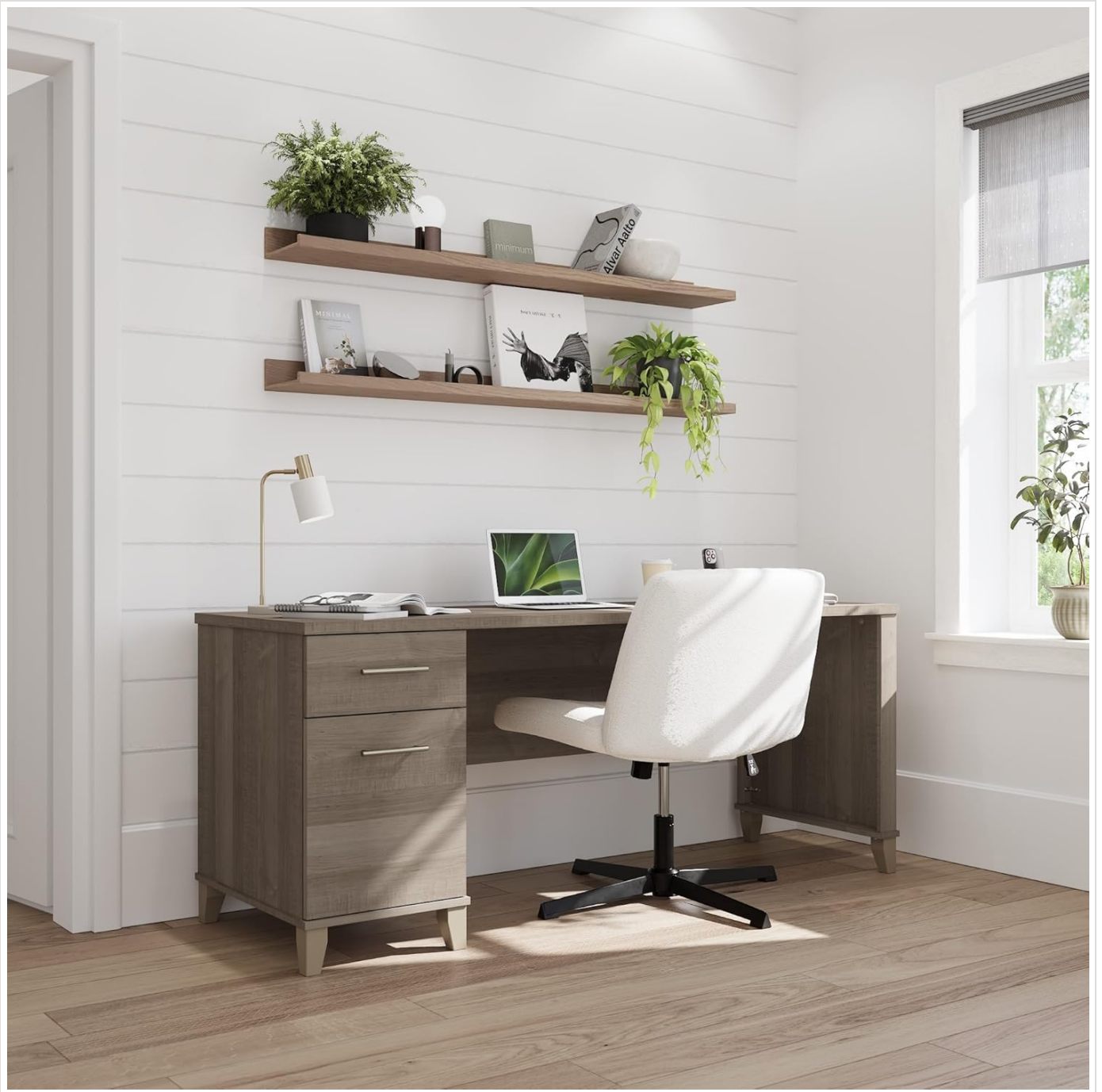
Image: Bush Home Somerset Desk with two drawers and open space for chair, shown in a home office setting with a laptop and plants.