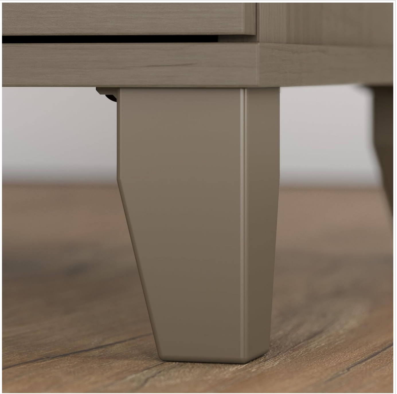
Image: Close-up of the corner of the Bush Home Somerset Desk, showing the Ash Gray finish and the clean edge of the desktop.