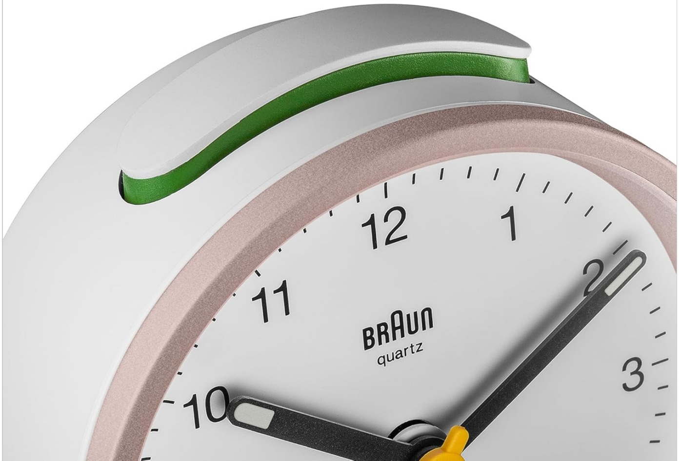
Image: Front view of the Braun Classic Analogue Alarm Clock, Model BC12PW. Shows the clock face with hour, minute, and yellow second hands, and the Braun quartz logo.

The beep alarm gets more frequent if you do not turn it off.