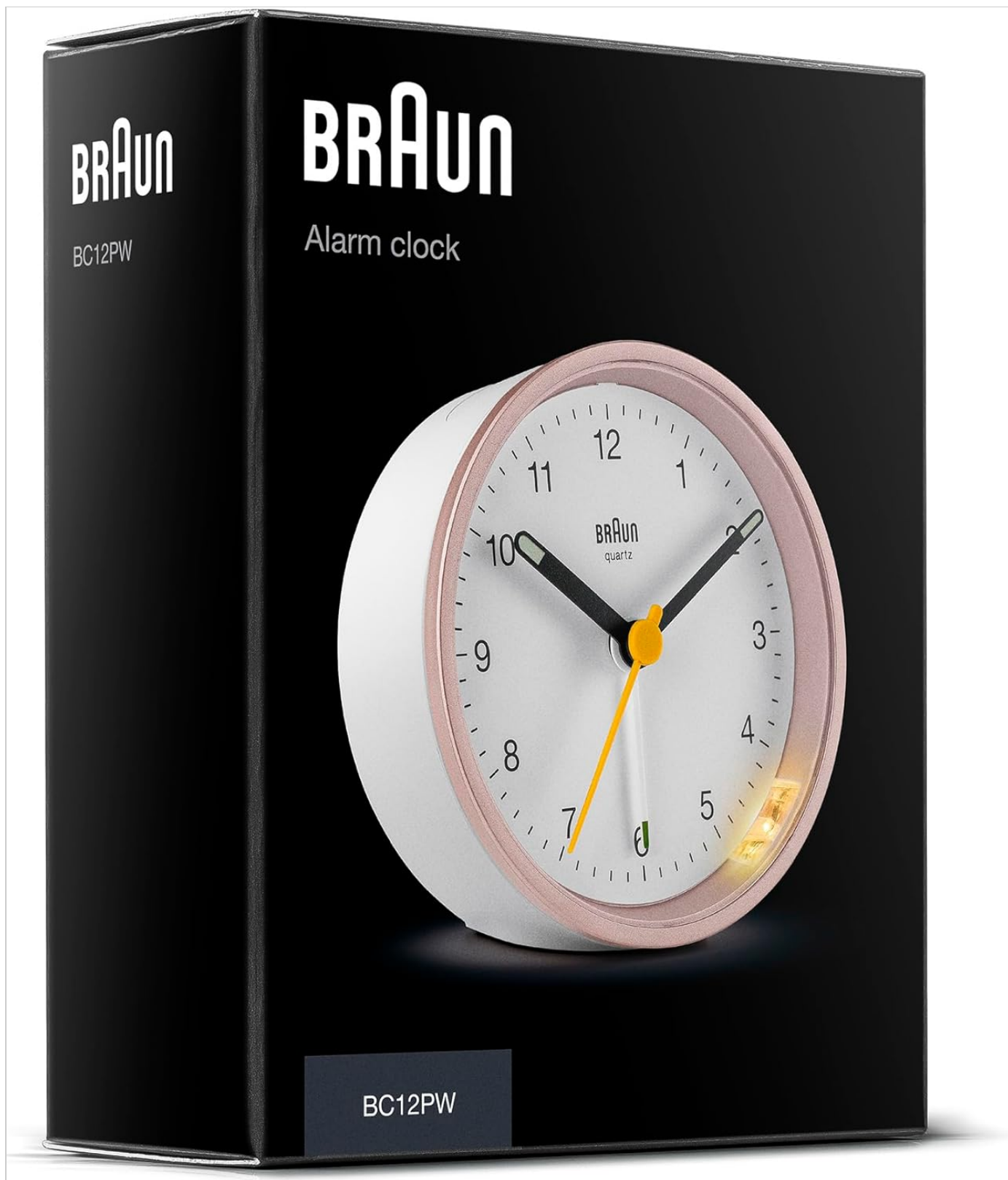
Image: A Braun alarm clock shown in a dark setting, with its hour and minute hands glowing brightly due to their luminous tips, enhancing visibility in low light conditions.

The hour and minute hands feature luminous tips that glow in the dark, allowing for easy time reading in low-light conditions.