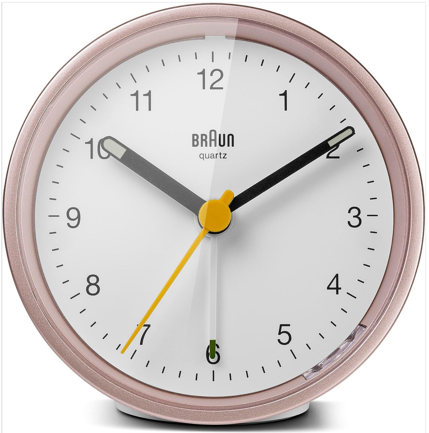
Image: A close-up of the Braun alarm clock face, emphasizing its quiet precision quartz movement. An icon depicting a head with sound waves crossed out indicates the silent operation.

The clock is equipped with a quiet precision quartz movement, ensuring accurate timekeeping without disruptive ticking sounds.