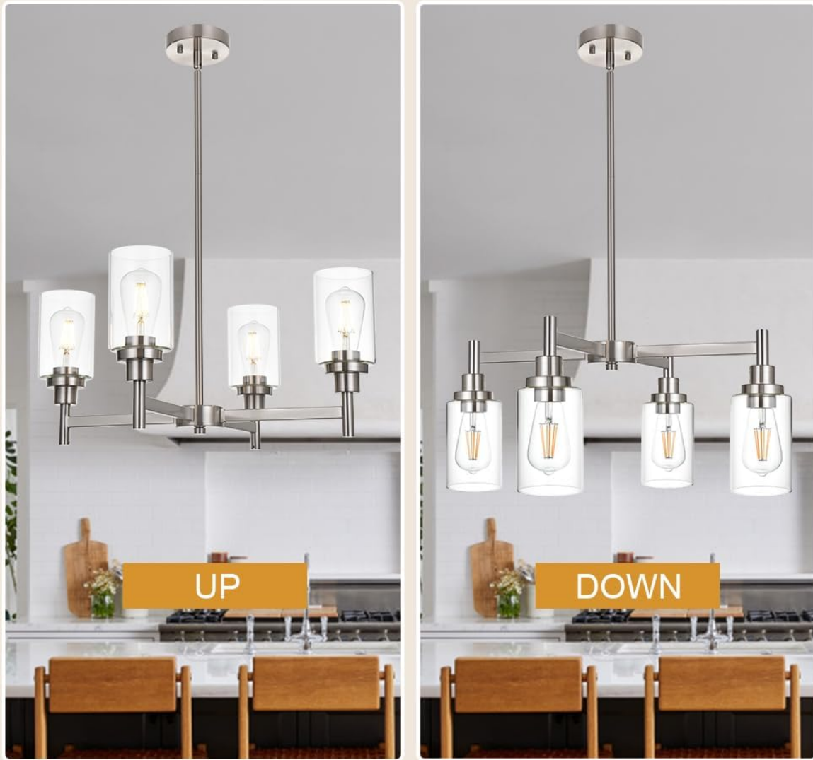
Image: Shows the chandelier with its glass shades oriented both upwards and downwards, demonstrating the adjustable light direction.