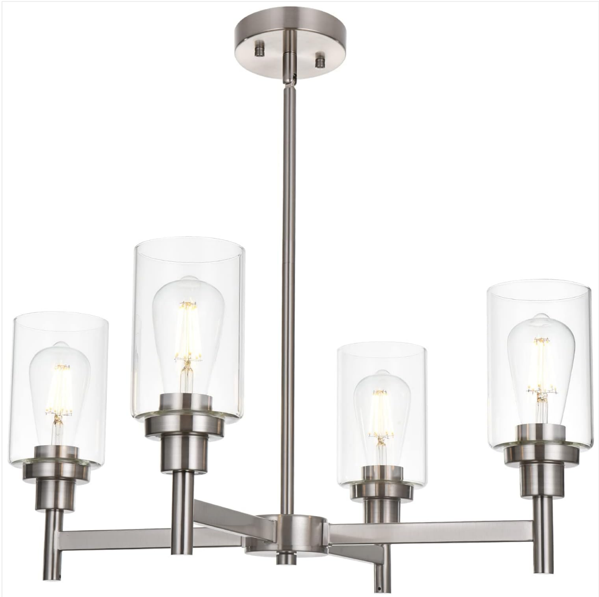
Image: Overview of the VINLUZ 4 Light Modern Chandelier, showing its main components and design.