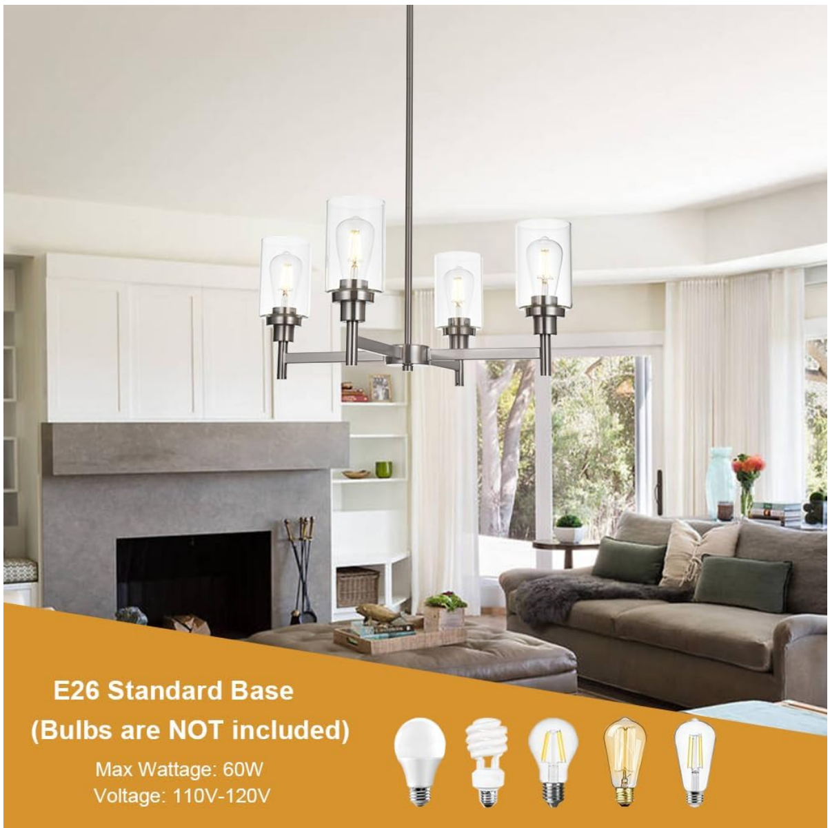
Image: Illustrates the E26 standard base and various compatible bulb types (LED, CFL, Edison, etc.) for the chandelier, with a maximum wattage of 60W.