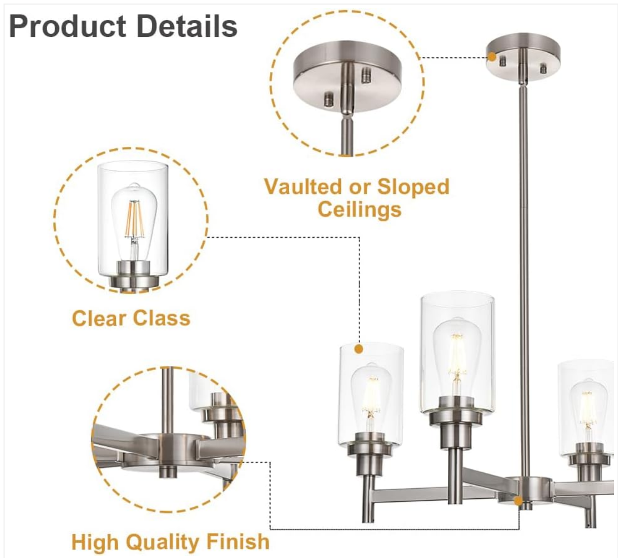
Image: Close-up details of the chandelier, highlighting the clear glass shades, the high-quality brushed nickel finish, and the swivel mechanism for vaulted or sloped ceilings.