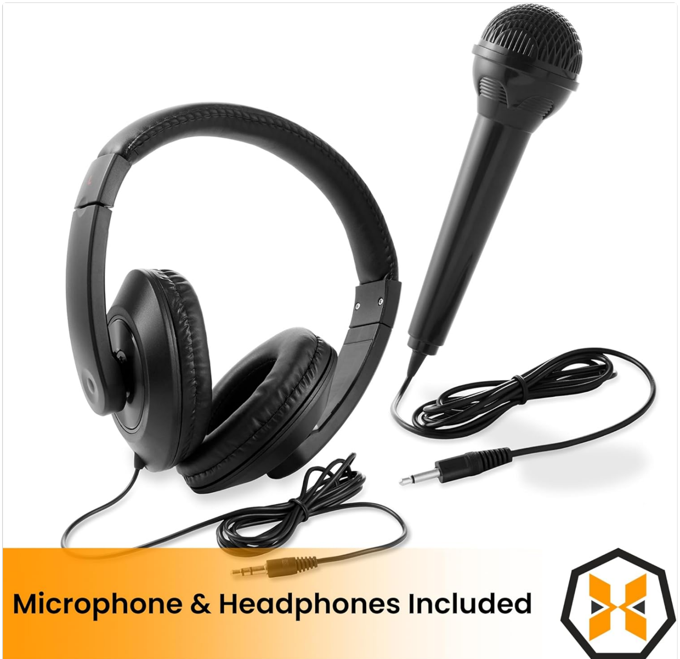
Image: Included microphone and headphones.