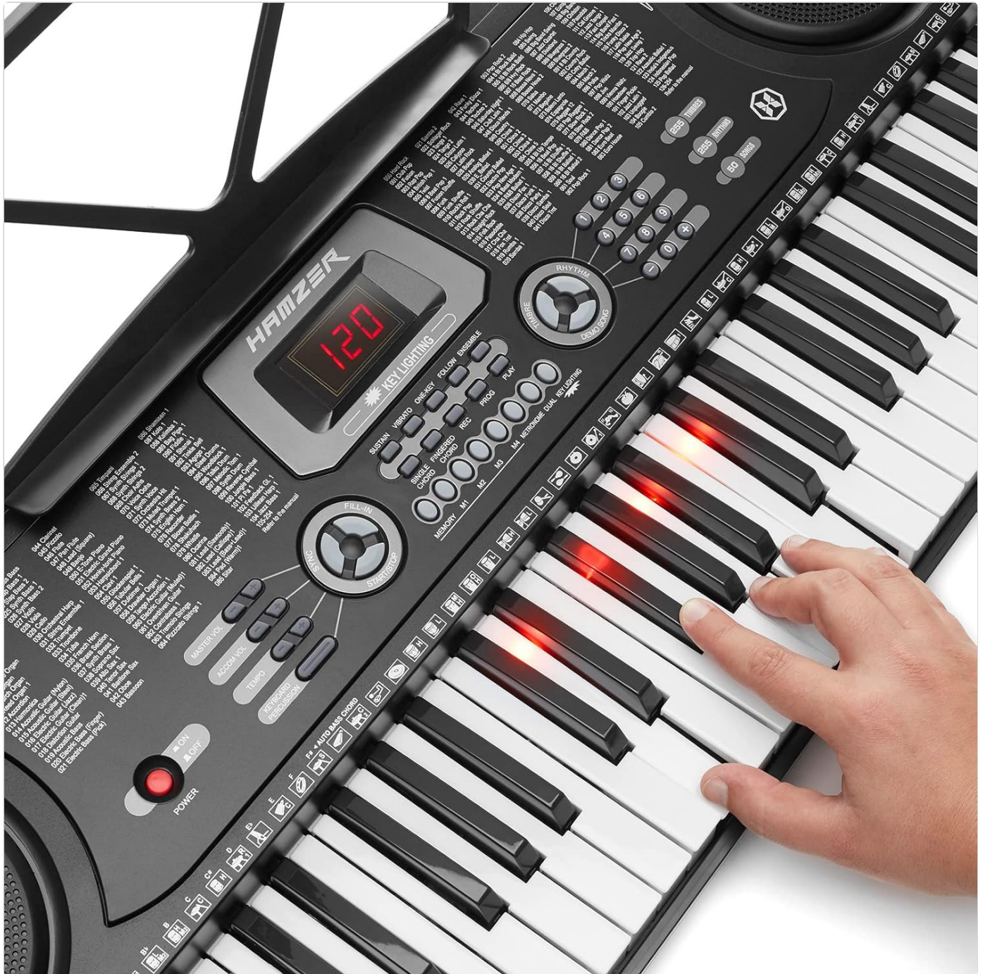
Image: Lighted keys feature in action.

Engage the KEY LIGHTING feature to activate the lighted keys. When playing a demonstration song or using the FOLLOW mode, the keys will light up to guide you on which notes to press. This feature is particularly useful for beginners.