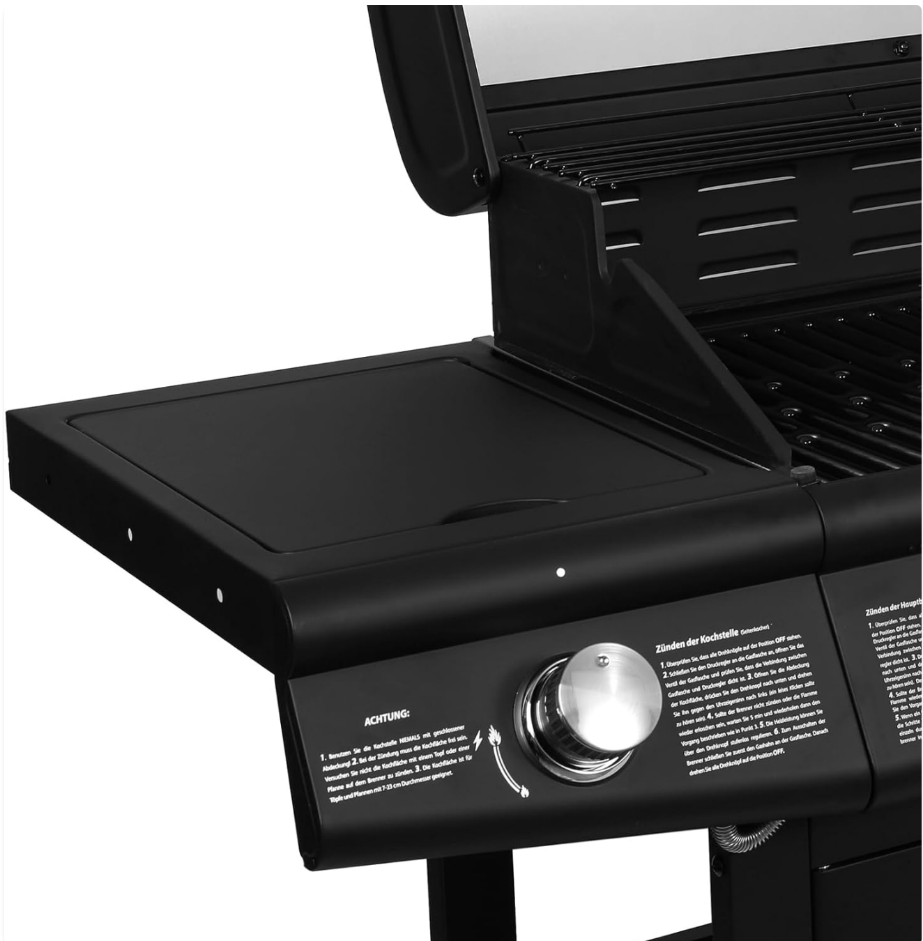
Image: Detail view of the side burner and its control knob, demonstrating the ignition area.