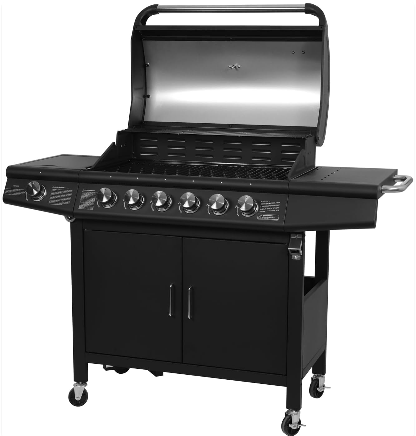
Image: View of the grill with the lid open, revealing the cooking grates and burner covers.