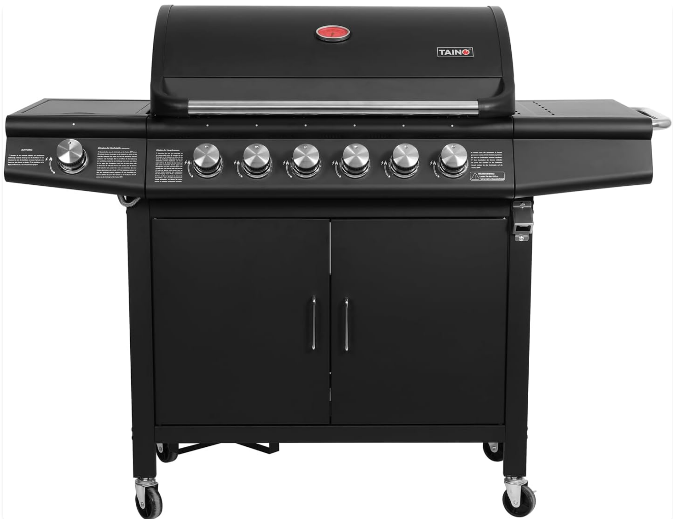
Image: Front view of the TAINO Red 6+1 Gas Barbecue, showcasing its sleek black design and control panel.