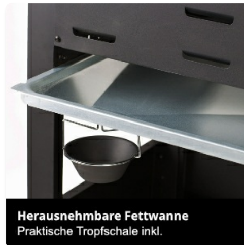
Image: Detail of the removable grease tray and its collection cup for easy cleaning.

The removable grease tray should be emptied and cleaned regularly to prevent grease fires. Allow it to cool, then slide it out and dispose of the grease. Wash with warm soapy water.