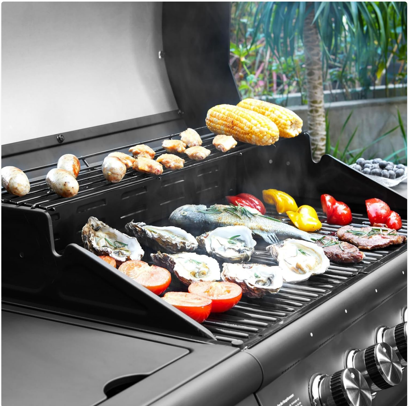
Image: The grill in operation, showing a variety of foods being cooked on the main grates and warming rack.