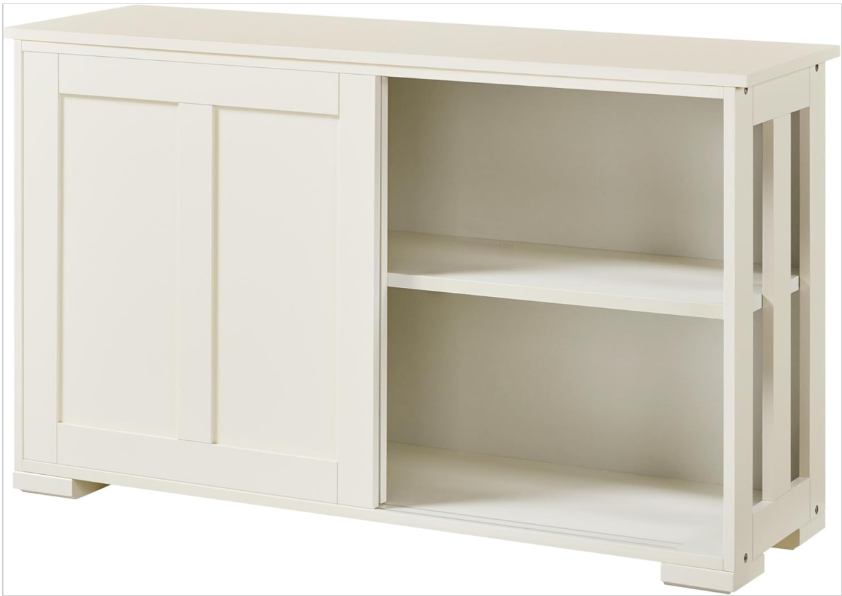
Image: Front view of the Yaheetech Buffet Cabinet in antique white, showcasing its two sliding doors and open shelf section.