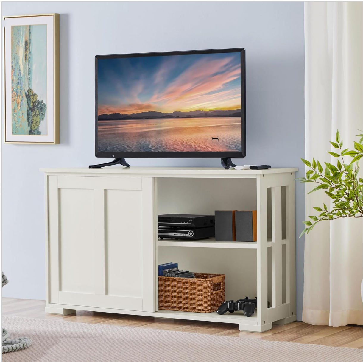
Image: The buffet cabinet functioning as a TV stand in a living room, demonstrating its adaptability for media storage.