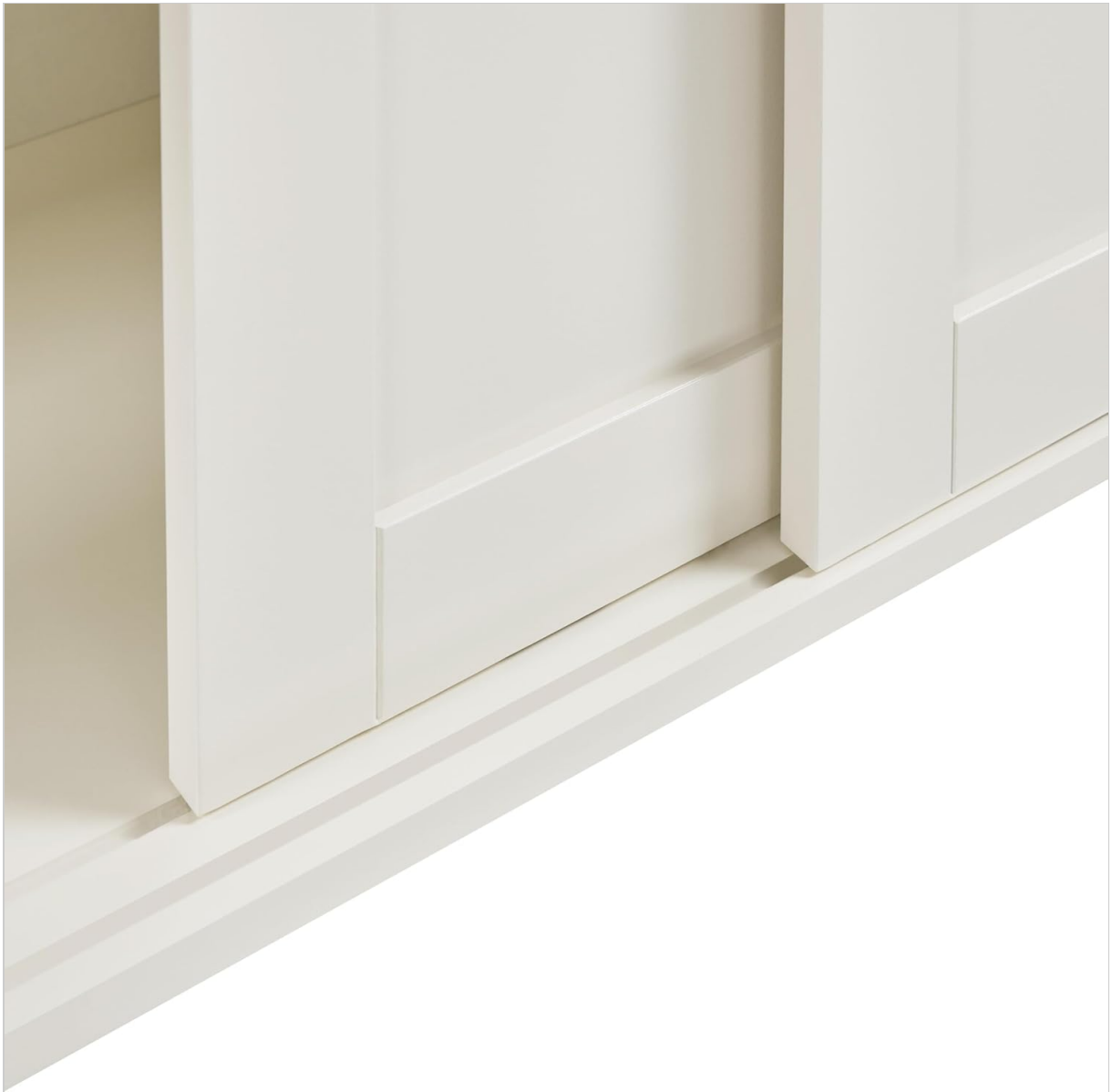
Image: A detailed view of the bottom sliding door track, illustrating the mechanism that allows the doors to move smoothly.