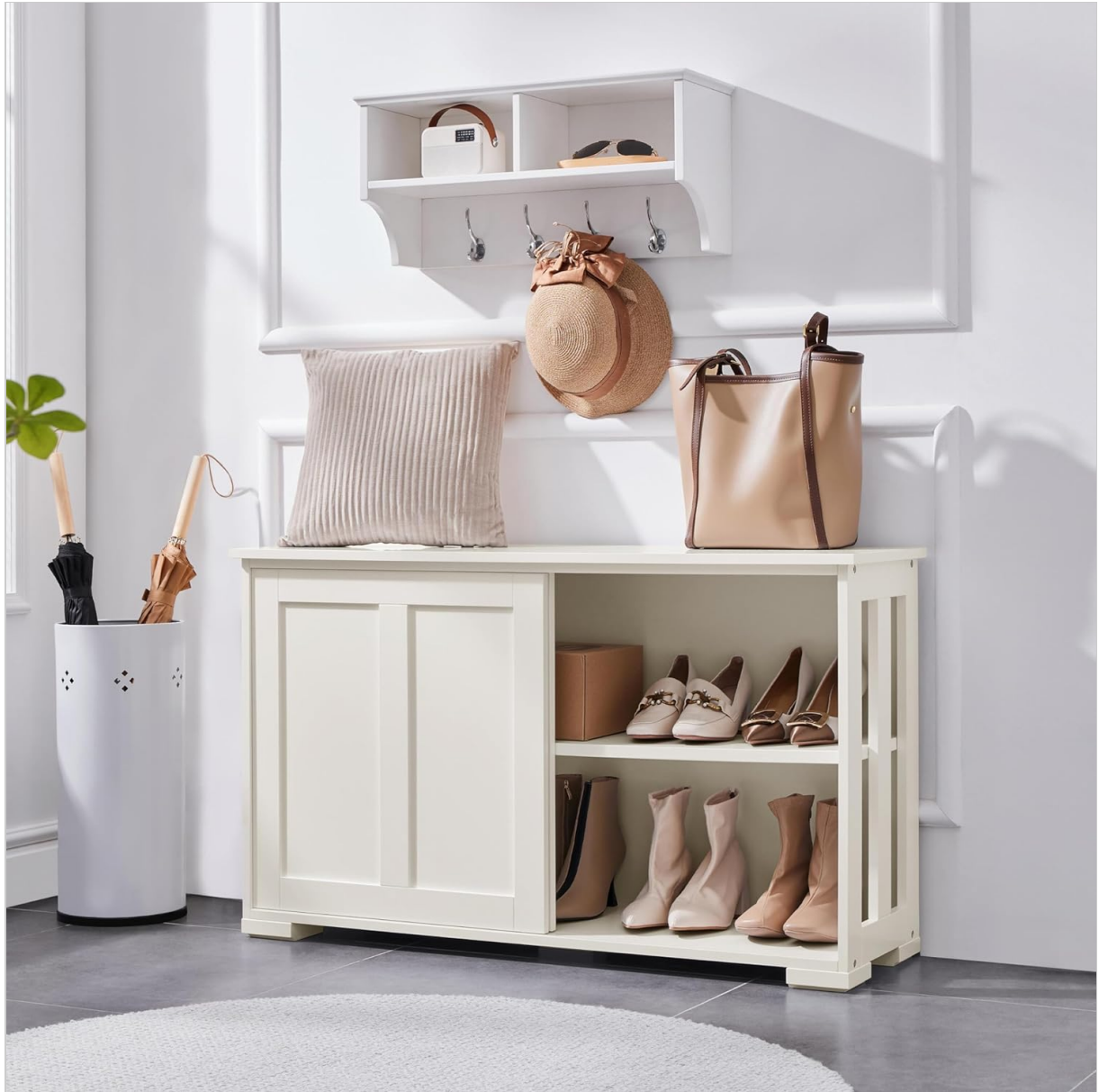
Image: The buffet cabinet placed in an entryway, used for shoe storage and displaying decorative items, demonstrating its versatile application.