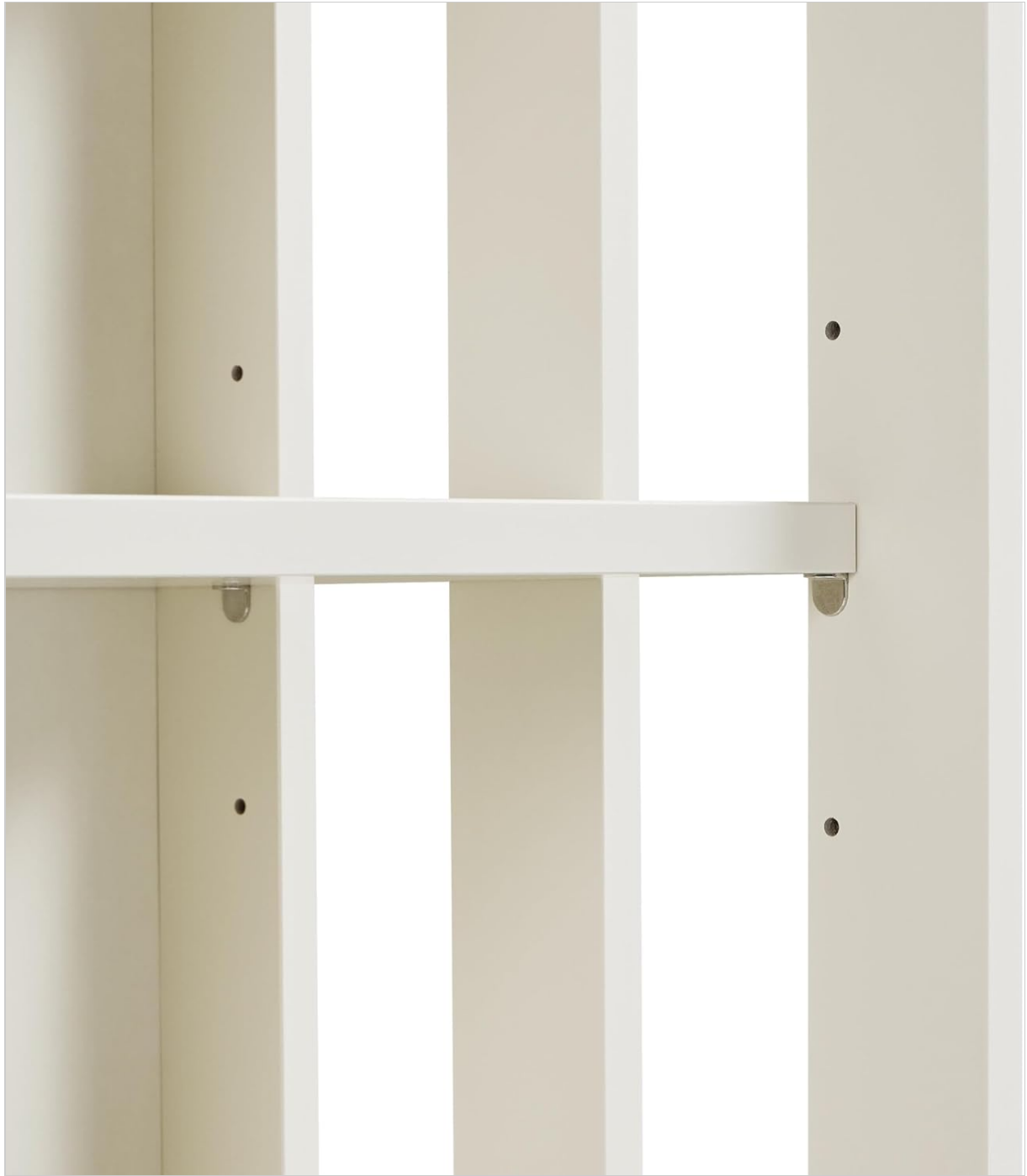
Image: A close-up view of the interior side panel, showing the pre-drilled holes for the adjustable shelf pins, highlighting the shelf's customizable height feature.