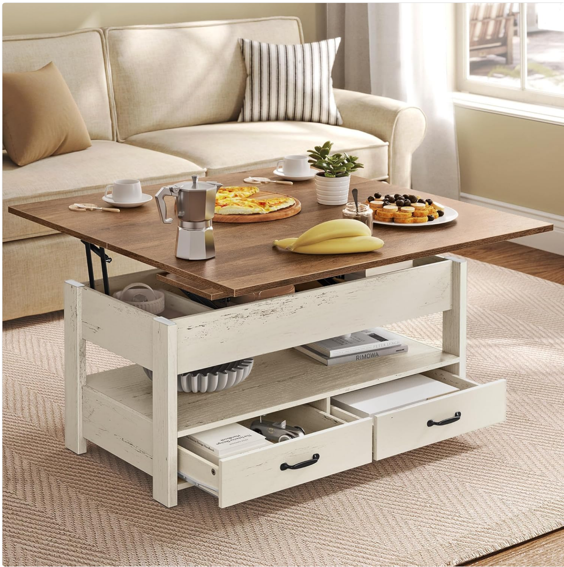
Image 1.1: The VASAGLE ULCT254W01 Lift-Top Coffee Table in a living room environment, showcasing its design and functionality.