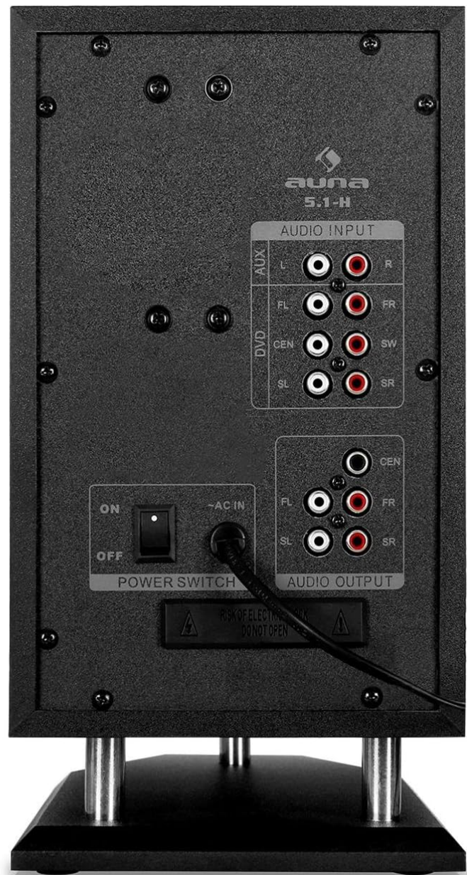
Image: Rear panel of the subwoofer, displaying the power switch, AC input, audio input (AUX, DVD/5.1), and audio output ports for satellite speakers.