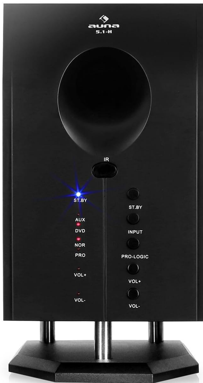
Image: Front panel of the subwoofer, showing input selection buttons, volume controls, and status indicators.

Subwoofer with low-vibration bass-reflex enclosure