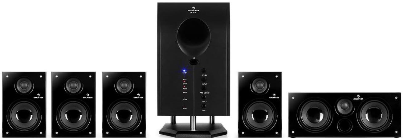
Image: The complete AUNA Areal Active 525 system, showing the subwoofer and five satellite speakers.