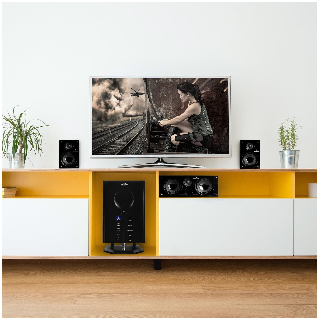
Image: Example of a 5.1 speaker setup in a living room, demonstrating recommended placement for the subwoofer, center, front, and rear satellite speakers relative to a television.