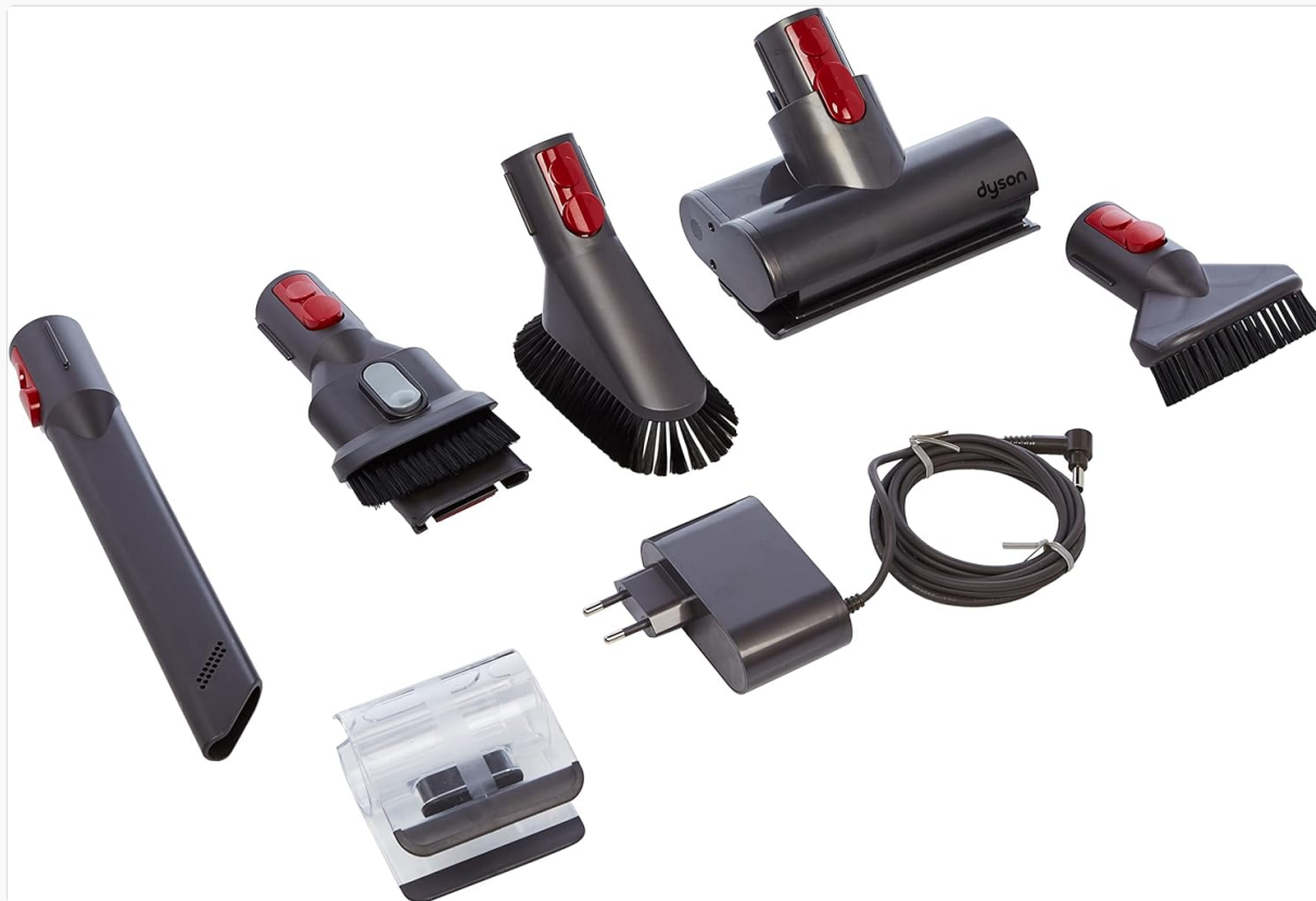
Image 1: Dyson V11 Torque Drive main unit and included accessories, such as the torque drive head, mini-motorized tool, crevice tool, stubborn dirt brush, soft dusting brush, combination tool, wand storage clip, docking station, and charger.

The Dyson V11 Torque Drive is a powerful cordless vacuum cleaner designed for deep cleaning across various floor types. It features intelligent optimization of suction and run time, real-time reporting via an LCD screen, and versatile attachments for comprehensive home and car cleaning.