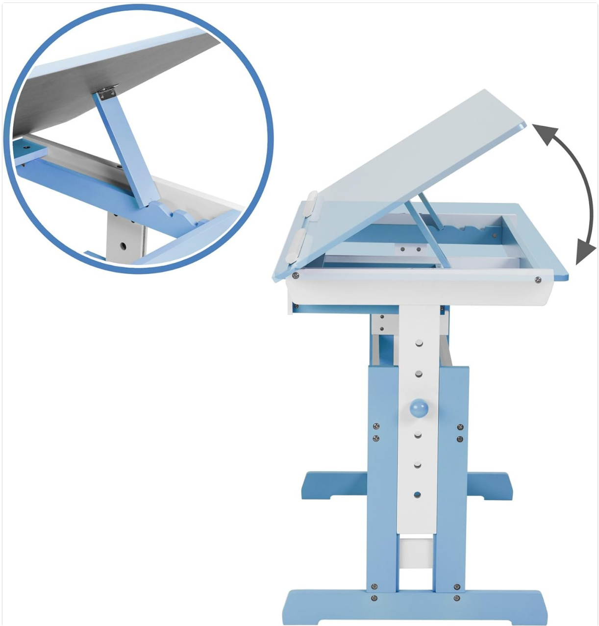
Figure 3: Detail of the desktop tilting mechanism.