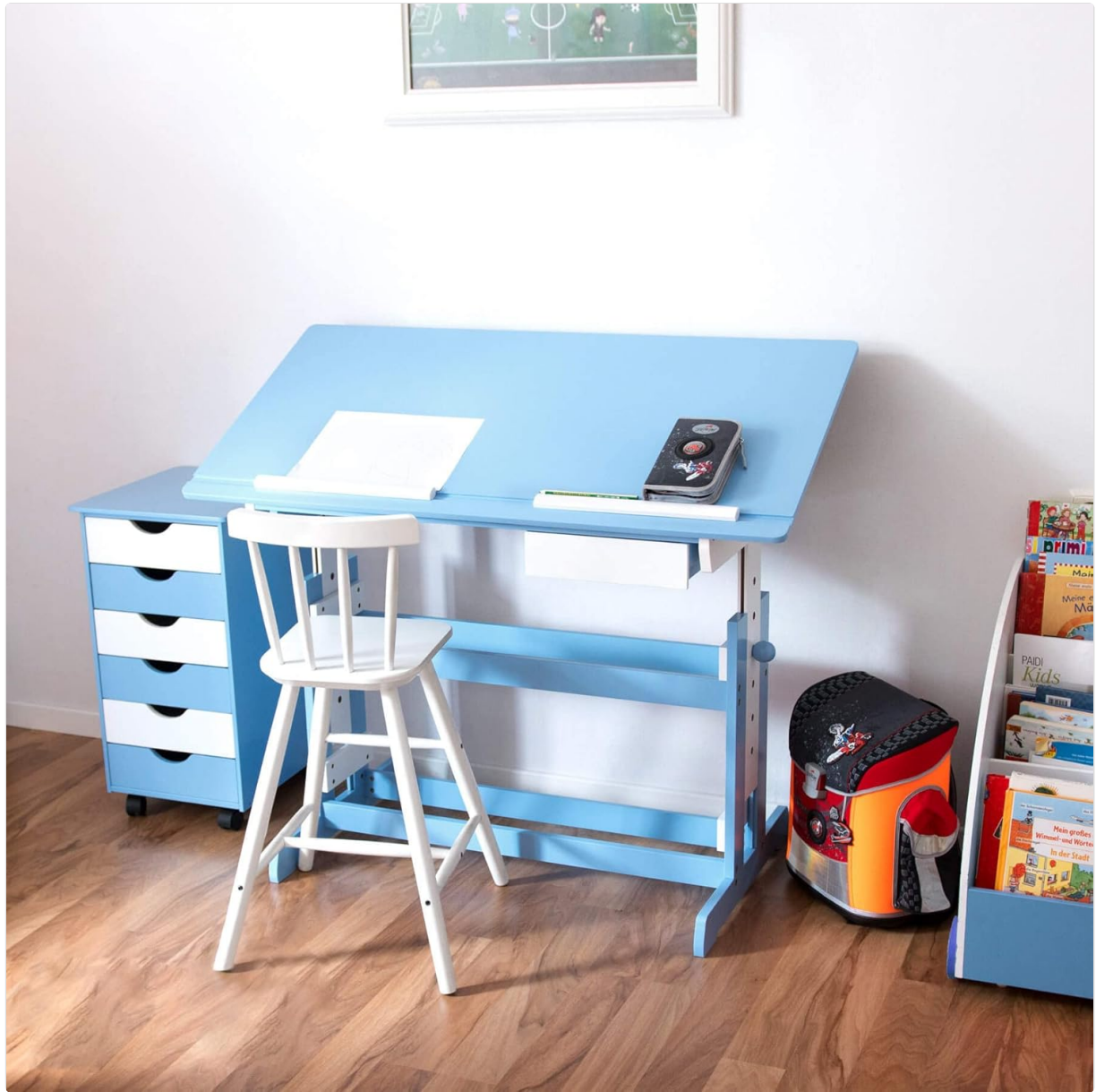
Figure 1: Fully assembled tectake Adjustable Height Tilting Desk.

Before assembly, ensure all parts are present and undamaged. Refer to the included parts list in your package for detailed identification.