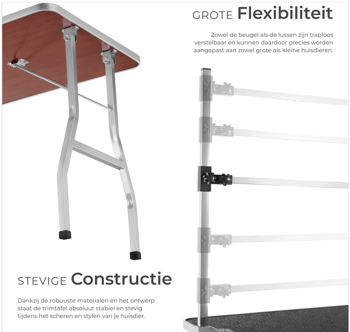
Figure 1: Illustration of the table's folding mechanism for compact storage.