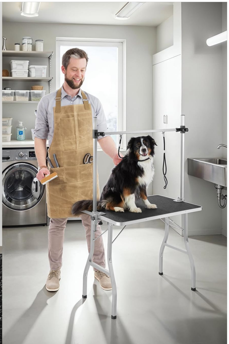
Figure 3: A dog comfortably positioned on the grooming table, secured by the adjustable straps.