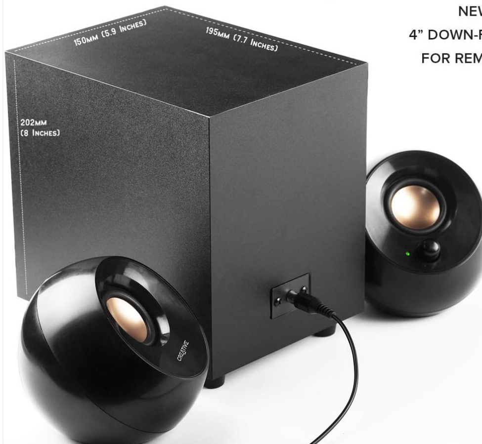
Image: Rear view of the Creative Pebble Plus subwoofer, showing its dimensions (202mm x 150mm x 195mm) and the input ports for the

NEWLY DESIGNED STANDALONE 4" DOWN-FIRING PORTED SUBWOOFER FOR REMARKBLE POWER AND DEPTH