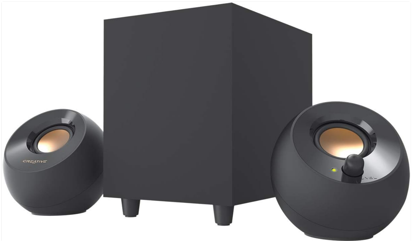
Image: The Creative Pebble Plus 2.1 speaker system, showcasing the two compact satellite speakers and the larger, cubic subwoofer, as they appear out of the box.