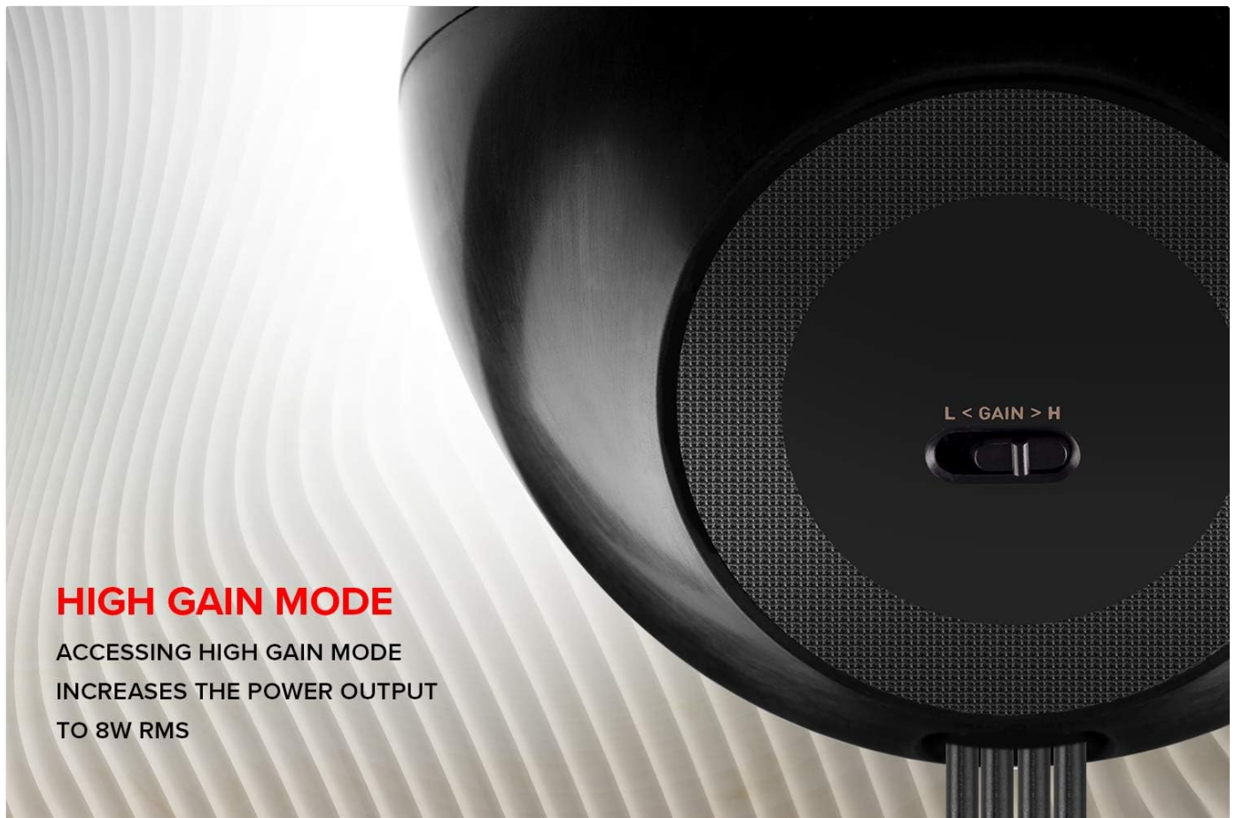
Image: A close-up view of the High Gain Mode switch located on the underside of one of the satellite speakers, showing 'L' (Low Gain) and 'H' (High Gain) settings.

For increased power output and stronger bass performance, activate the High Gain Mode. This mode boosts the total RMS power output to 8W. To enable High Gain Mode, locate the switch on the bottom of the right satellite speaker and slide it to the 'H' position.