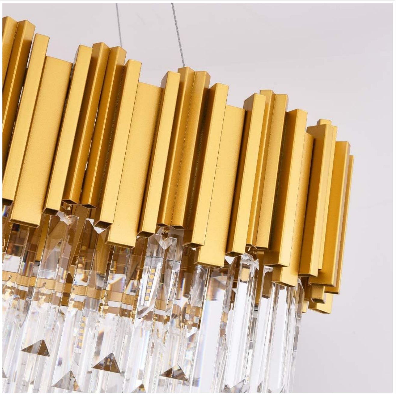
Image 4.2: Close-up view of the chandelier's spray-painted gold finished frame, showcasing the quality of the metalwork.