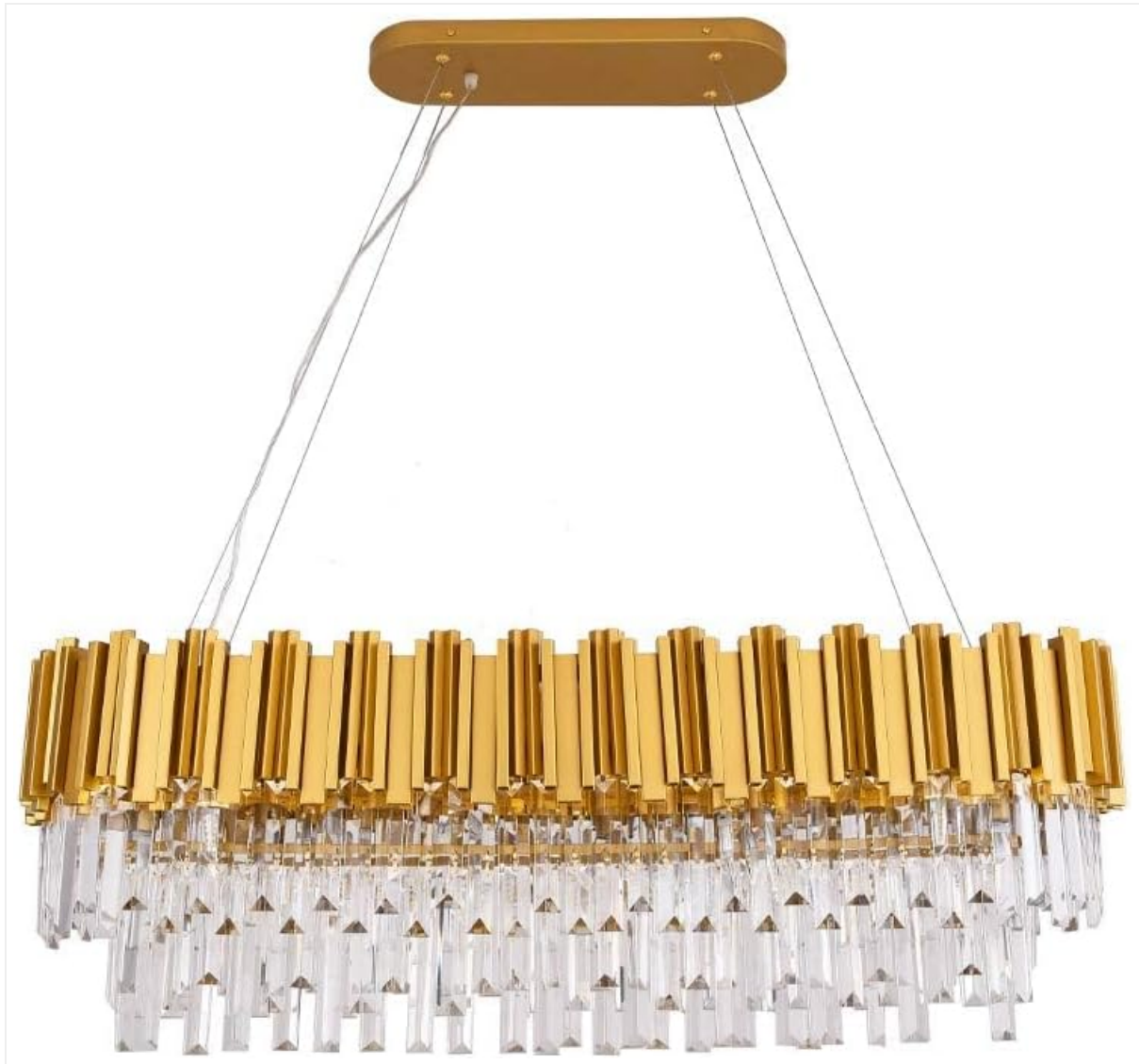
Image 3.1: Overview of the MEELIGHTING W35 Linear Modern Crystal Chandelier.