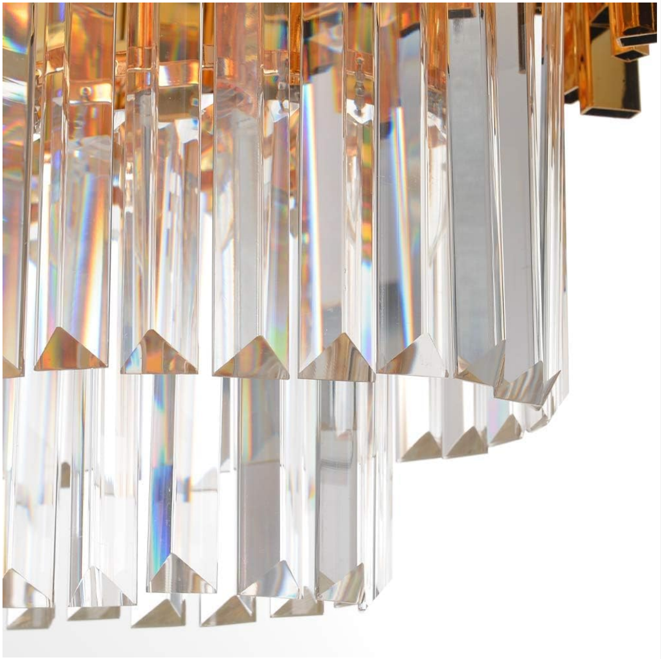
Image 4.3: Detailed view of the K9 crystal prisms, illustrating their clarity and light-refracting properties.