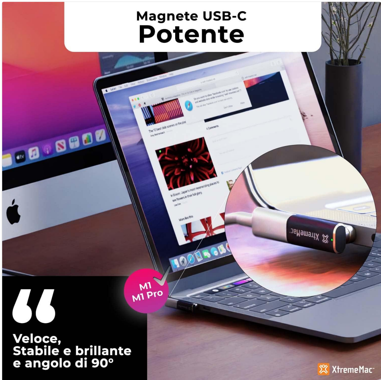
Image: The magnetic adapter detaching from a laptop, illustrating its 'Drop Safe' feature to prevent damage.