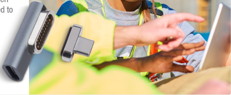
Image: A close-up view of the magnetic adapter showing the two parts connecting and the LED indicator for active connection.

The adapter's ultra-strong magnet keeps your USB-C cable securely connected to the port, but safely disconnects when sudden stress or pressure is applied to the cable.