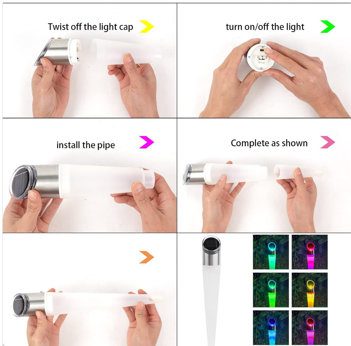
Image: Step-by-step visual guide for activating the light and assembling the components.