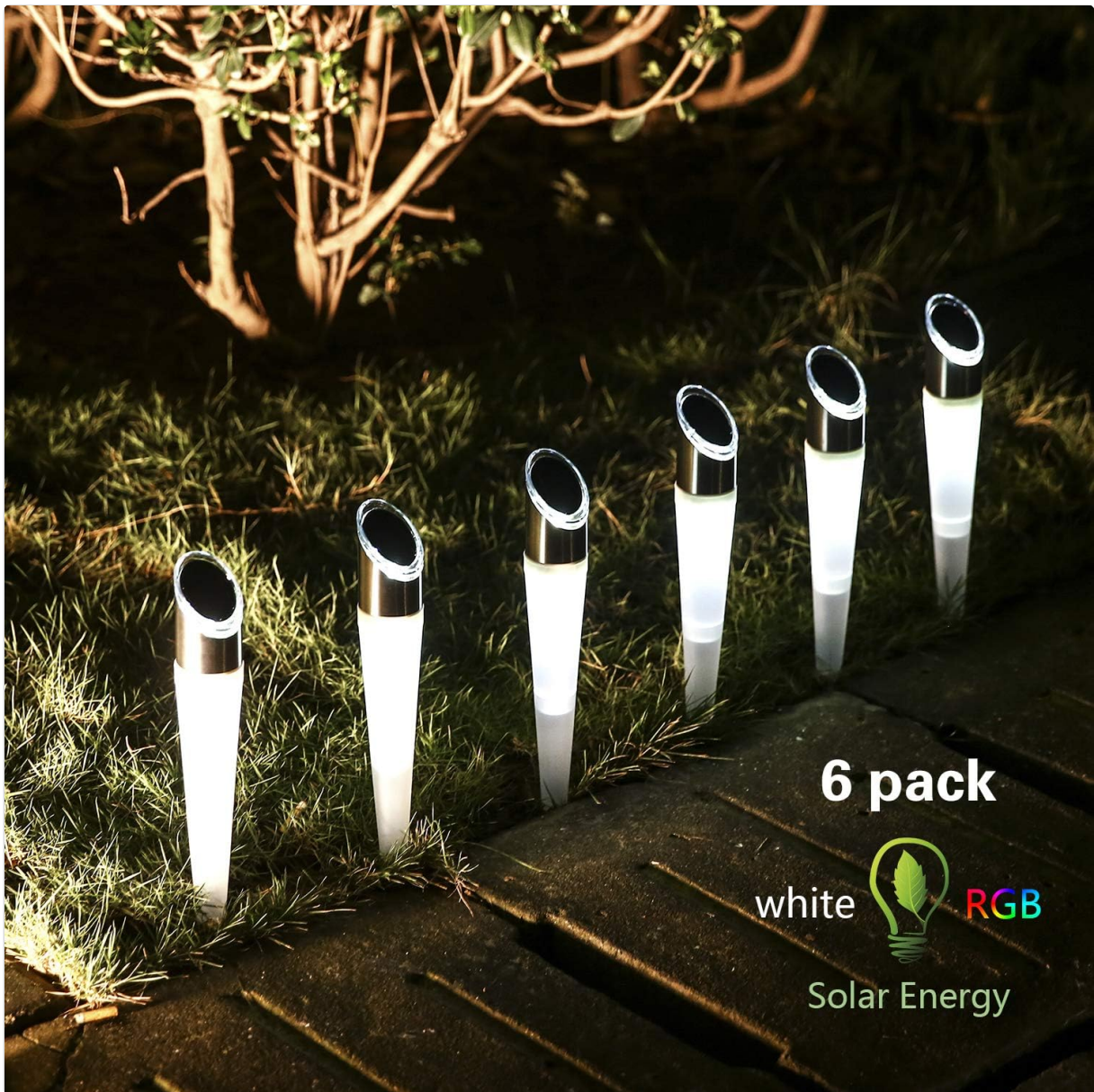
Image: Six solar pathway lights installed along a garden path, glowing brightly at night.