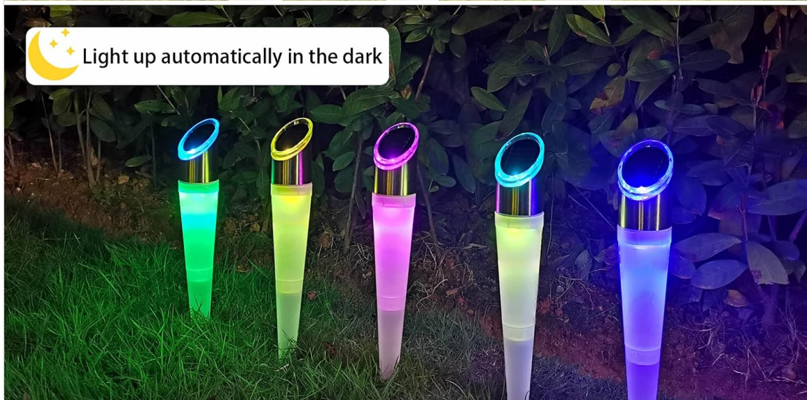
Image: Illustration of the solar lights charging during the day and automatically illuminating at night.