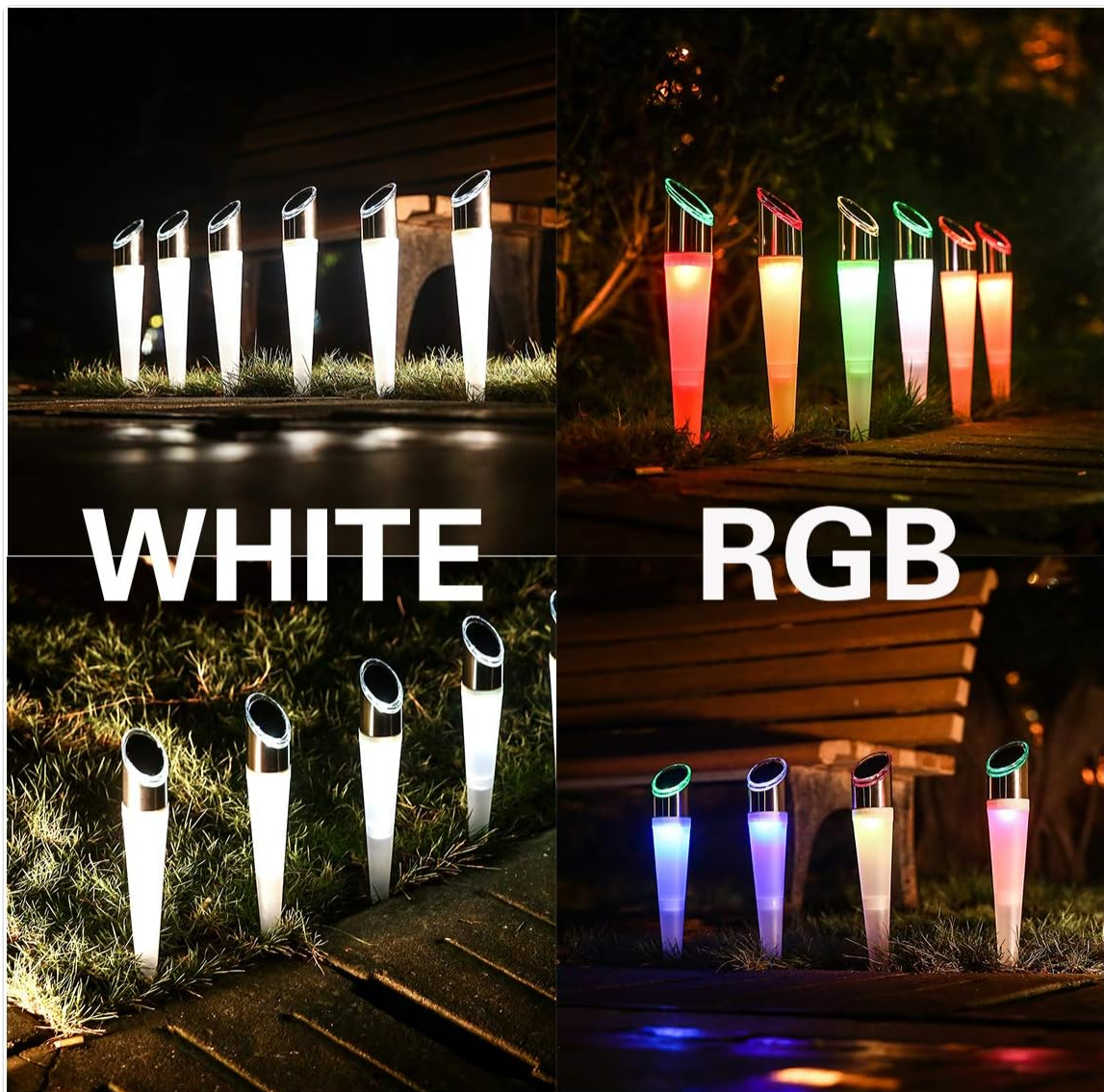
Image: A split image demonstrating the white light mode and the RGB color-changing mode of the solar lights.