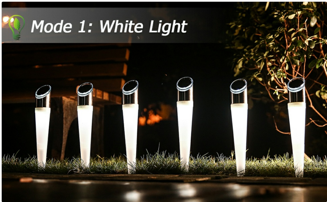
Image: Lights displaying the steady white light mode.