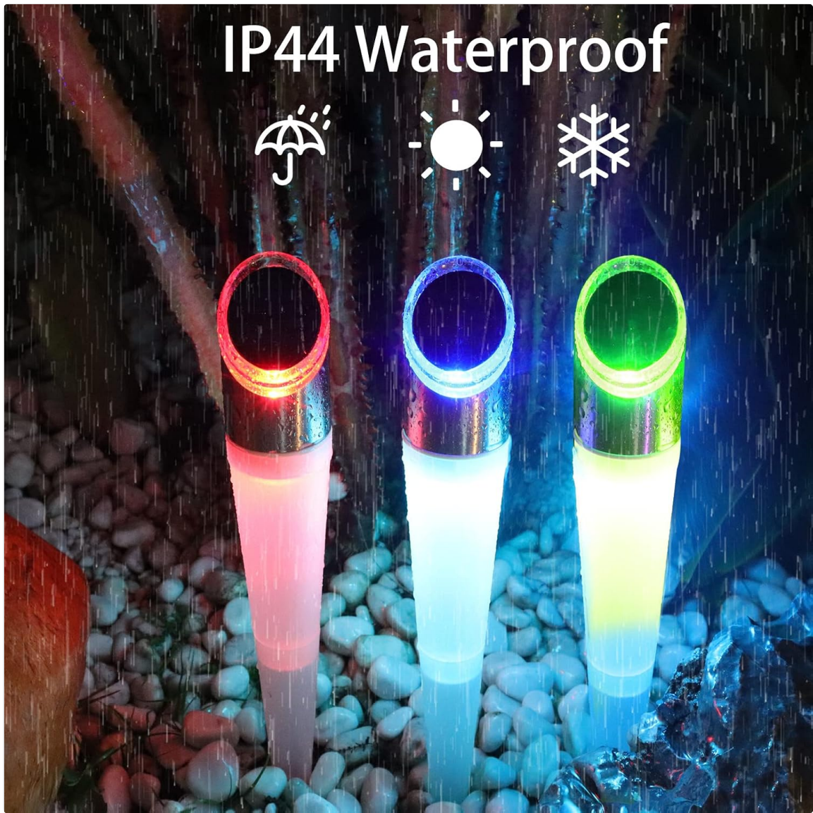
Image: Three solar lights demonstrating their waterproof design under simulated rain.