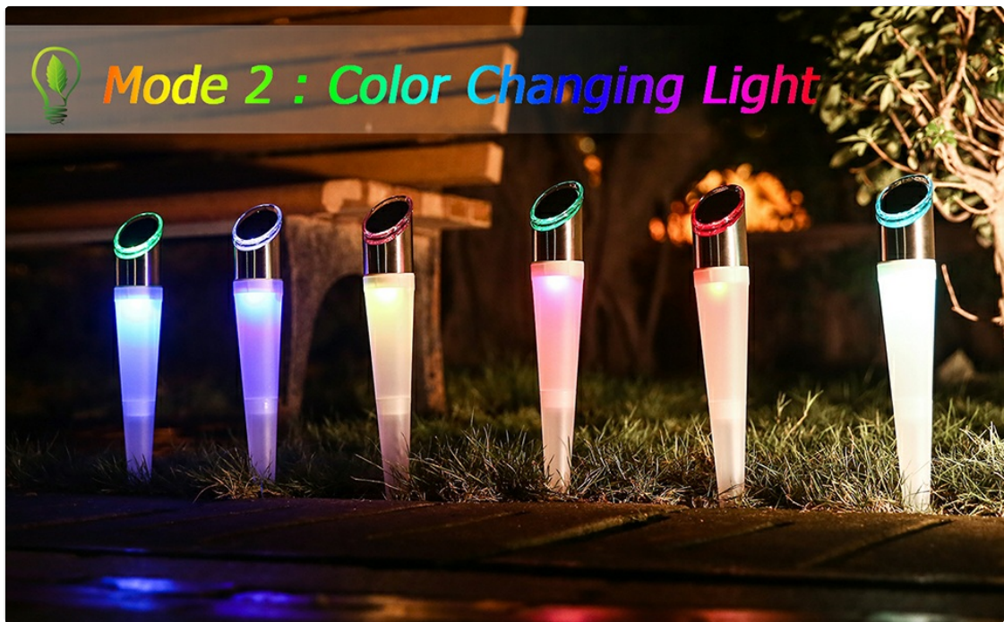
Image: Lights displaying the color-changing RGB mode.