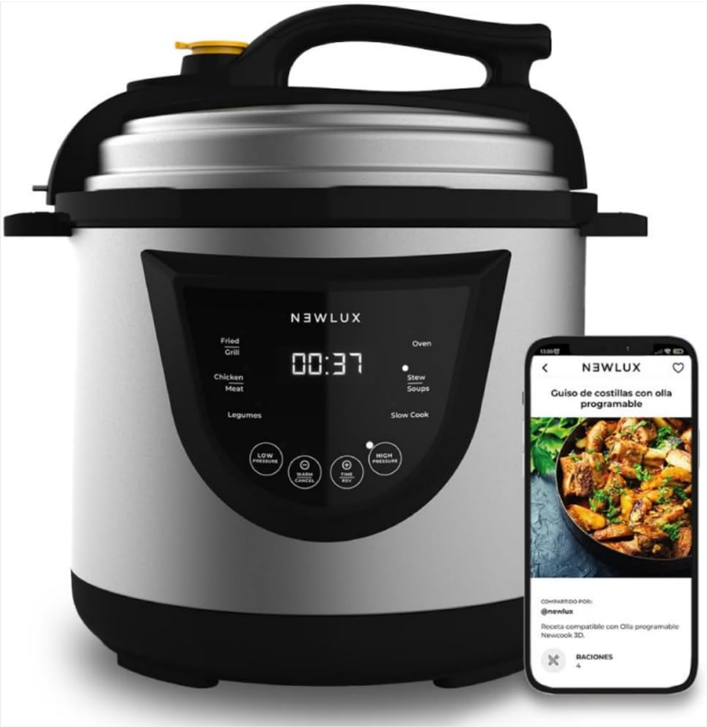
Image: The NEWCOOK NK7276 Electric Pressure Cooker, featuring its stainless steel body, black control panel with digital display, and a smartphone displaying a recipe application. This image illustrates the cooker's modern design and smart capabilities.

Familiarize yourself with the various parts of your electric pressure cooker.